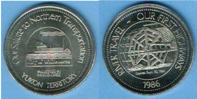
Salute to Northern Transportaton – Whitehorse $1 Token River Travel – Our First Highways – 1986