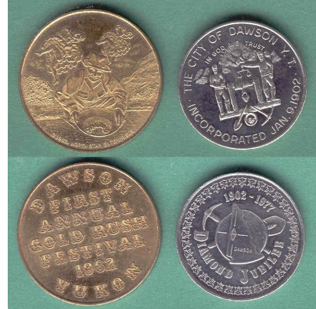
L: Souvenir Medallion – First Annual Gold Rush Festival 1962, Dawson, Yukon R: Souvenir Medallion – Dawson City Diamond Jubilee 1902-1977