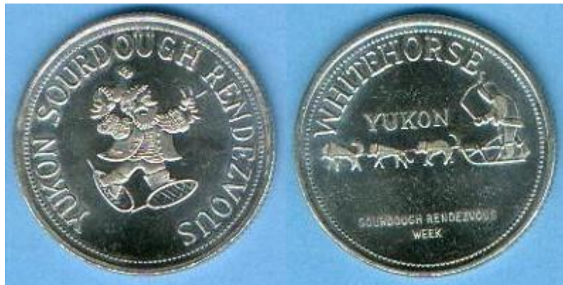
Sourdough Rendezvous – Whitehorse (undated)