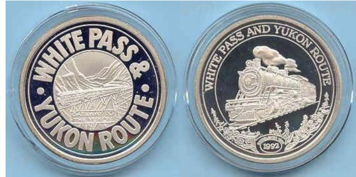
WP & YR 1992