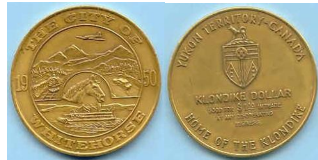
Klondike Dollar (undated)