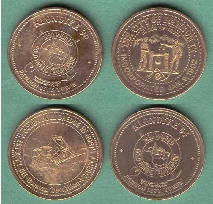
L: Klondyke '90 $1 Token – Largest wooden hull Dredge in North America – Bonanza Creek R: Klondyke '84 $1 Token – The City of Dawson, YT – Incorporated Jan. 9, 1902