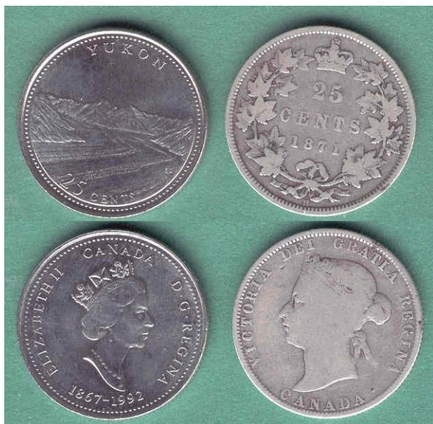
L: Canada Quarter 1867 – 1992, Yukon (glacier), Elizabeth II R: Canada 25 Cents 1871, Queen Victoria

[You might wonder why I put this 1871 25¢ in here. 1 st : I thought it would be interesting, like the Yukon Centennial medallion, showing our first and current queens, and 2 nd : When I was about 11 (ie. '54), my dad gave me two quarters to go to a Friday night movie at the old Capital Theatre. The movie was 35 cents and popcorn 15 cents. While standing in line on the entrance ramp, I just happened to look at these quarters. I saw that one was quite different, so I put it in my other pocket, and borrowed another quarter from a friend. As you can see, I still have the old one, and for me, it's a Yukon quarter].