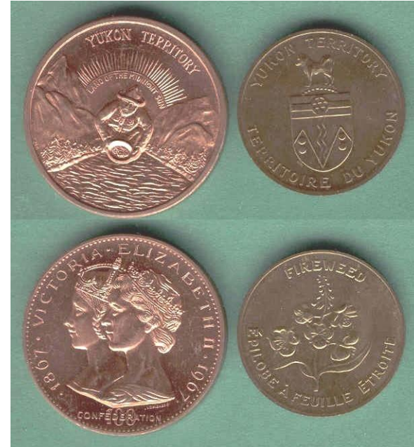
L: Confederation Centennial 1867–1967, Victoria–Elizabeth II R: Yukon Territory – Fireweed / Épilobe à Feuille Étroite