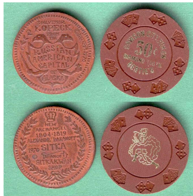
L: Sitka– Russian American Capital of Alaska, New Archangel 1804-1819, Alexander Baranoff – 1970 Souvenir Kopek, Sitkakwan Shop (leather).

R: Dawson City – Diamond tooth Gertie's – Gaming token/ Poker chip (plastic).