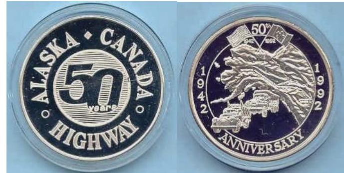
Alaska Highway 1942-1992, 50 th Anniversary