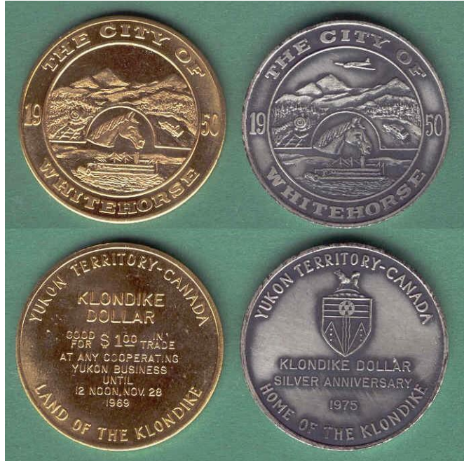
L: Klondike Dollar 1969 R: Klondike Dollar 1975