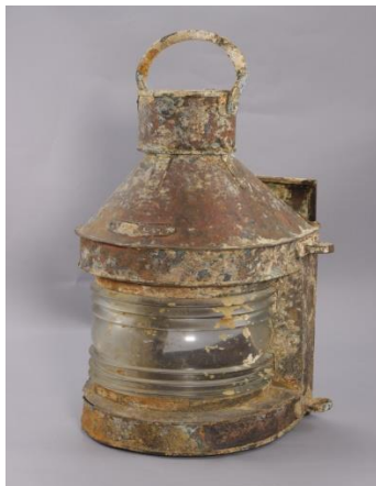
Photo: Princess Sophia's lantern, artefact from the Alaska State Museum collection.

This portion of the Exhibition will travel to major city centres in BC, Yukon, and Alaska, and will be available in each city for three months. For specifics on travel locations and dates, please see our Travelling Details page.