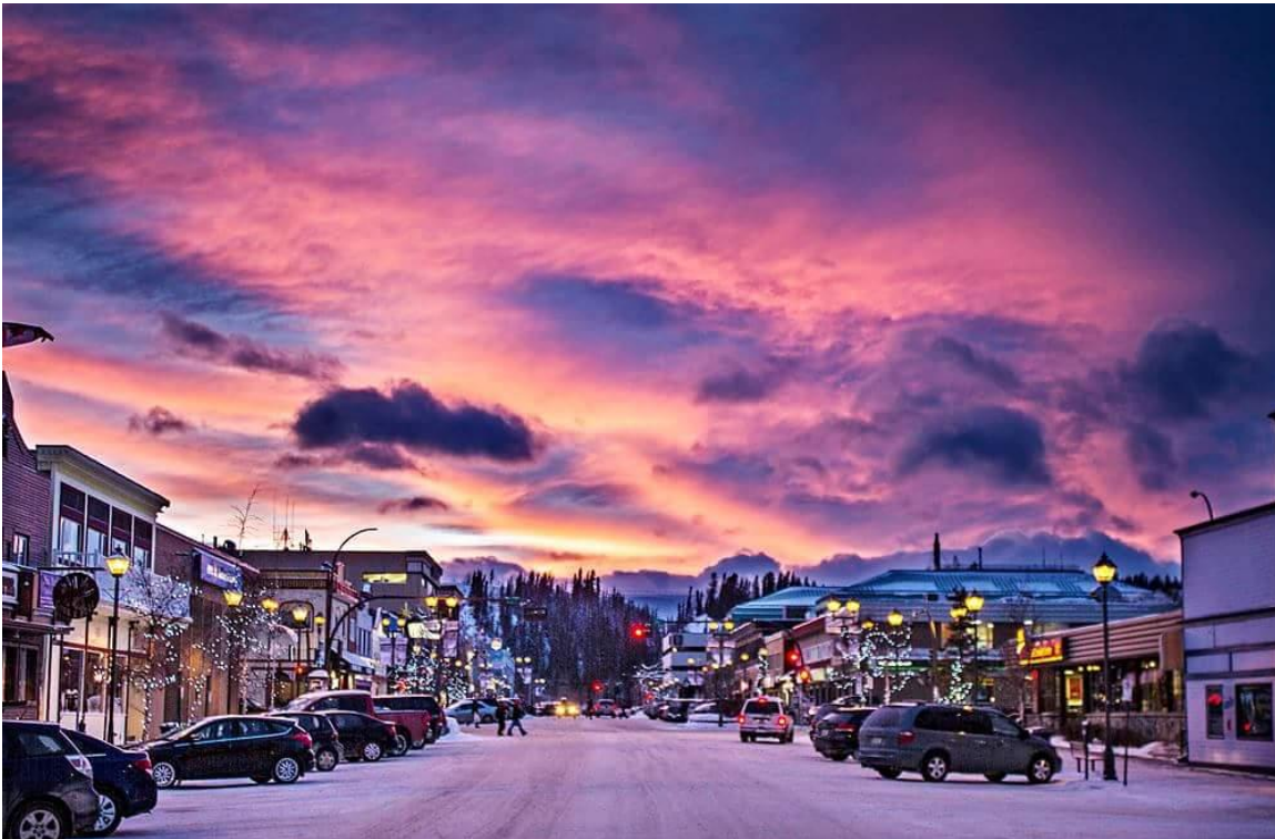
Main Street Whitehorse - August 2016

250-385-4222 ext. 115 info@princesssophia.ca 634 Humboldt St. Victoria, BC V8W 1A4