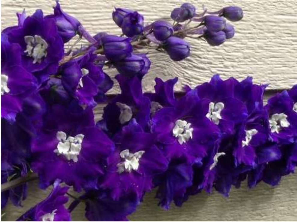
White centered Delphinium

To use an e-mail address from the MocTel, replace the * with @.