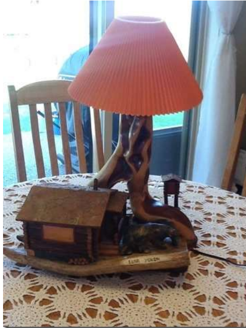
Diamond Willow Lamp – Elsa, Yukon

Manager, Keno City Mining Museum kenoroulette@northwestel.net Site 1 Box 17, Keno City Yukon, Y0B 1M1 867.995.3103