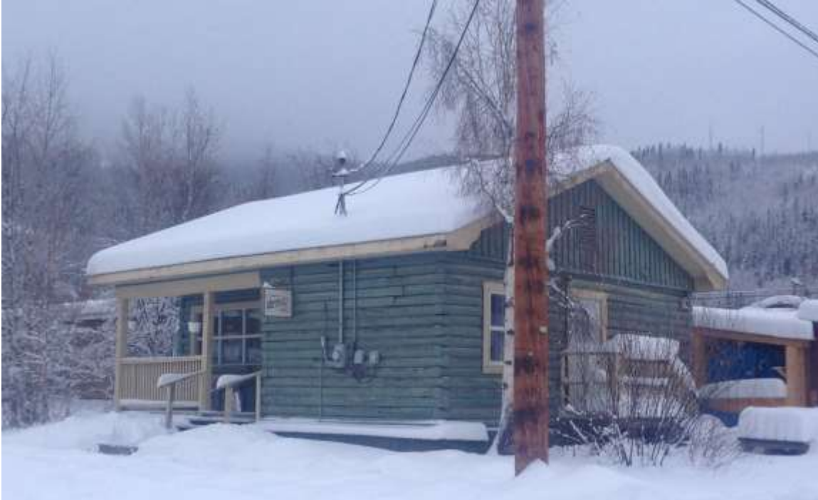
DCMF Office. Dawson recycles. The DCMF works out of this building on 3 rd Avenue, which was once the HQ of CFYT-fm and used to be located on 5 th Avenue.