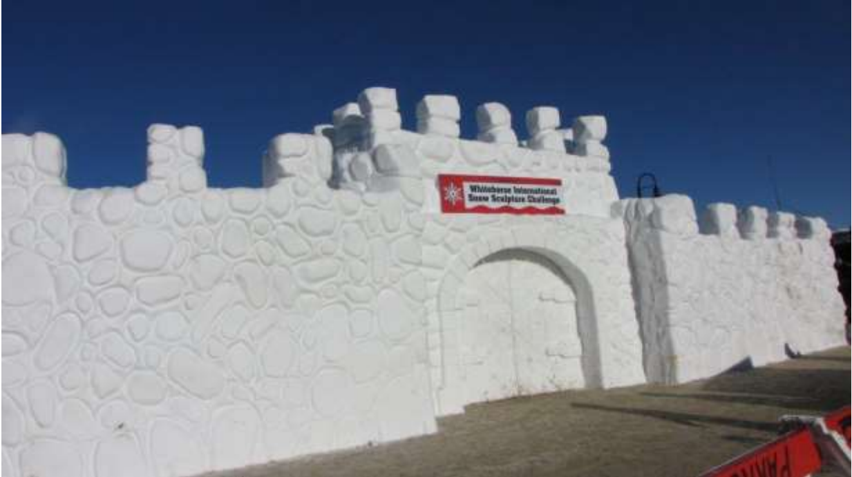
Whitehorse International Snow Sculpture Challenge (In Whitehorse)