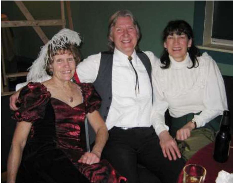
Watch Party 3.