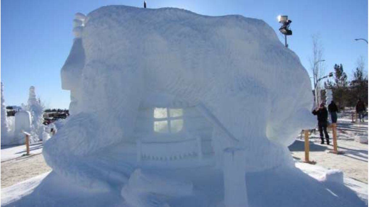
Team Alaska 4