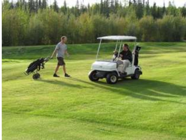
Top of World - Walking and riding.