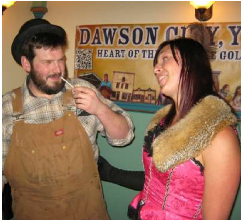
Watch Party 2.

Photo courtesy Dan Davidson uffish@northwestel.net (In Dawson)