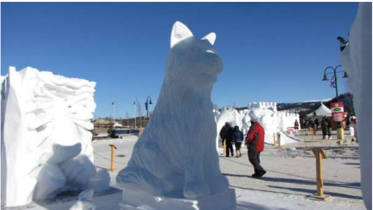
Team Colorado 2

Photo courtesy Donna Clayson bdclayson@northwestel.net (In Whitehorse)