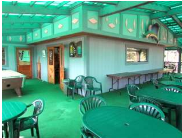
Top of World– Inside the clubhouse.