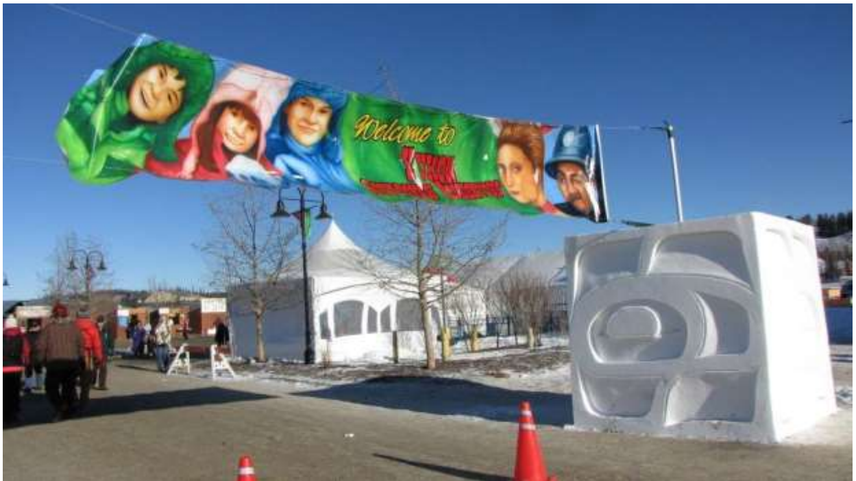
Entrance to Snow Sculptures

Donna Clayson bdclayson*northwestel.net (In Whitehorse)