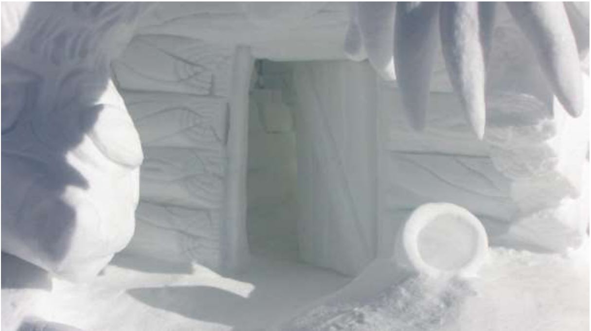
Team Alaska 3