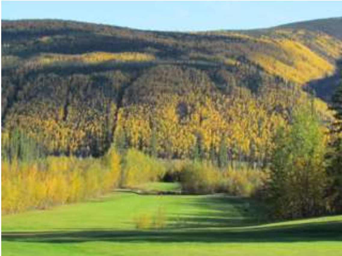
Looking down the fairway at the fall colours

“That the City of Dawson provides financial assistance to the Dawson City Golf Association in the amount of $21,573 in order to satisfy a funding shortfall related to the CDF funding agreement for upgrades of equipment at the municipal golf course.”