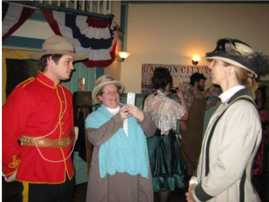
Watch party 1.

Photo courtesy Dan Davidson uffish@northwestel.net (In Dawson)