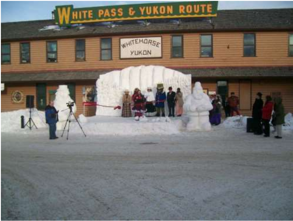
Ribbon Cutting on Main Street in front of the historic White Pass Depot.