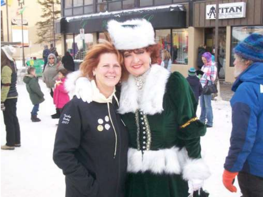
Photo op on Main Street.