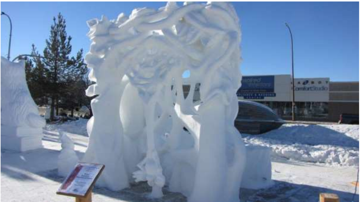
Team Republic of China