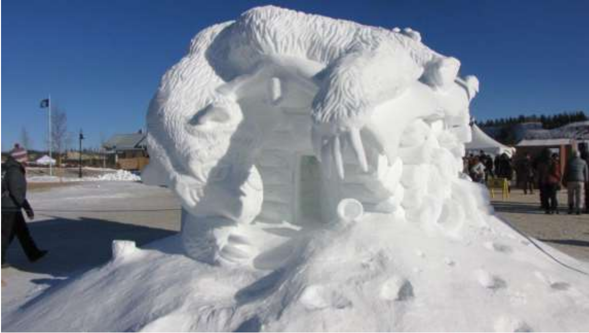
First Place - Team Alaska - Snow Sculpture – Rendezvous 2014 Photo courtesy Donna Clayson bdclayson*northwestel.net (In Whitehorse)

To use an e-mail address from the MocTel, replace the * with @.