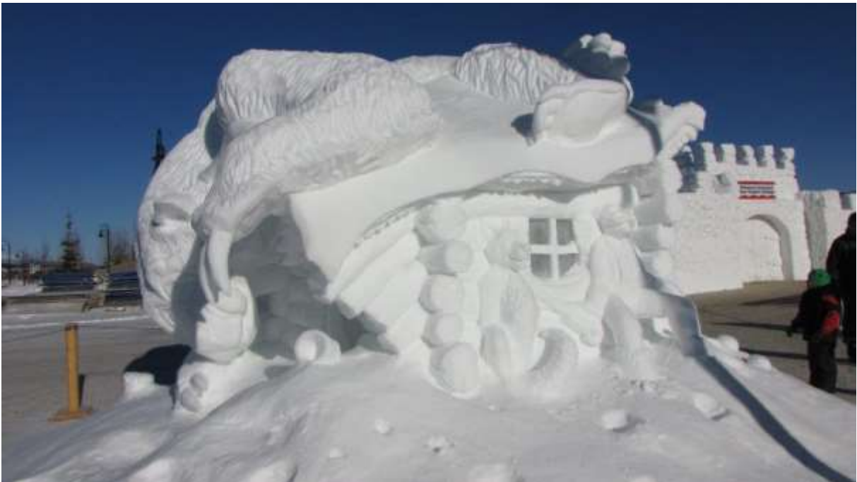
Team Alaska 1