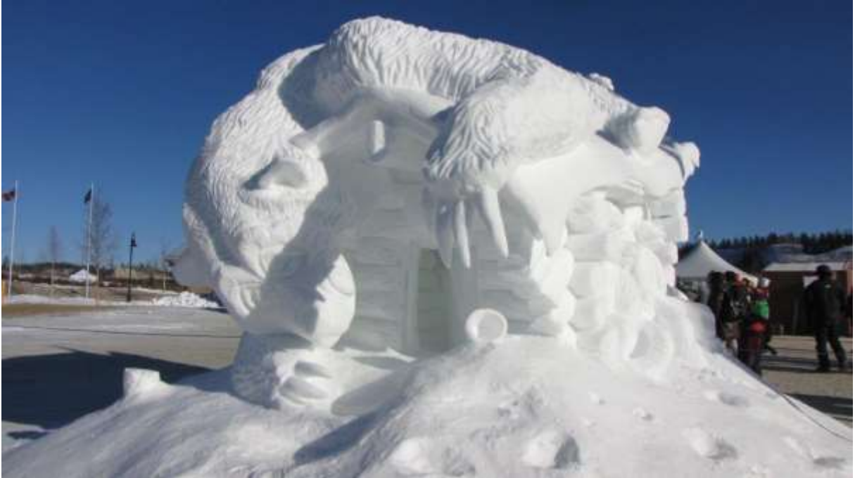
Team Alaska 2

Photo courtesy Donna Clayson bdclayson@northwestel.net (In Whitehorse)