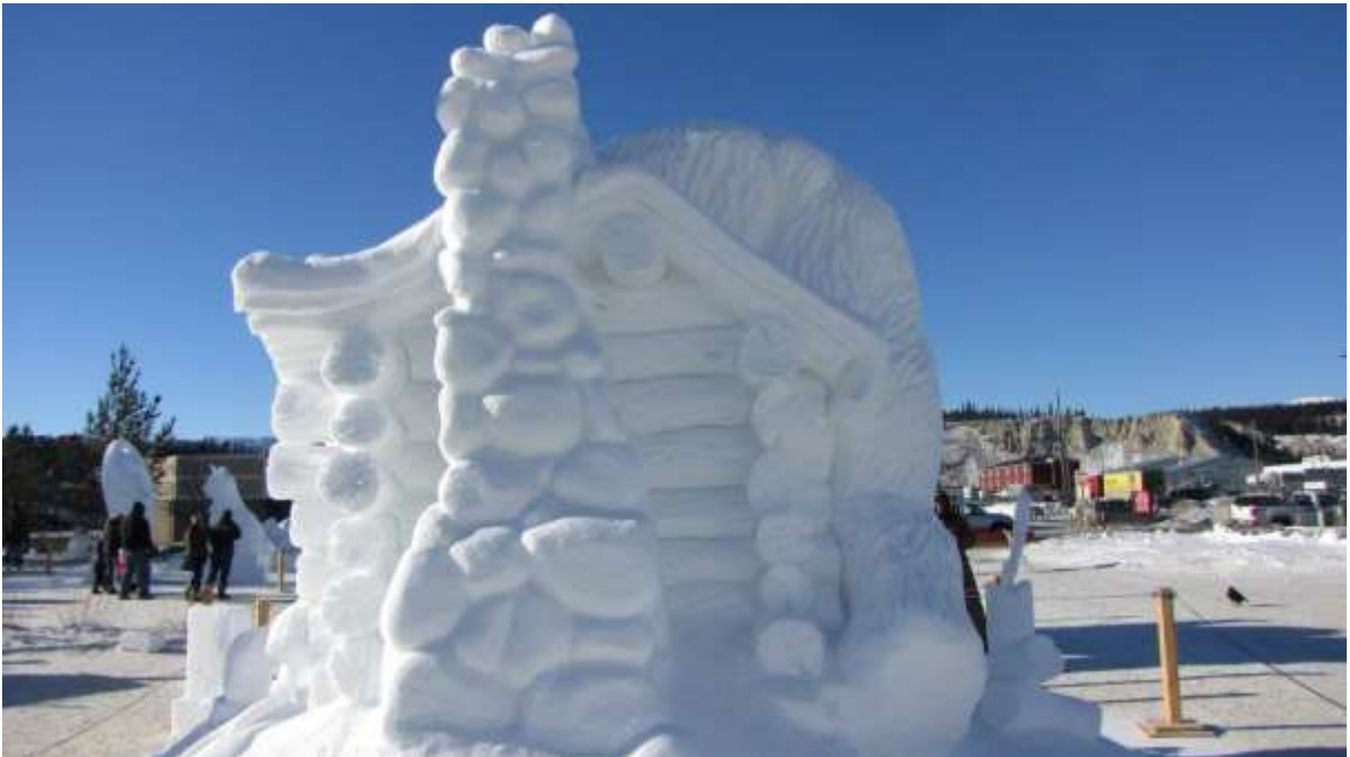
Team Alaska 5

Photo courtesy Donna Clayson bdclayson@northwestel.net (In Whitehorse)