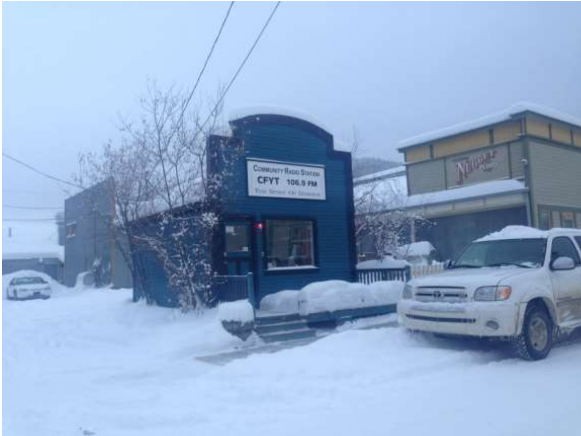
CFYT-fm broadcasts out of this small station on Queen Street.

With two dozen different program slots active each week and no shortage of people willing to sit on its board, CFYT-fm looks to be in good shape heading into the immediate future.