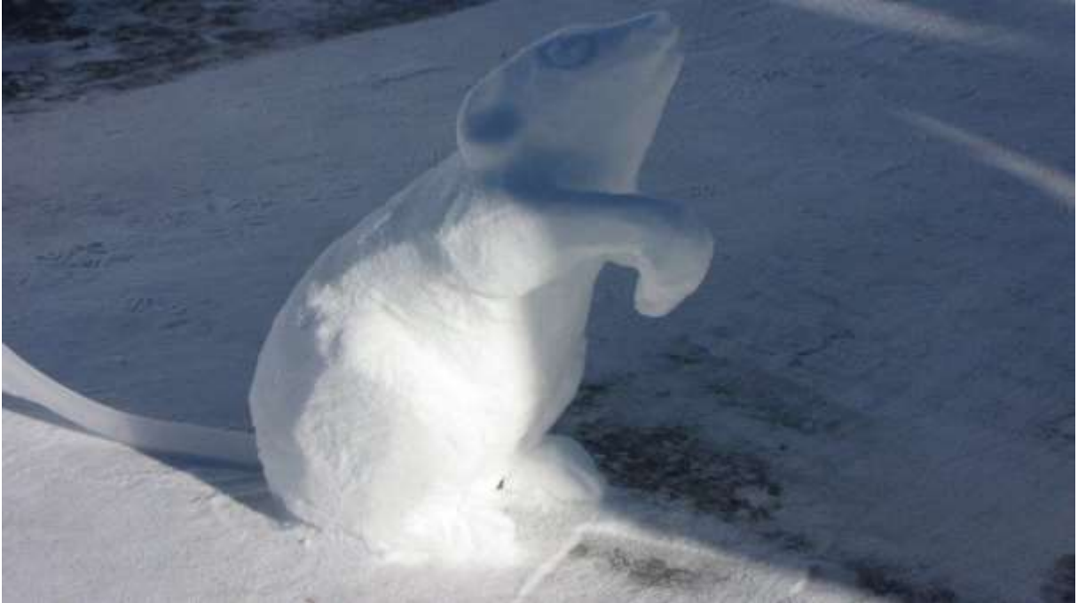
Team Colorado 3