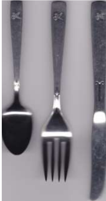
Cutlery with GNA Logo

Photo courtesy Donna Clayson bdclayson@northwestel.net (In Whitehorse)