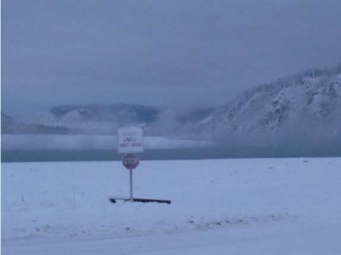
Open water and ice fog mark the place where the ice bridge cannot be formed this winter.

This has happened twice before during my 28 years here, though this year's failure to freeze is probably the most dramatic. A Tr'ondëk Hwëch'in elder has been heard to say that he's never seen it quite like this, so I feel safe in calling this unusual.