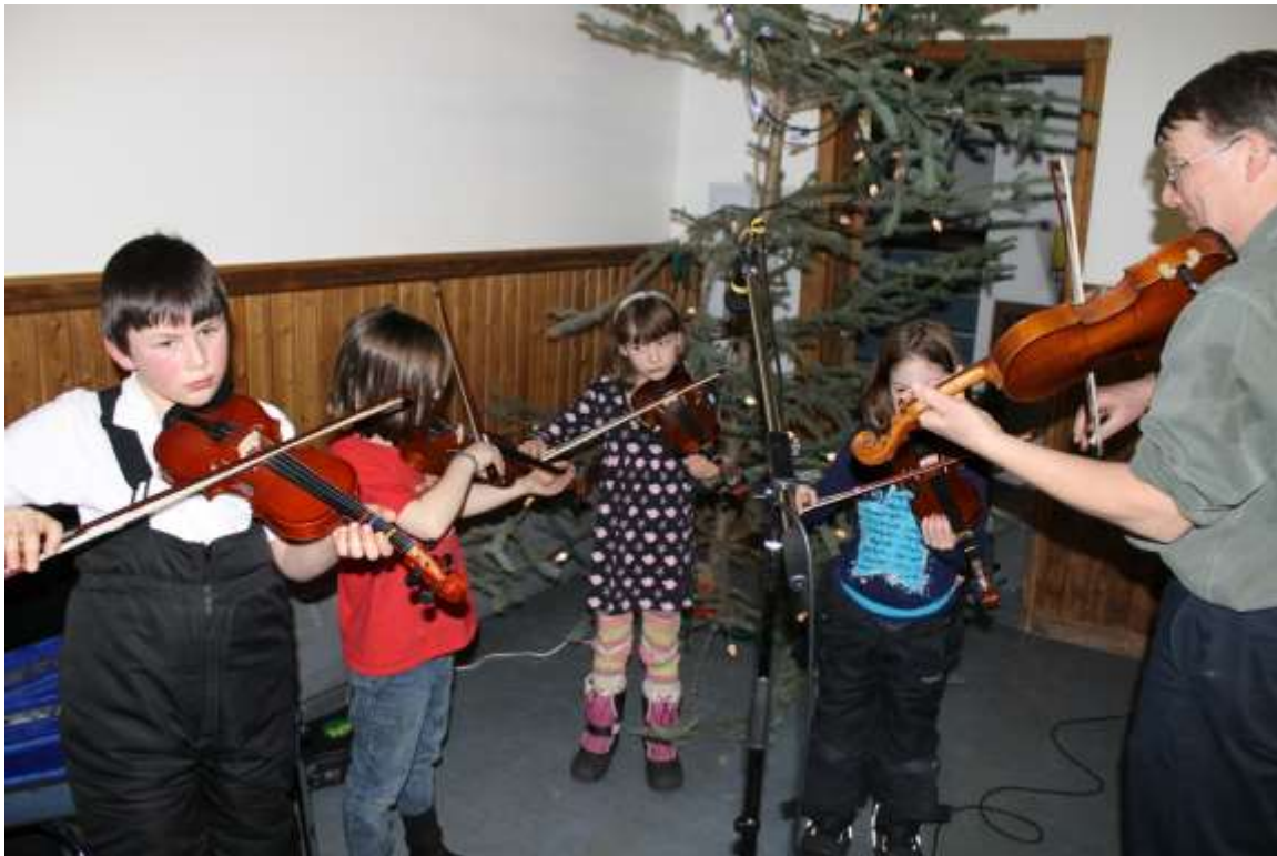
Young fiddlers – Members of the North Klondike Highway Music Society entertained.

The evening continued with the Tr’ondëk Hwëch’in Singers presenting Hän versions of several Christmas hymns and carols and with a display of various dances by the Robert Service School’s jigging club.