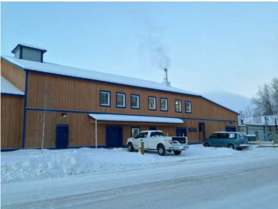
Waste Water Treatment Plant – Dawson hasn't taken ownership of this plant yet – and doesn't want to until it works properly.