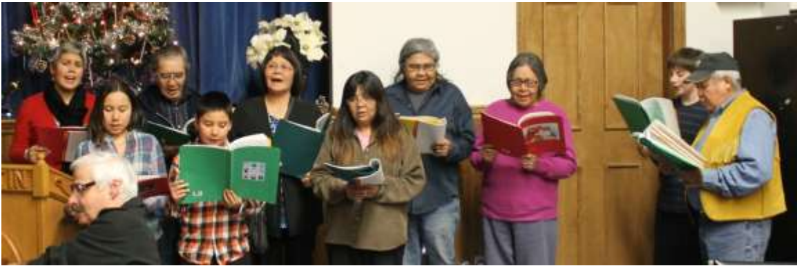
The Tr'ondëk Hwëch'in Singers caroling.