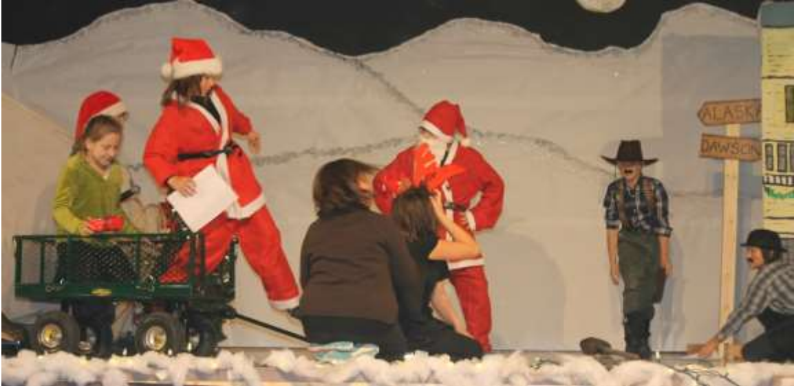
The Grade 5/6 Intensive French class performed the bilingual “La Magie de Noël”.