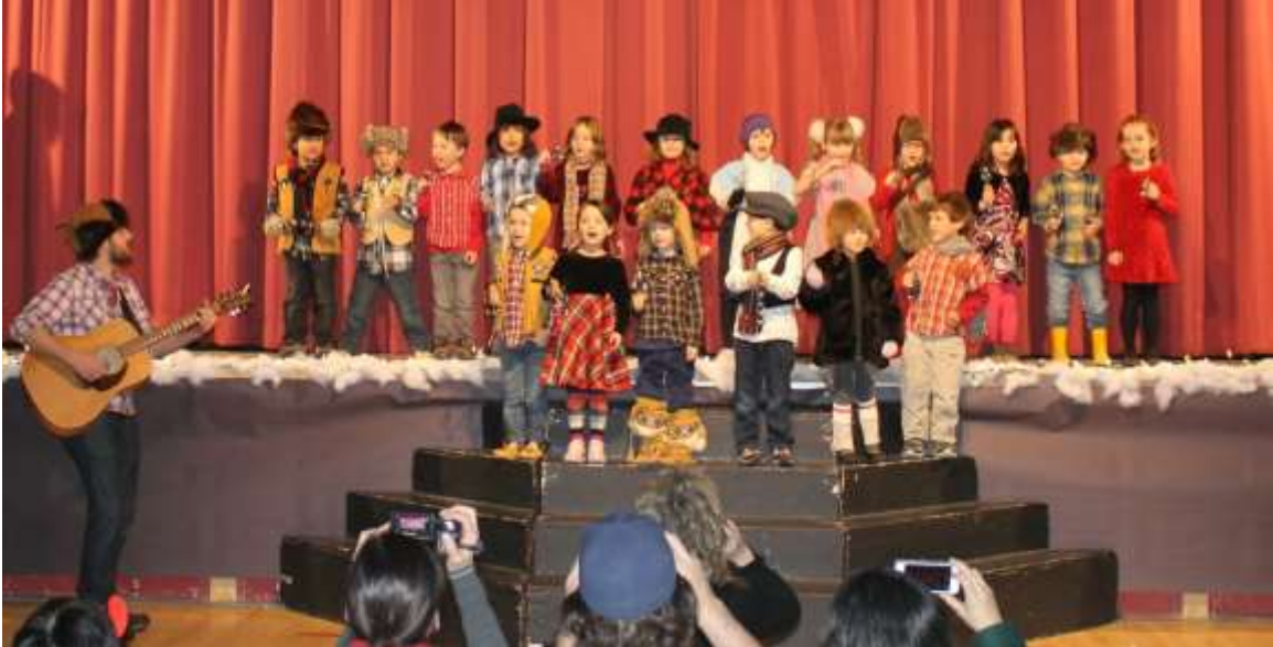
Grade 3 sang “Santa, Santa” to the tune of “A Bicycle Built for Two.” (In Dawson)