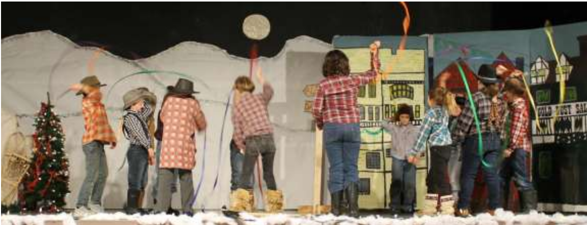
Grade 4 Northern Lights ribbon dance.