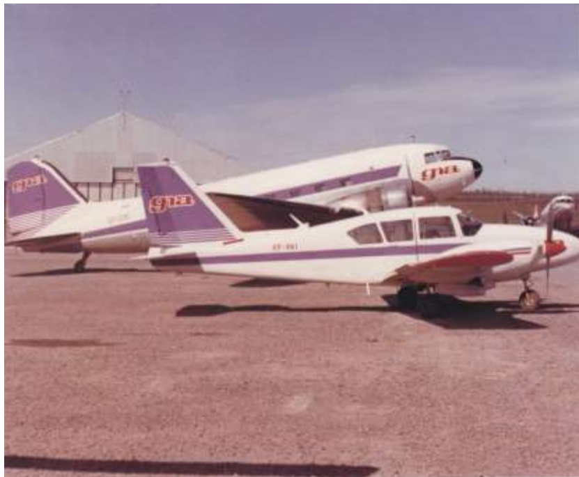
CF-CUC & CF-SKI - GNA Aircraft

Photo courtesy Donna Clayson bdclayson@northwestel.net (In Whitehorse)