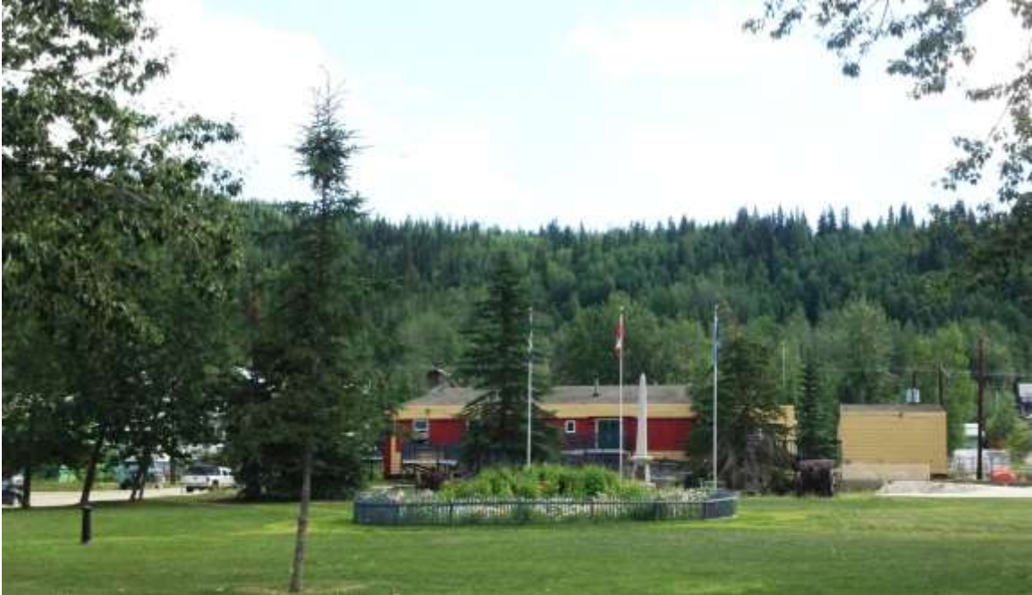
Victory Garden is Dawson's oldest public garden.