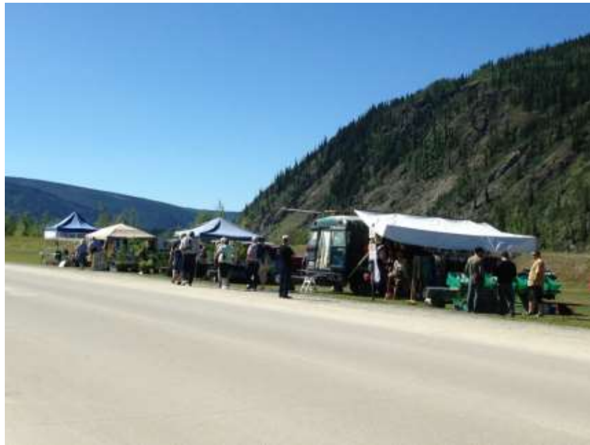
The Farmers' Market is busy every Saturday during the summer. (In Dawson)

“Although the growing season is short, the citizens of this little floodplain take full advantage of the long days to grown those plants that thrive in this sub-arctic climate. There are large gardens, tiny ones, raised beds and planter boxes. Garden teeming with vegetables, fruits, herbs and edible flowers are providing fresh fruit for the owners, the food bank and the soup kitchens. Produce from market gardens is also in great demand. The community flourishes and the children, our future gardeners, are being involved.” The winning results were announced at the December 30 council meeting.