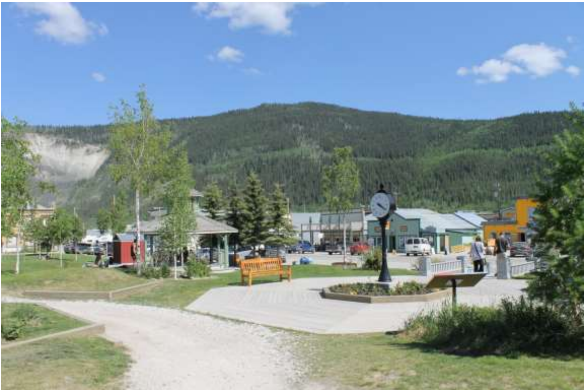
Front Street Park, with town clock & gazebo.