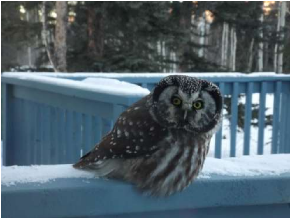
Boreal Owl – Feb 2014

To use an e-mail address from the MocTel, replace the * with @.