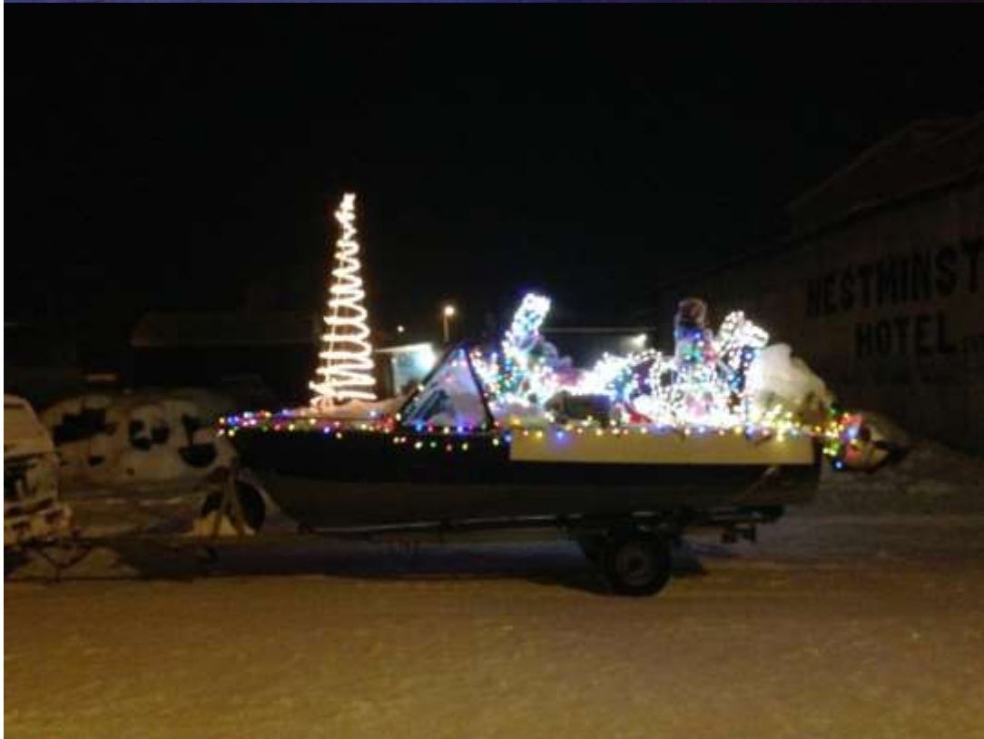
(In Dawson)