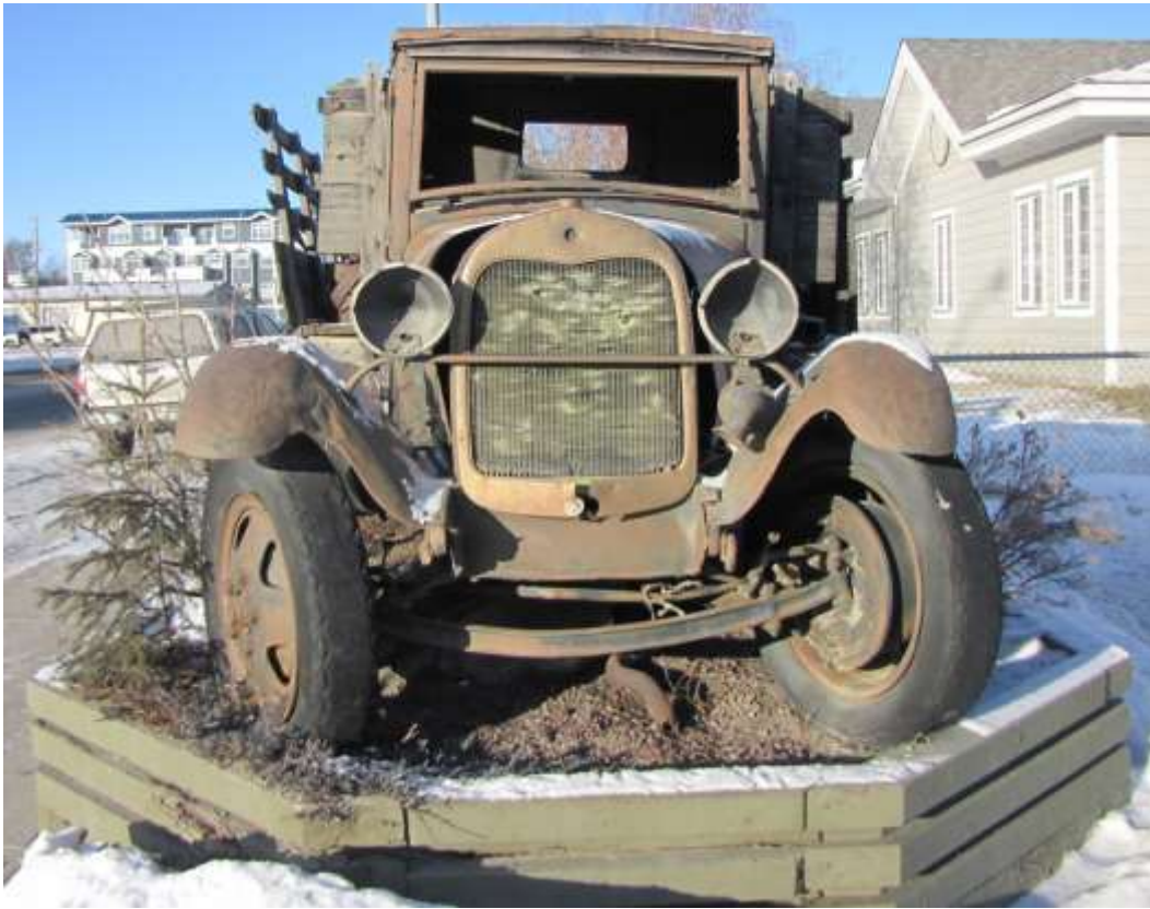
Yukon Mining Co. Truck on display in Whitehorse

The sign behind the truck, as you found on the website, was removed last summer because the wood was rotting and proved dangerous of falling onto someone.