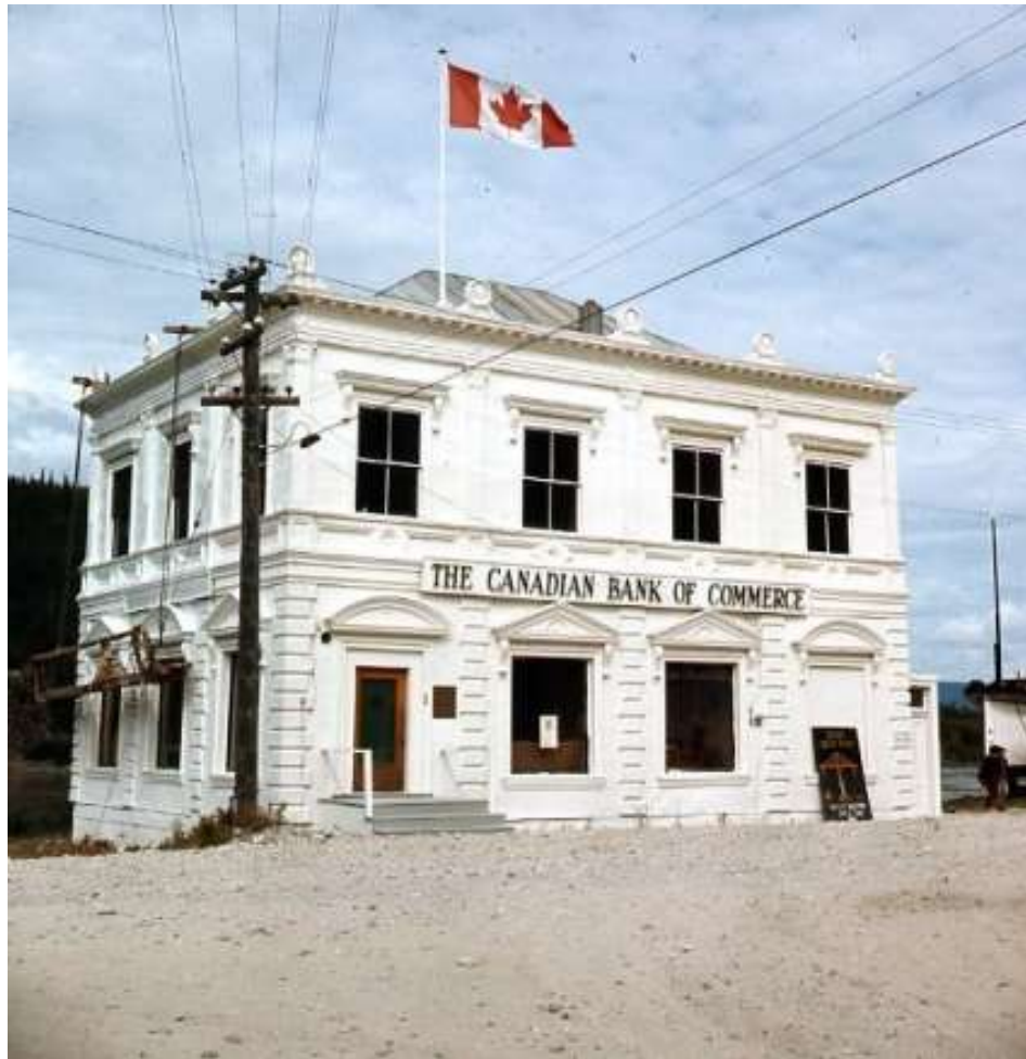
Canadian Bank of Commerce – Dawson – 1964

To use an e-mail address from the MocTel, replace the * with @.