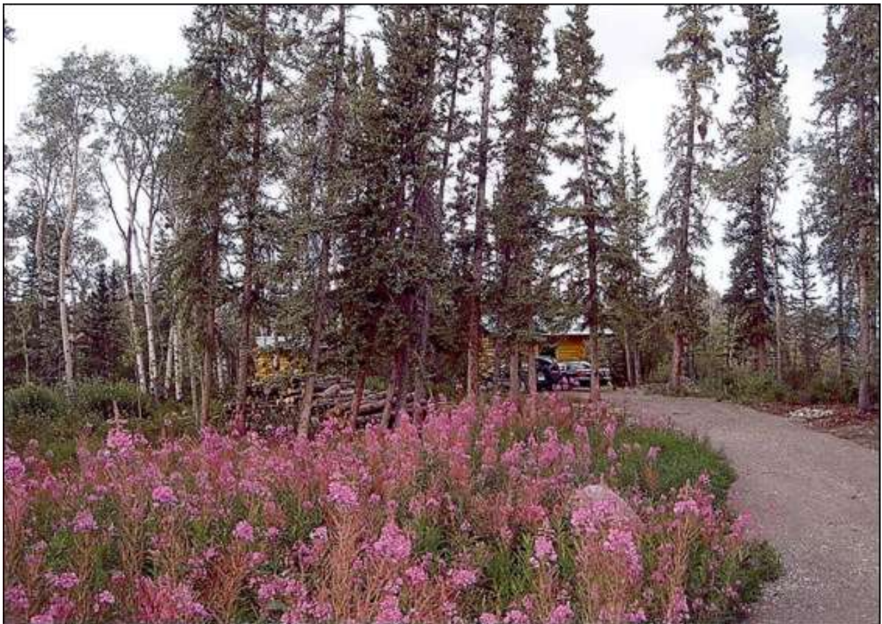
Fireweed at a log cabin on the "Marge of Lake Lebarge"

Fireweed is also known as great willow herb, blooming Sally, French willow and rosebay, again depending on where you are. Some people call it mooseweed, with good reason. Elk, moose and deer consider a stand of fireweed their field of dreams as they feast on the sweet stalks and tender leaves. In many places, beekeepers try to grow fireweed near their beehives. You see, it makes a dark, sweet honey, which is superior in taste to that of almost every other flower.