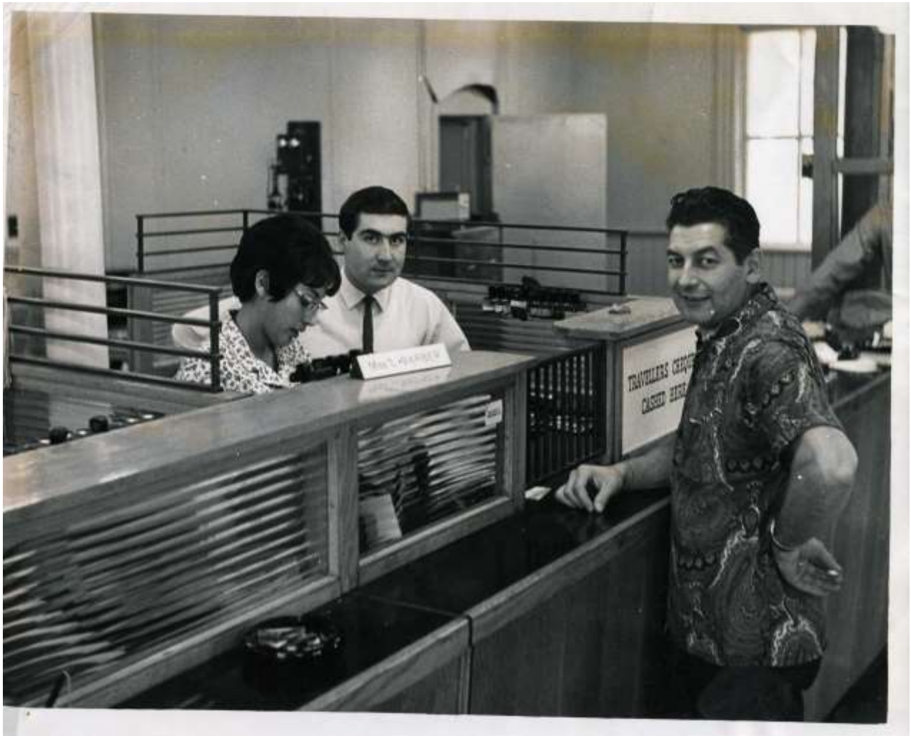
End of an era in Dawson (1968)