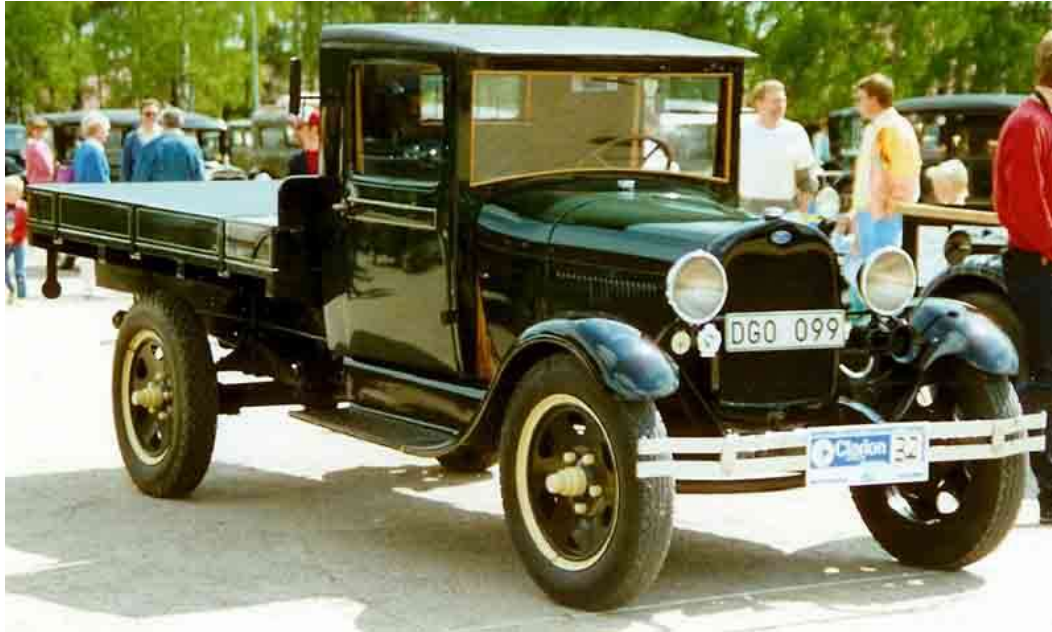
1929 Ford Model AA Truck

Note: High Country Inn was formerly the YWCA.