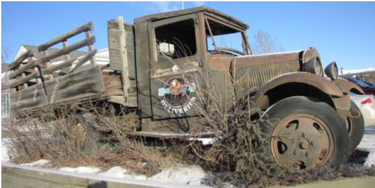
Yukon Mining Co. Truck on display in Whitehorse

Donna (Storing) Clayson bdclayson@northwestel.net (In Whitehorse)