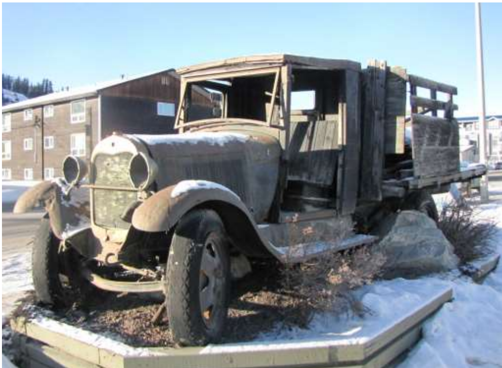
Yukon Mining Co. truck is on display in front of the High Country Inn in Whitehorse.

Photo courtesy Donna (Storing) Clayson bdclayson@northwestel.net (In Whitehorse