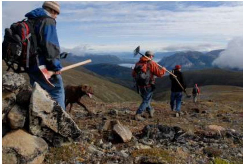
Photo courtesy Derek Crowe and Jane Keopke janek*northwestel.net (In Whitehorse)

Jane Koebke janek*northwestel.net (In Whitehorse)