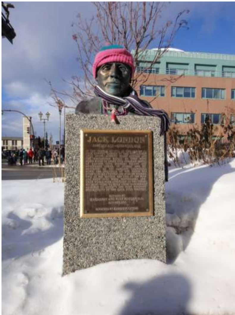
Jack London bust in Whitehorse during Sourdough Rendezvous 2013 (In Whitehorse)