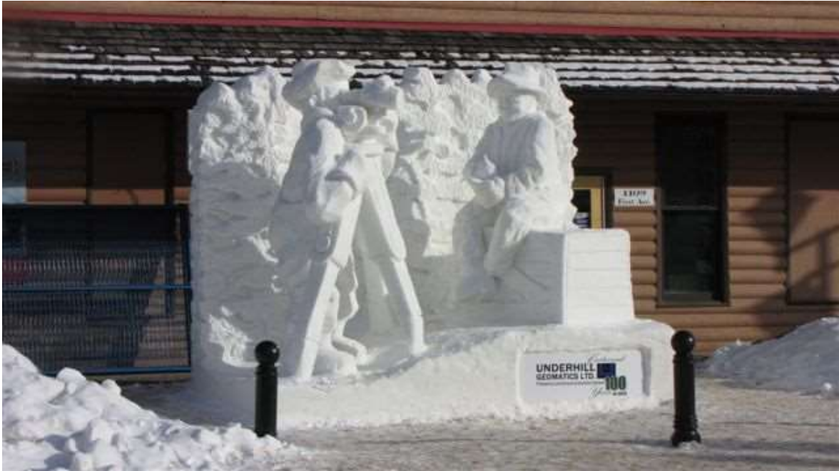
Underhill Geomatics Ltd. - Celebrating 100 years. – Since 1913.