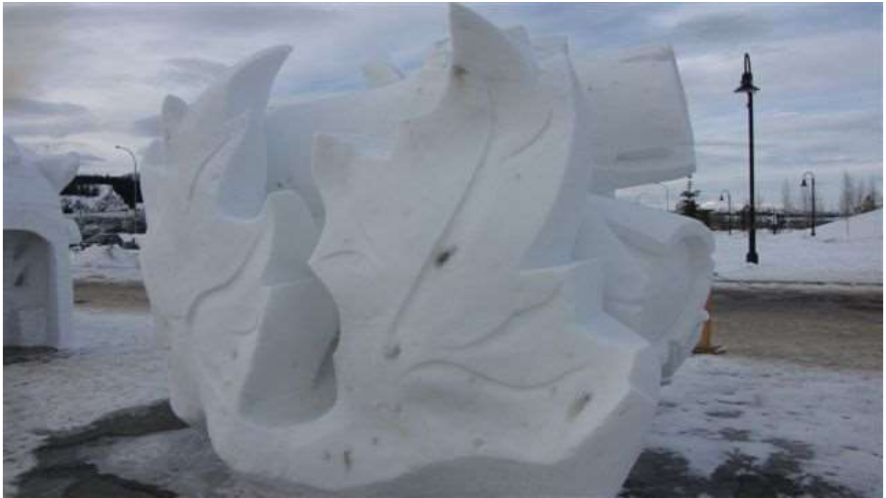
Team Manitoba – Home Fires (2) (In Whitehorse)