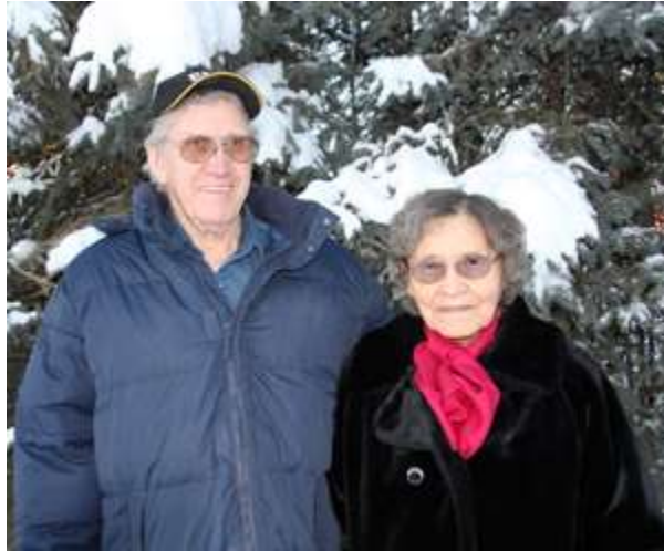
Mr. and Mrs. Yukon for 2013.