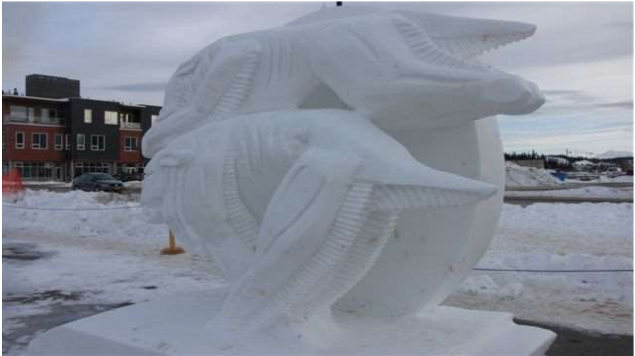
Team Michigan (In Whitehorse)