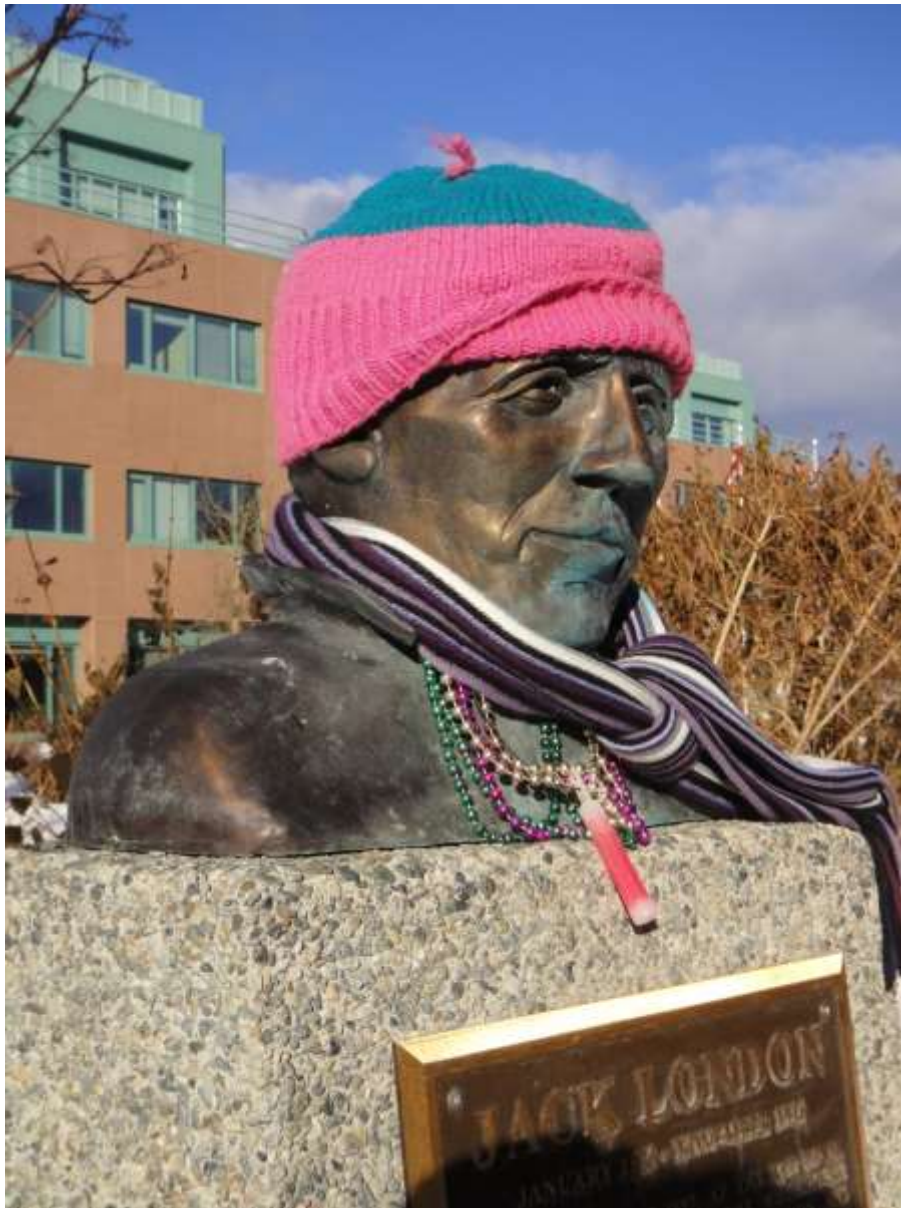
Jack London bust in Whitehorse during Sourdough Rendezvous 2013 (In Whitehorse)

To use an e-mail address from the MocTel, replace the * with @.