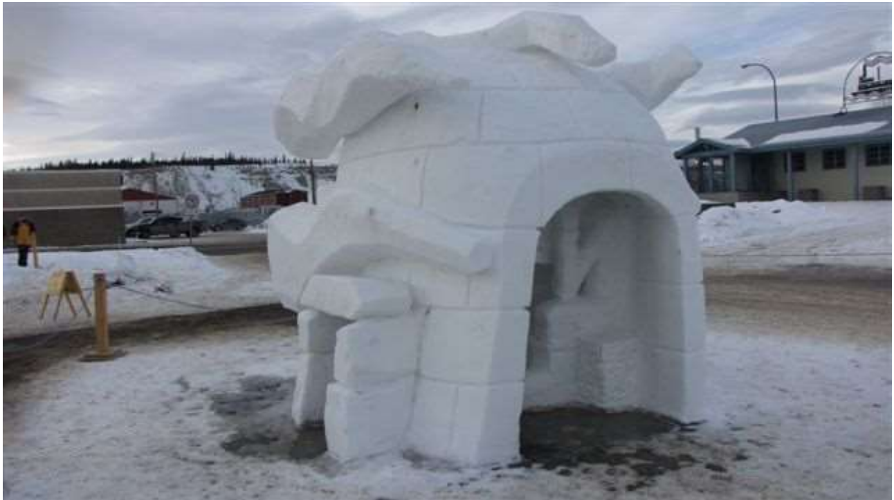
Team Yukon (2)

(In Whitehorse)