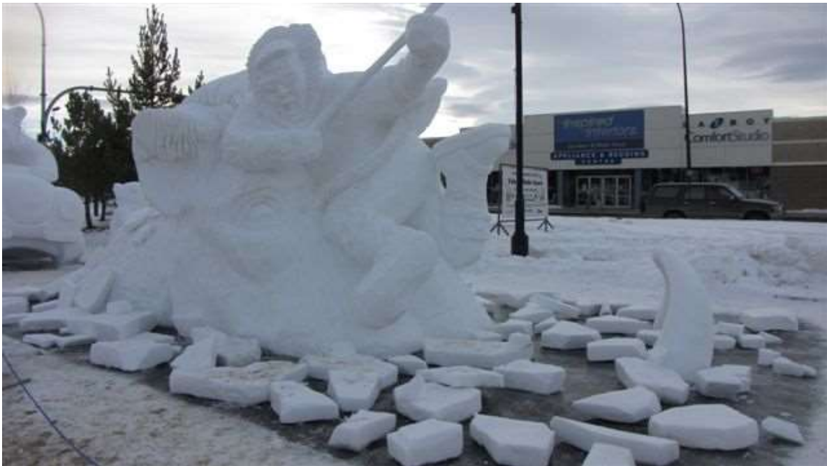
Team Alaska (In Whitehorse)