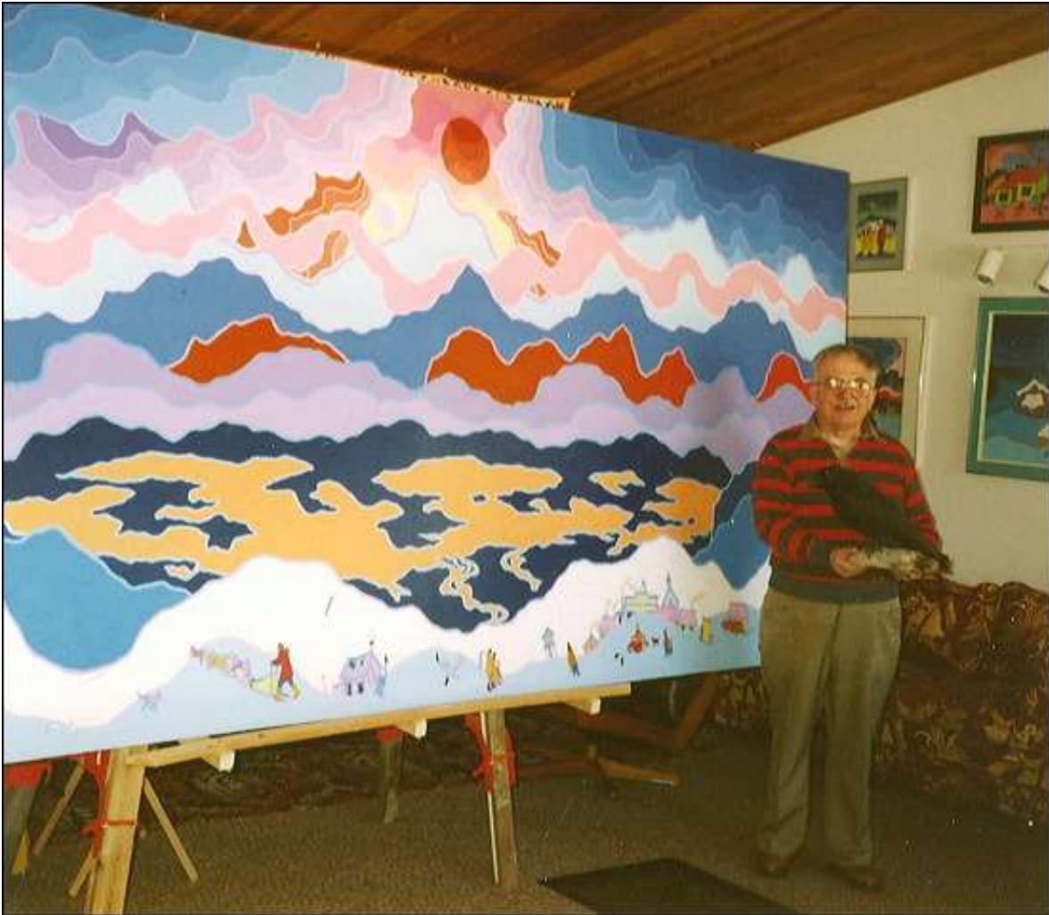
Ted Harrison in his studio – 1993.