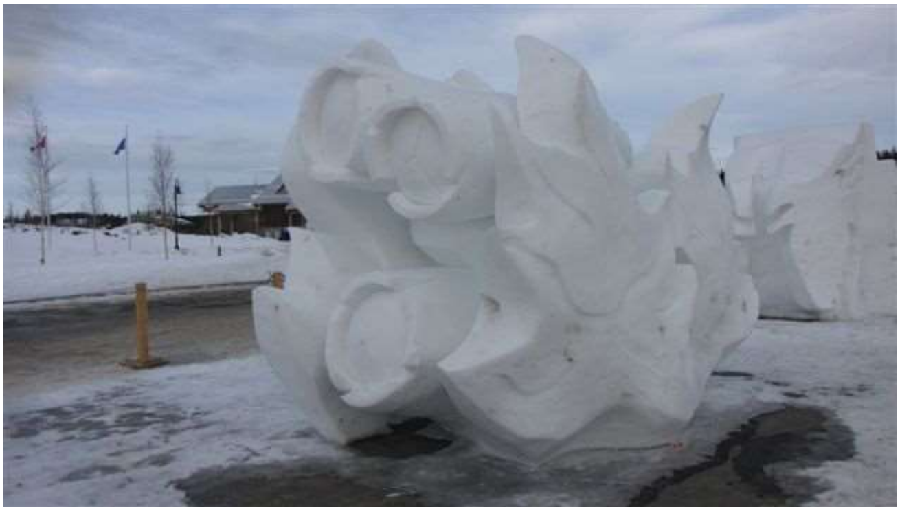
Team Manitoba – Home Fires