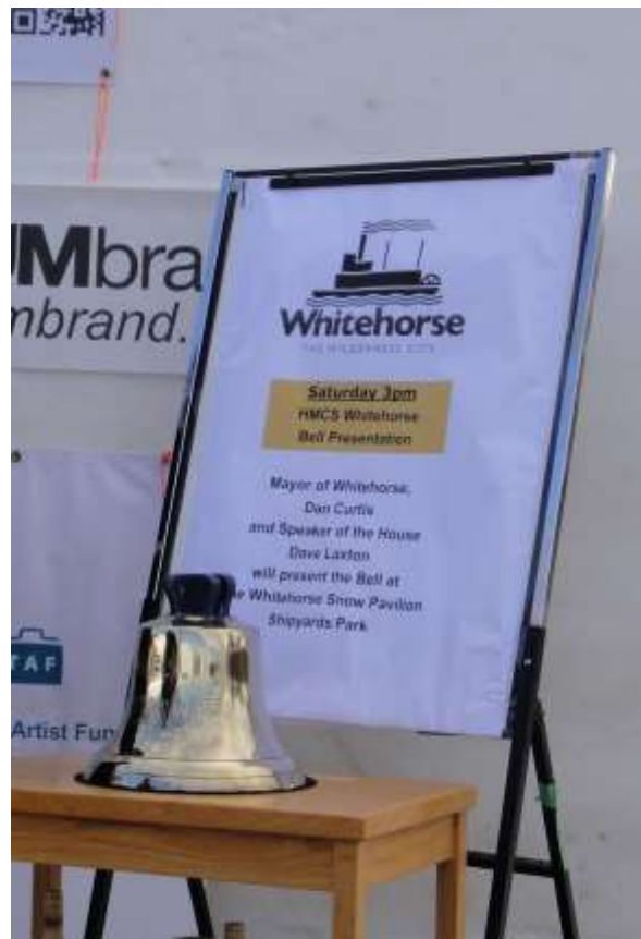
The Bell from HMCS Whitehorse _(In Whitehorse)

The HMCS Whitehorse is not the first vessel to bear the name. The sternwheeler Whitehorse gave 53 years of service on the Yukon River, longer than any other boat in the northern fleet. First built in 1901 in Whitehorse, the "Old grey mare" was rebuilt in 1930. Dry-Docked in 1955, when the Riverboats were pulled from service, the Whitehorse burned to the ground in 1974.