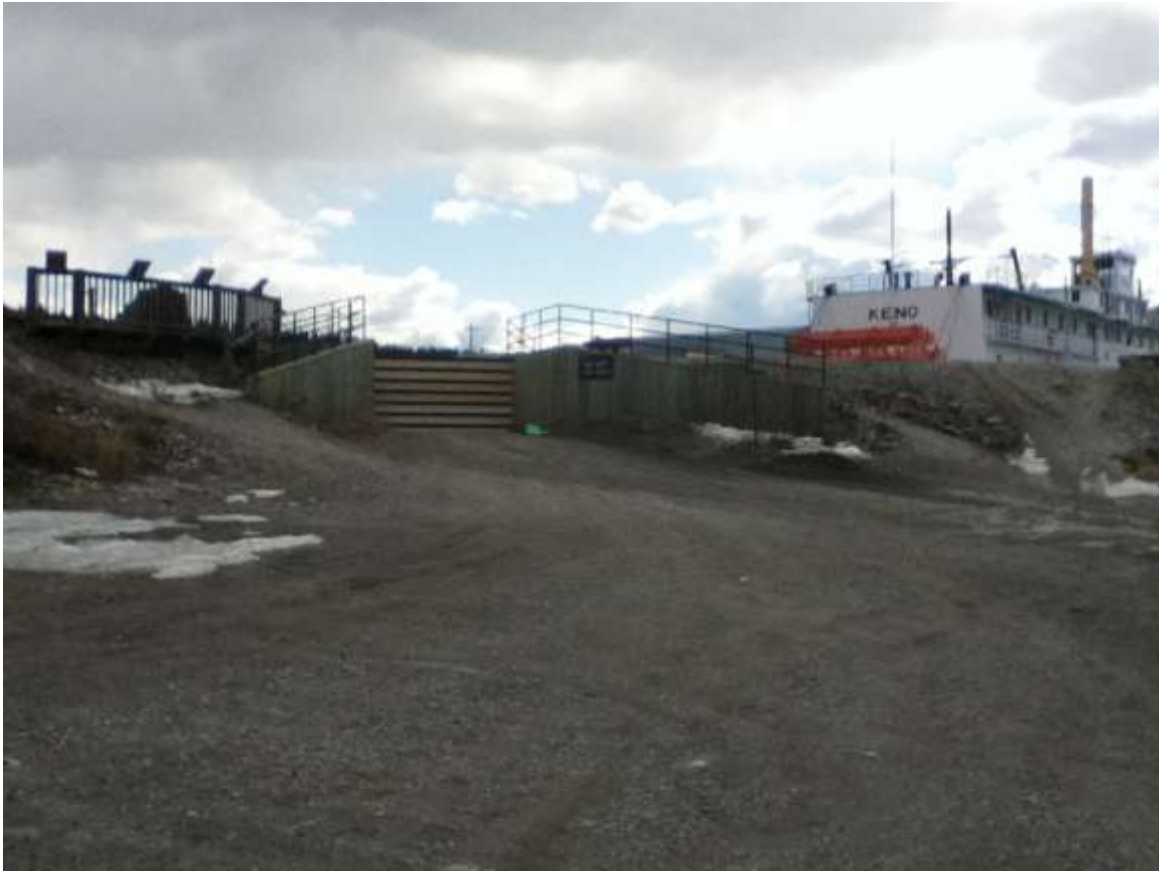
Wooden and steel barrier that blocks the hole in the dyke in Dawson.

It has worked well over the years since then.