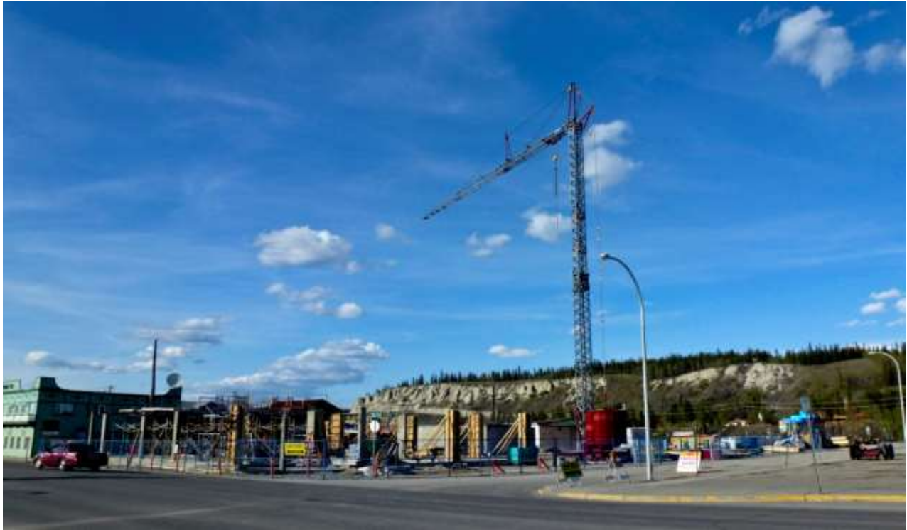
Mah's Point Condo Project – 2nd Avenue (In Whitehorse)

Yes, it is being built by Tippy. It's on the site of where the New North cabaret and motel sat. The website for the condos is http://www.mahs-point-condos.com/ - I think it may be the first six story building in Whitehorse - could be wrong on that.