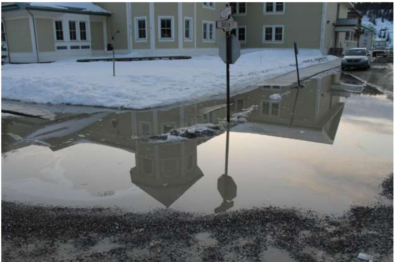
Robert Service School Reflection