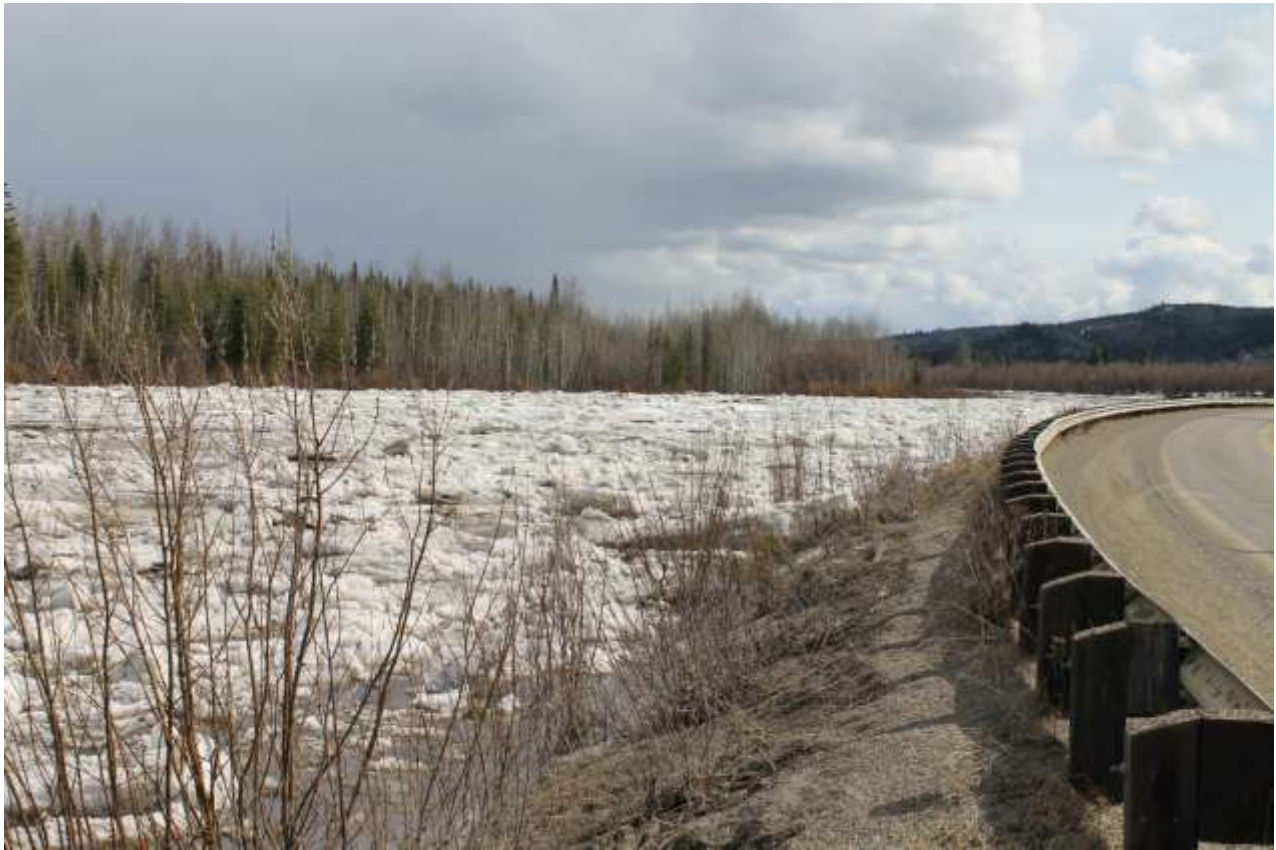
Another jam on the creek below Henderson's Corner, looking southeast along the Klondike Highway.