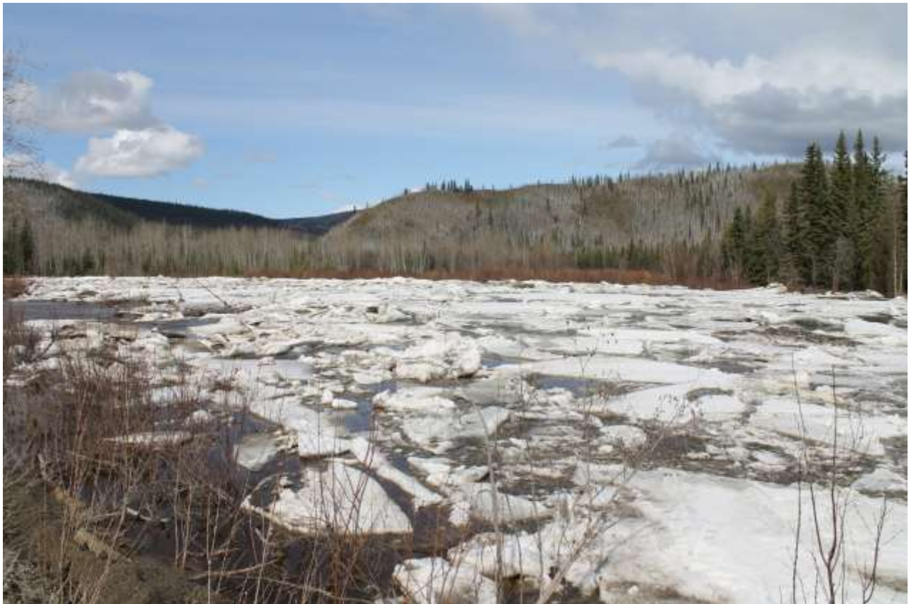
An ice jam just above Rock Creek.

The Flood Risk Breakdown report says that the Yukon River is rising 20 to 25 cm daily and has risen 1.34 m since the April 10 report. Last week it was rising 5 to 10 cm daily, so the rate has increased.