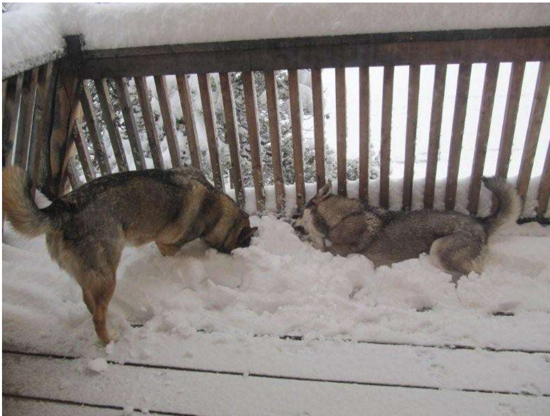
May 17, 2012 - (In Carcross)