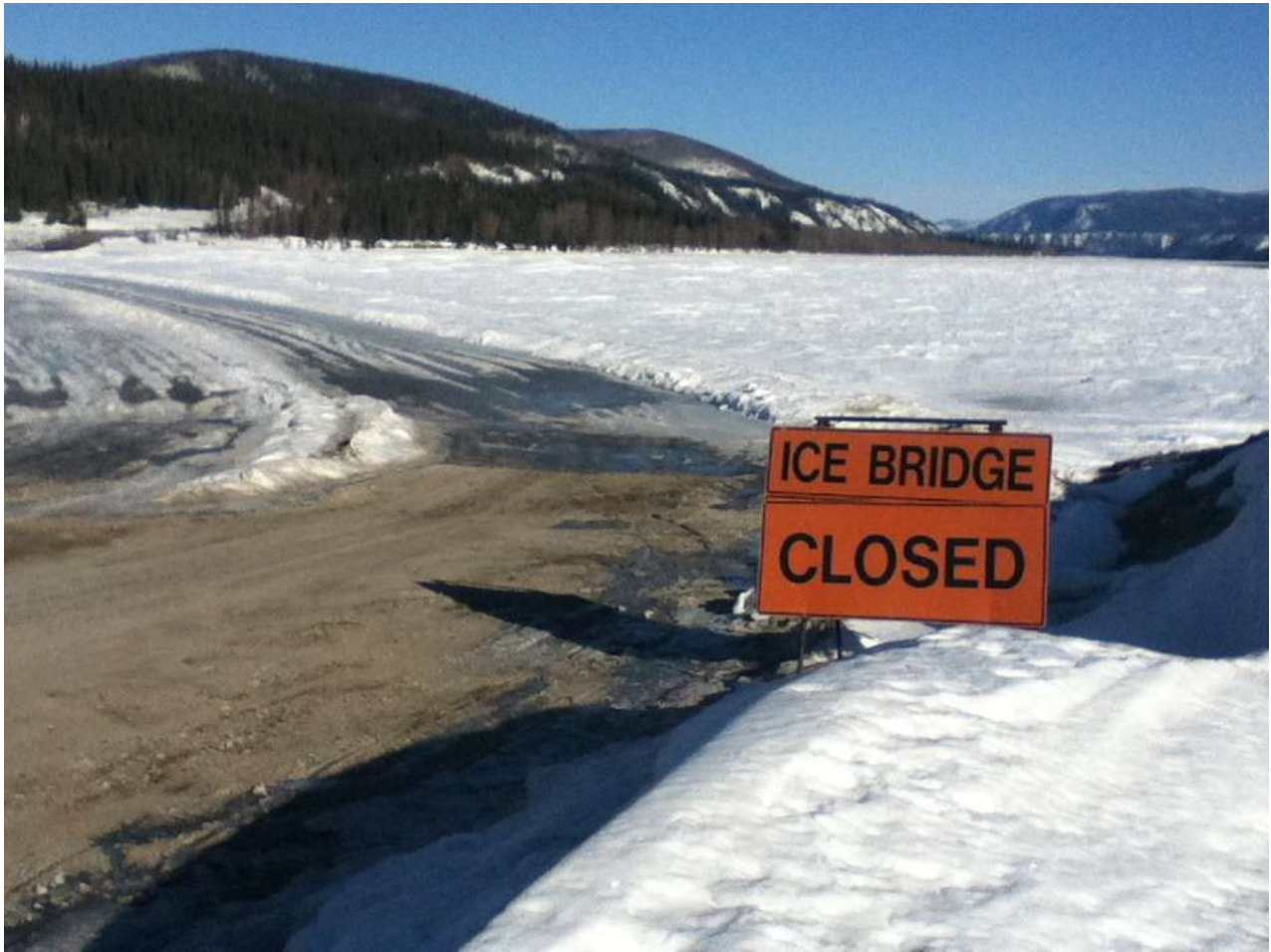
Ice Bridge closed – By April 11 the ice bridge was declared closed.