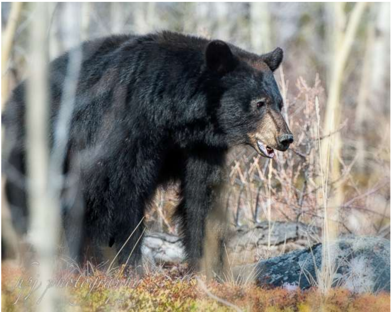
Black bear near my Nares Lake cabin, May 4, 2012. (In Carcross)