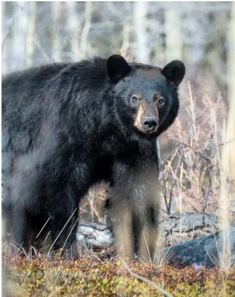
Black bear near my Nares Lake cabin, May 4, 2012. Photo courtesy Heather Jones hpj50*me.com (In Carcross)

To use an e-mail address from the MocTel, replace the * with @.