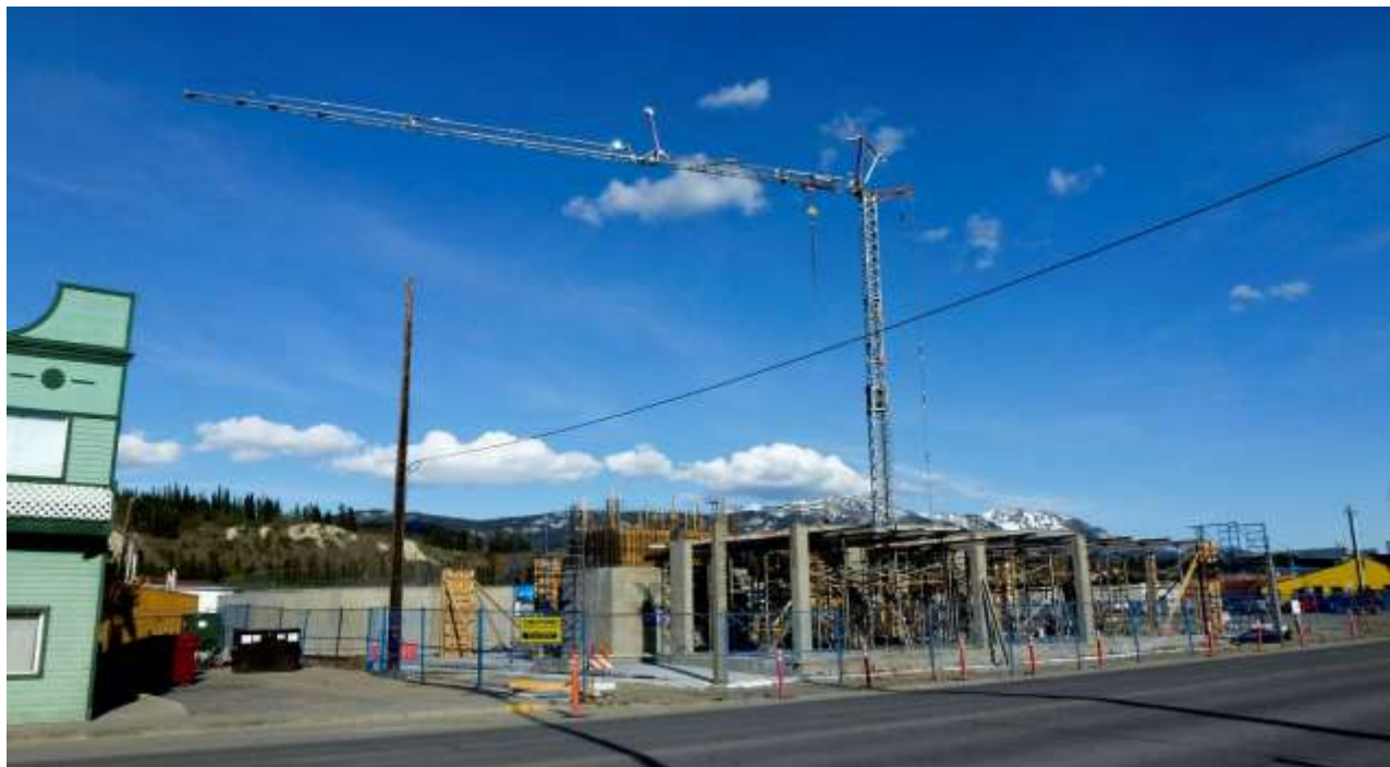
Mah's Point Condo Project – 2nd Avenue (In Whitehorse)