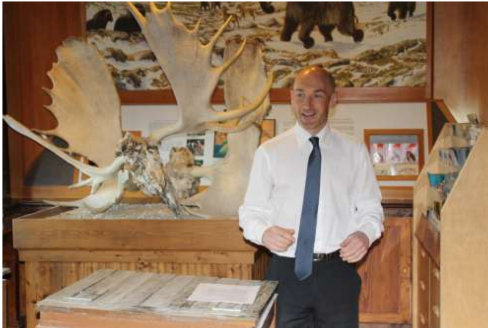
A smiling Ryan Leef announces a victory in the debate over border crossing hours.

Such impromptu settings are, he said, "part of the unique character of the Yukon that we all love so much."