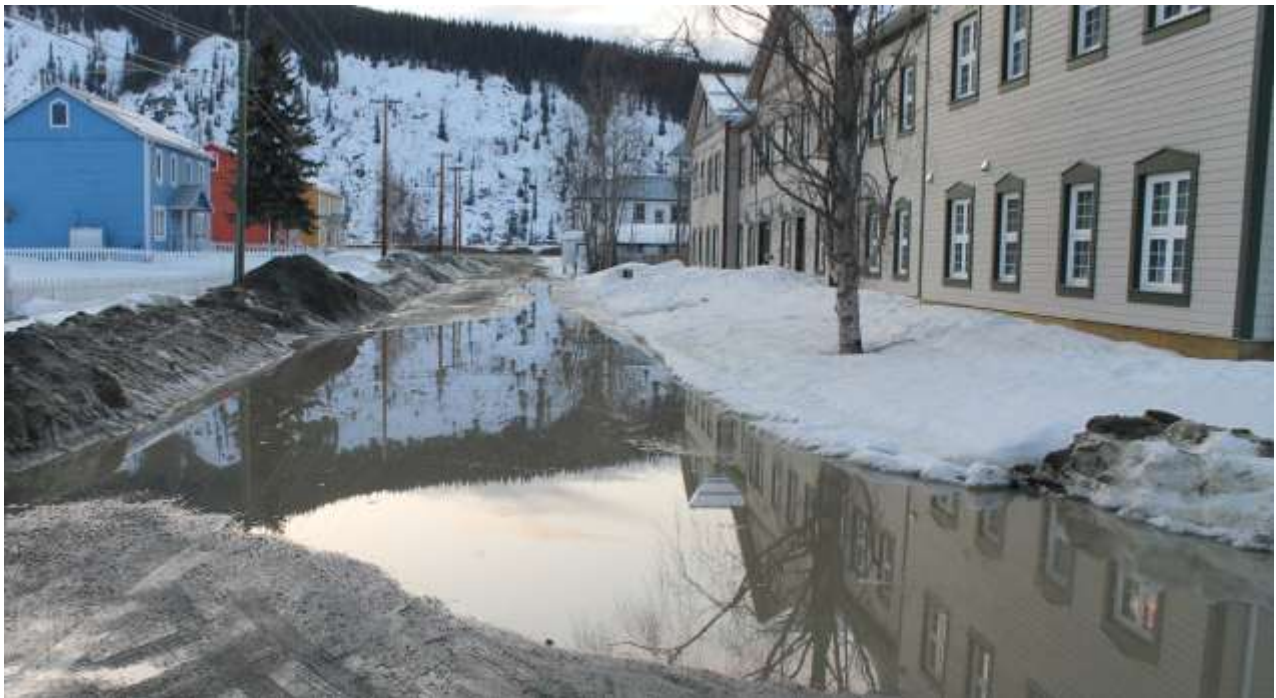
Lake Turner Street

Photo courtesy Dan Davidson uffish@northwestel.net (In Dawson)