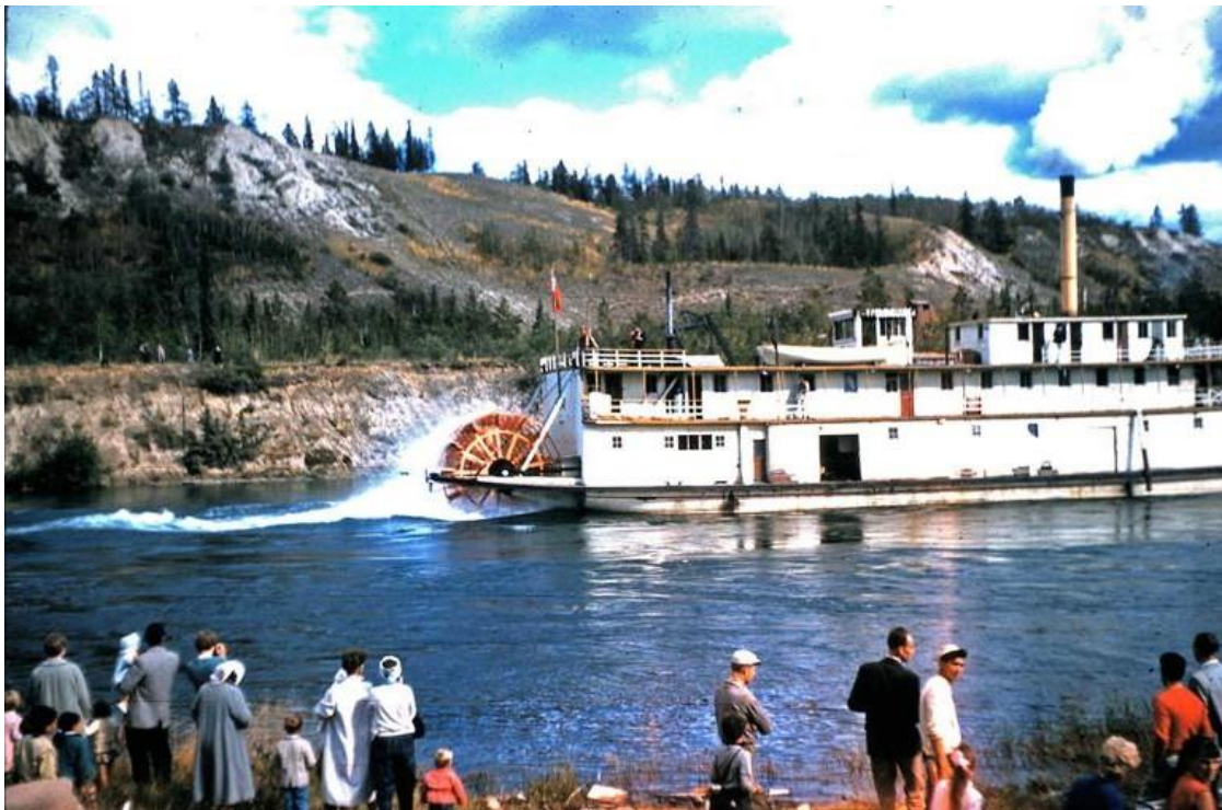
Heading up river in order to turn around near present day Robert Campbell bridge. Men, women, children and even babies, out to see the final voyage.