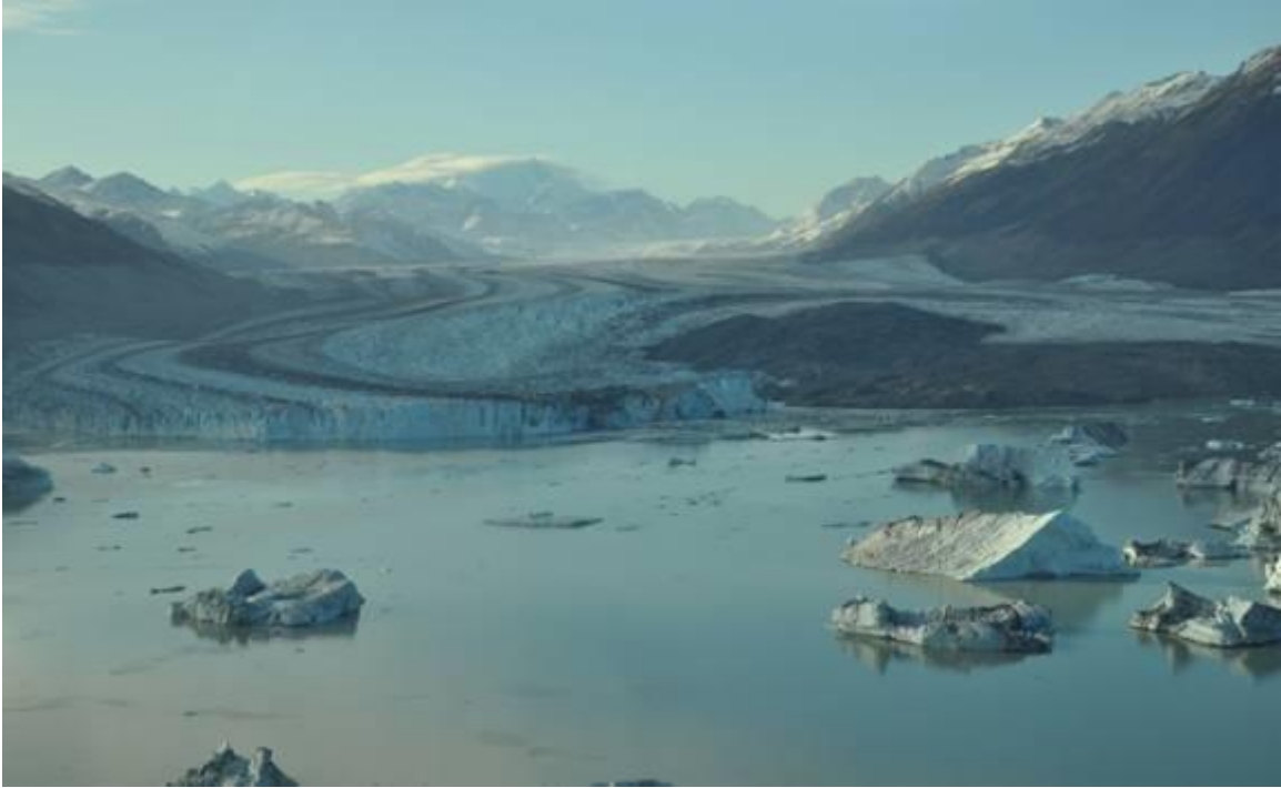
Lowell Glacier – Lowell Lake in foreground - October 2009 Photos courtesy Erin Schnyder goneflying*live.ca (In Haines Junction)