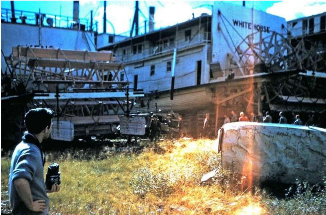
Keno and Whitehorse from the rear. (In Ottawa)