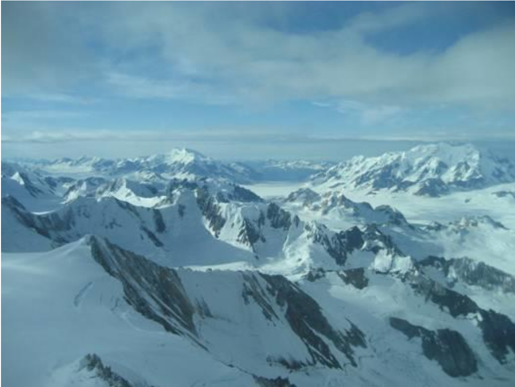
On west side of Hubbard Massive looking south over Hubbard Glacier towards Disenchantment Bay.

Photo courtesy Erin Schnyder goneflying*live.ca (In Haines Junction)