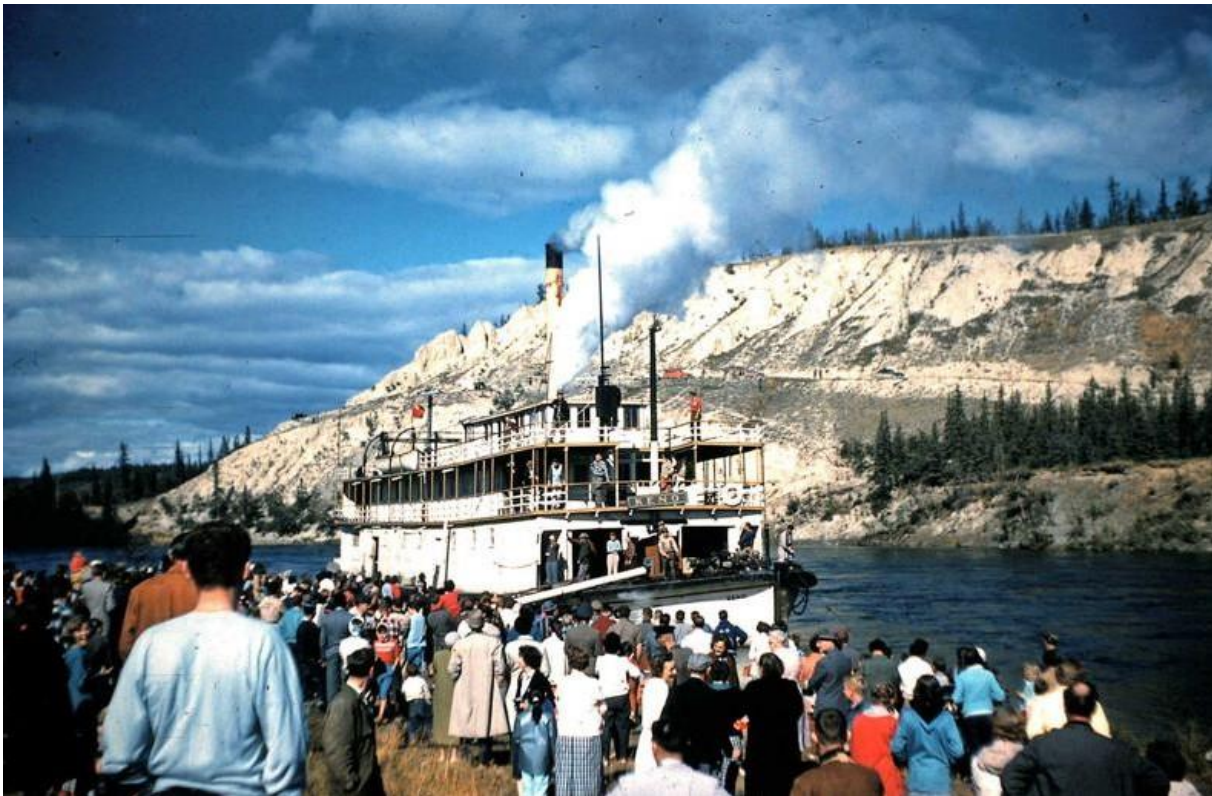
Sternwheeler Keno with boilers lighted and steam is up ready to sail – August 23, 1960

To use an e-mail address from the MocTel, replace the * with @.