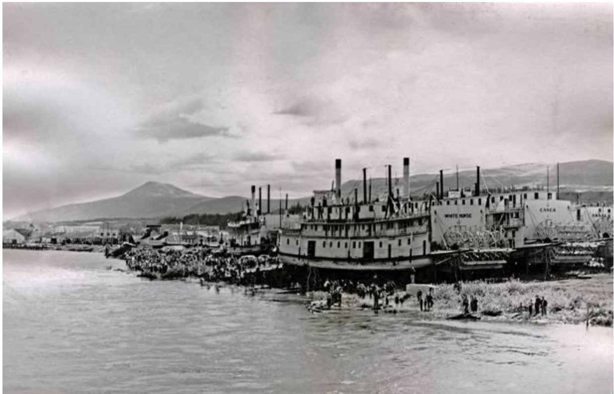
(In Whse)

Looking back at Whitehorse as the Keno sailed.