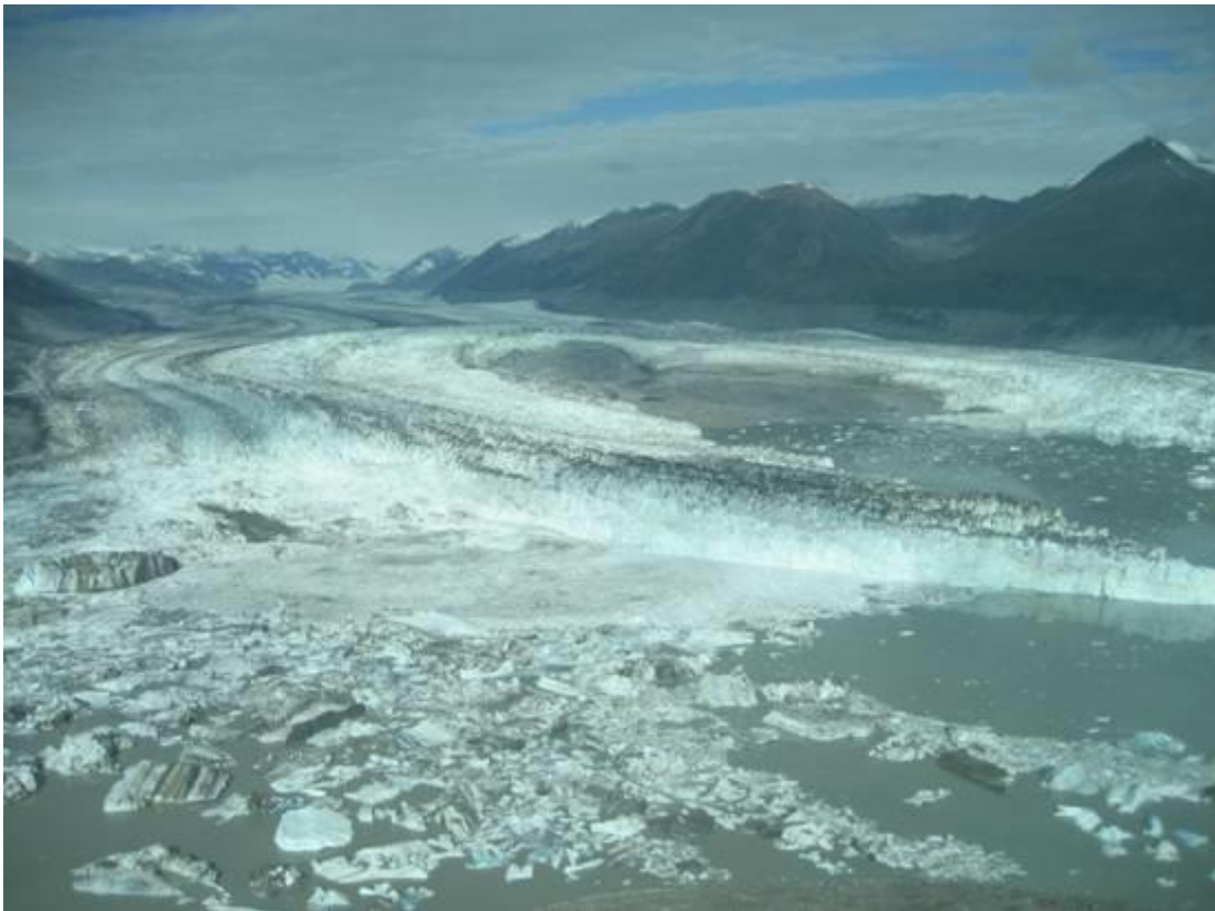
Lowell Glacier. compare this to the picture I attached taken last October... this glacier is surging. Ice has almost reached the shore in foreground. To gain perspective between the two