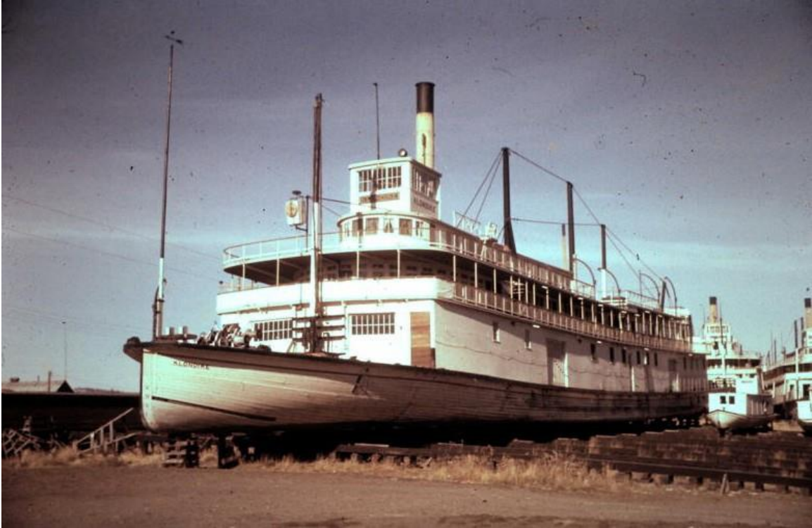
The Sternwheeler Klondike at rest in the Shipyard 1958