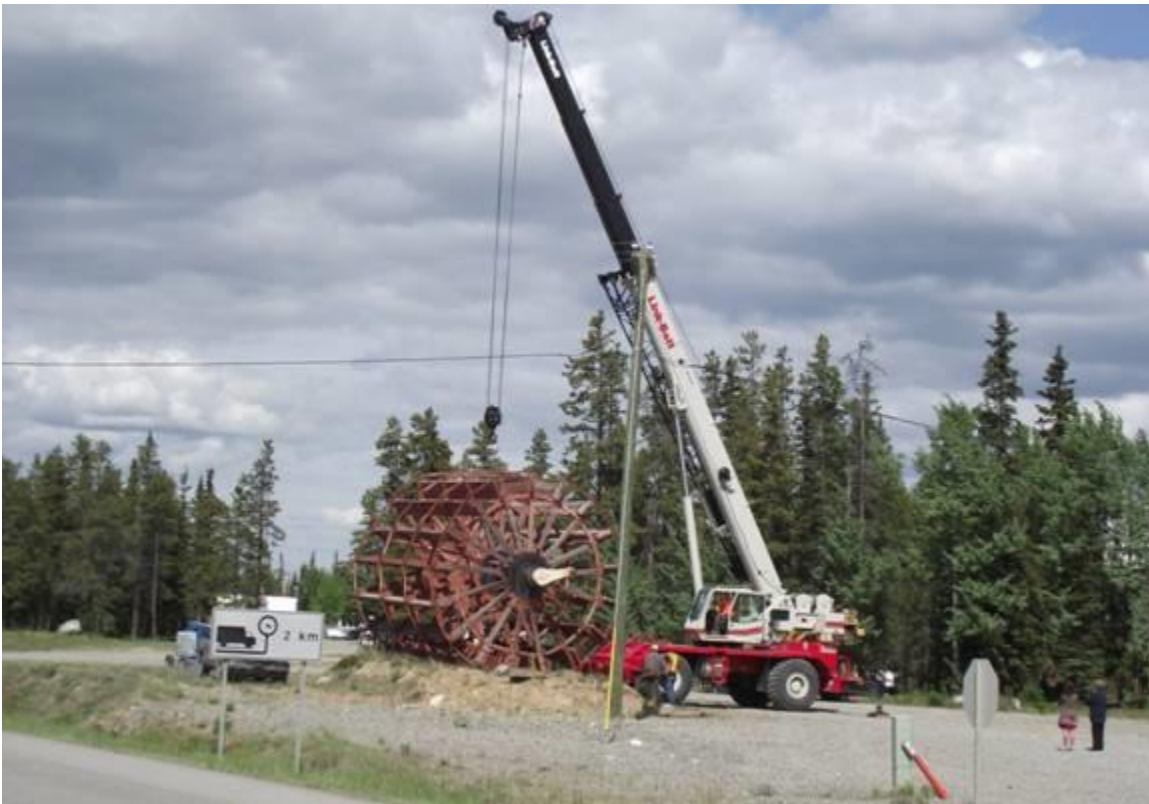
Aksala paddlewheel - Sternwheeler Village – Mile 913 - June 4, 2010 (In Whitehorse)

(Sternwheeler Village) for a while; the Neecheah was used as a restaurant called The Captain's Locker, while the Aksala sat on timbers until it became a fire hazard and was demolished. The pilothouse and paddlewheel, though, were saved. The pilothouse was moved to a private residence, used as a greenhouse, and the sternwheel remains at Sternwheeler Village. The sternwheel was moved this past June from its prominent position next to the Alaska Highway back a couple of hundred feet into a grove of trees, and in the past few days (just before the Fall rains began!) a new paint job has been completed on it.