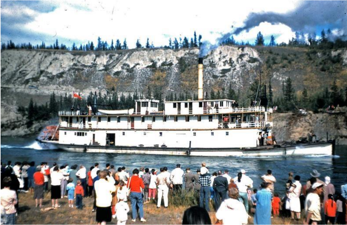
Heading up river in front of the crowd gathered to see her off – August 1960 Photo courtesy Ira Saunders sandisaunders*rogers.com (In Ottawa)