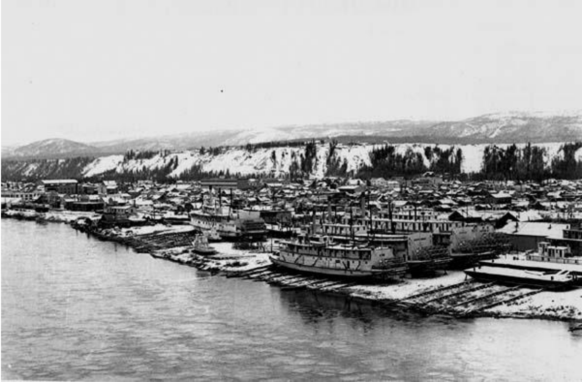
Ship Yard 1958 – Whitehorse

This photo includes the Klondike and the Loon as well as the boats in Ira's photo.