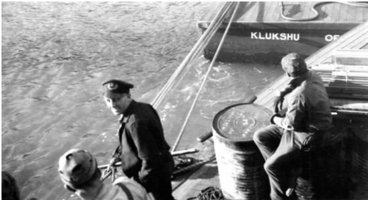
Barge name – KLUKSHU of DAWSON