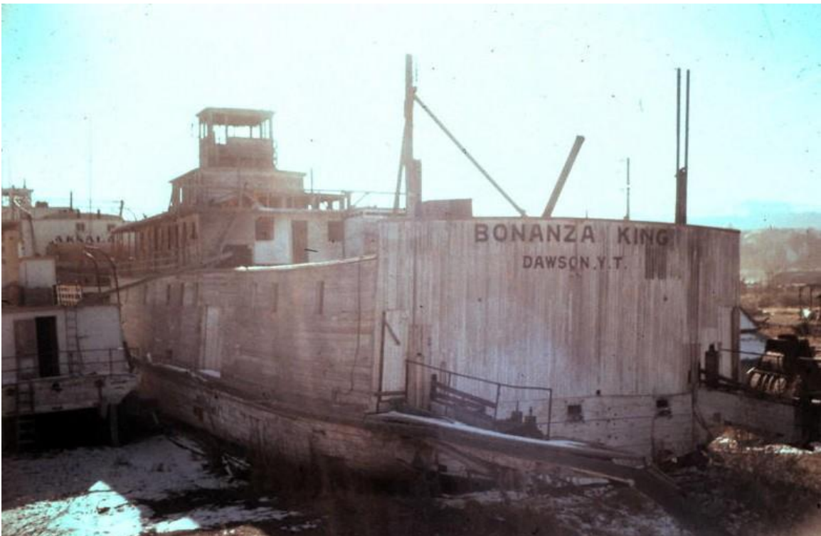
The decaying Bonanza King resting behind the Aksala Interesting to observe the paddlewheel is not attached