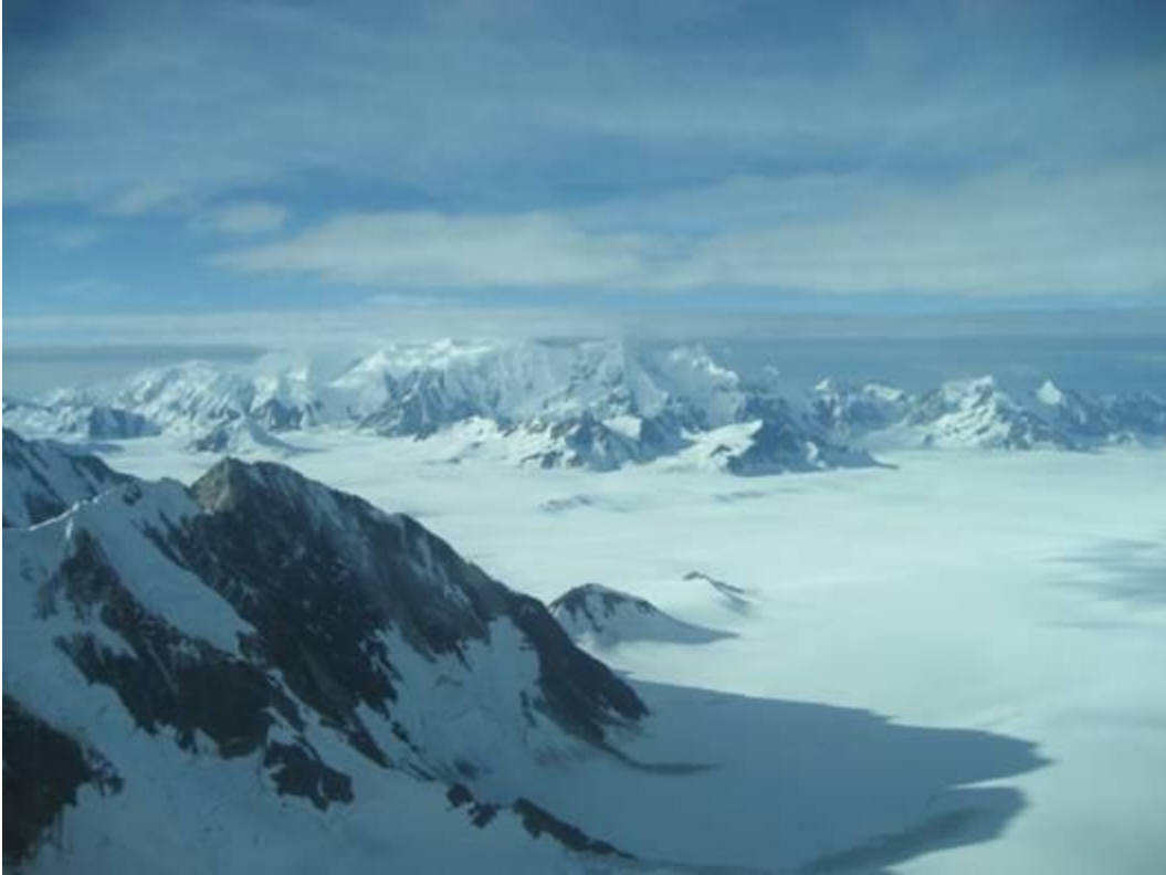
Seward Glacier (R) and north side of Mt. Cook (In Haines Junction) Below - Seward Glacier (looking south)