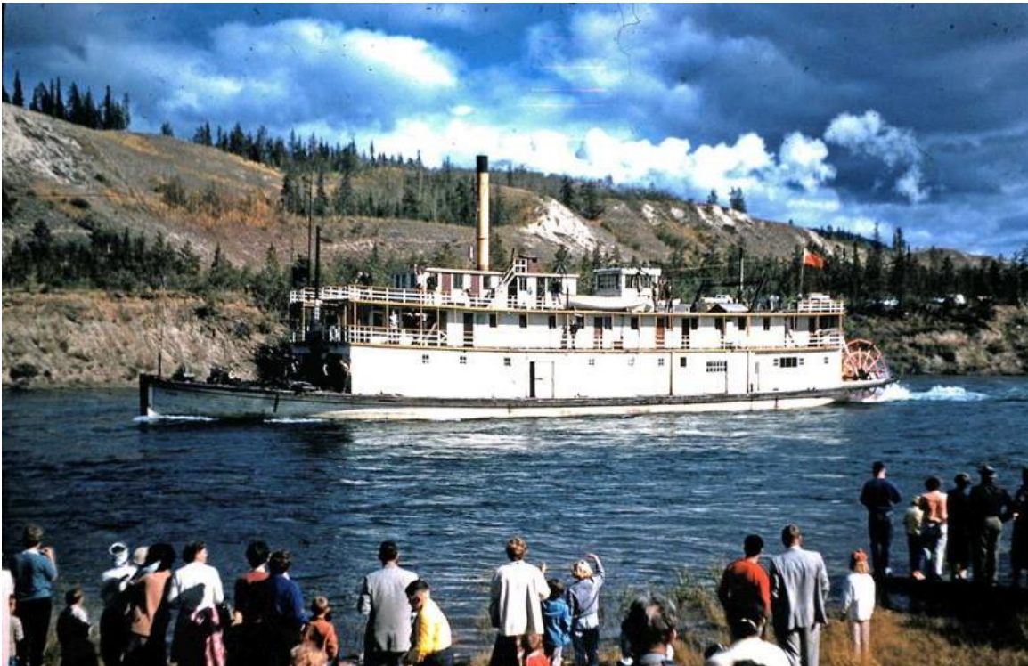
Heading down river in front of the crowd gathered to see her off