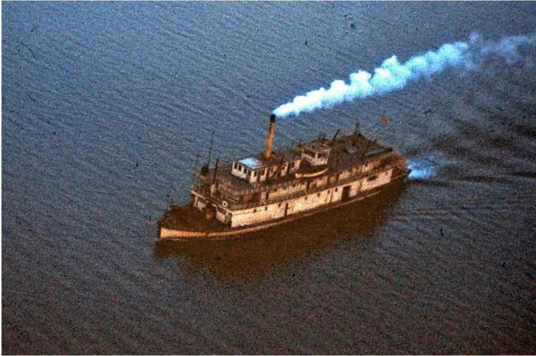
View from the air of her crossing Lac Labarge - Note the wheelhouse removed and placed behind the upper deck in order for her to get under the new Carmacks bridge. The smoke stack was hinged down for that passage also. – August 1960