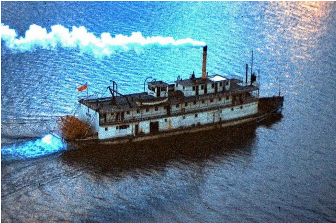
Keno crossing Lac Labarge on way to Dawson – August 23, 1960 – Final Trip