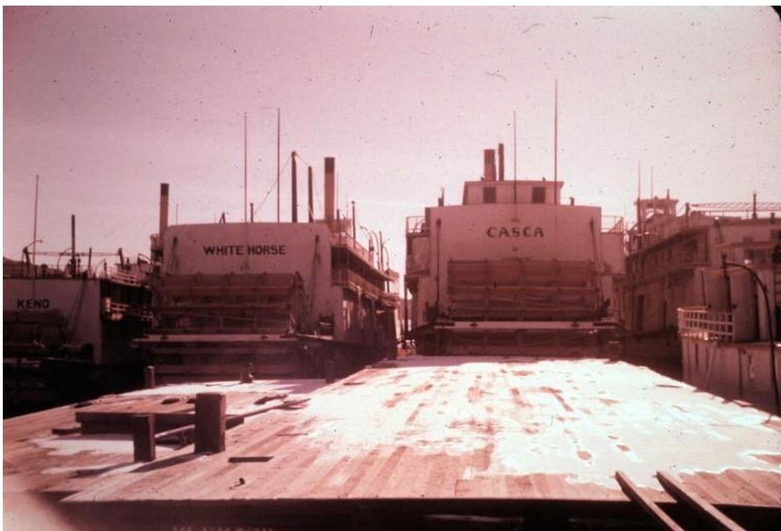
Keno, White Horse, Casca and Aksala from the rear, with a barge in the foreground. A very careful look at this image reveals the tops of the letters of the barge name KLUKSHU.