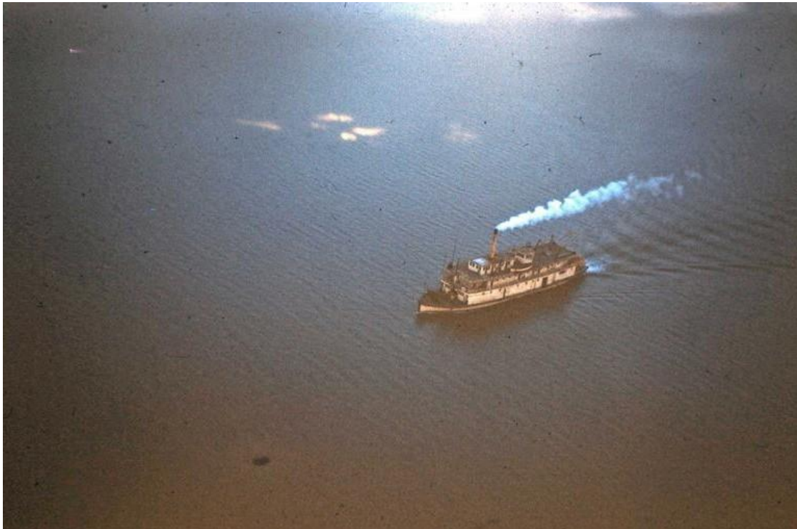
Keno crossing Lac Labarge on way to Dawson – August 1960 – Final Trip