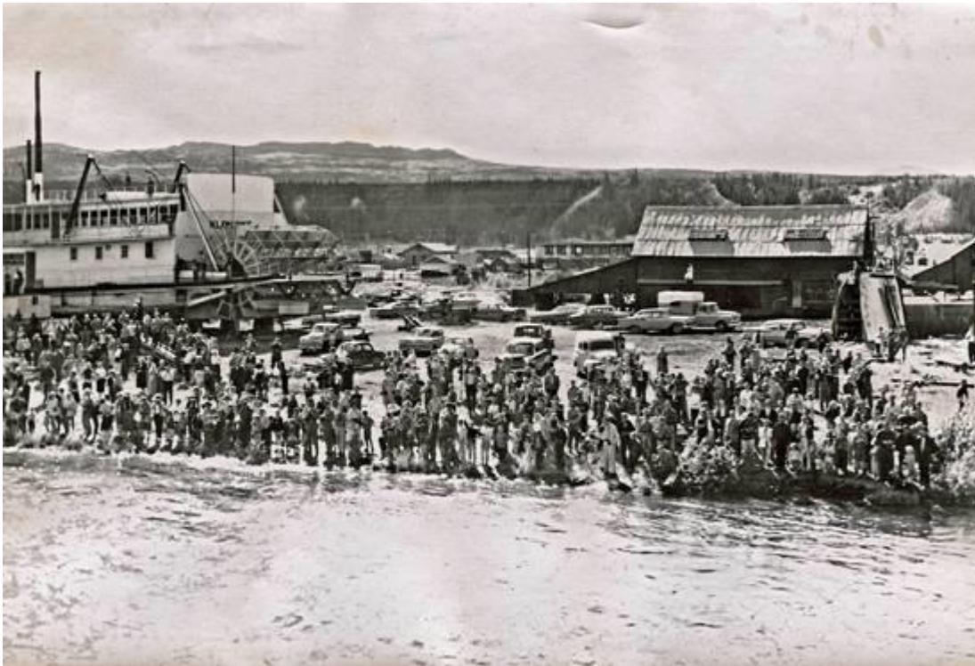
View from the Keno leaving Whitehorse for the last time.

Photo courtesy Tim Kinvig (from Terry Delaney collection) kinvig@northwestel.net (In Whse)