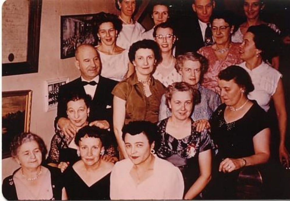
OES (I presume Order of the Eastern Star) 1957