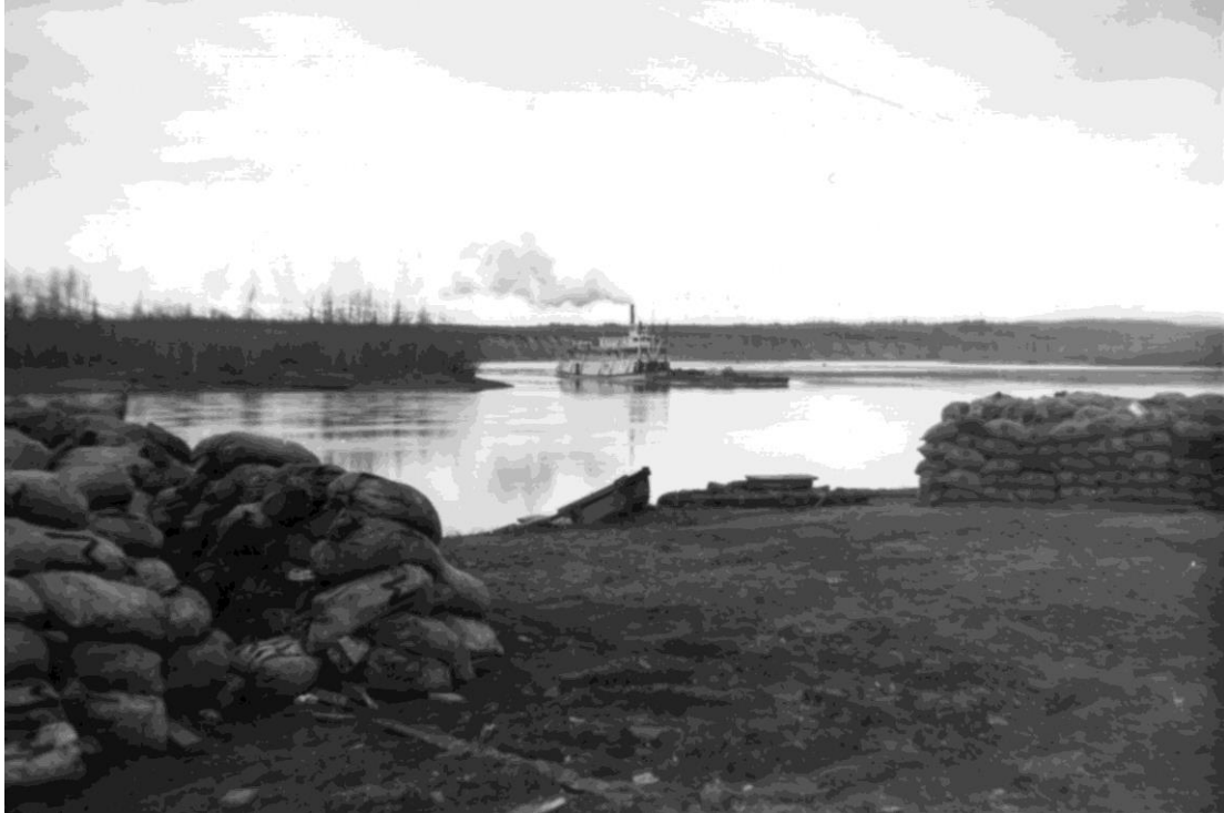
Aksala and barge approaching Mayo