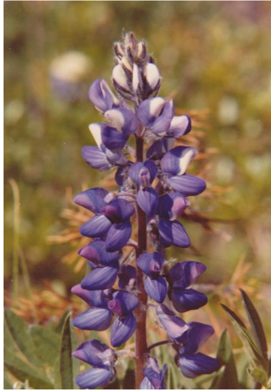
Arctic Lupin – widespread in Yukon