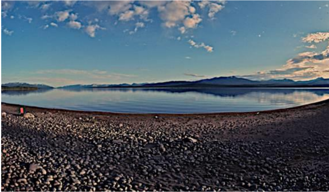
Beach Party Over

To use an e-mail address from the MocTel, replace the * with @.