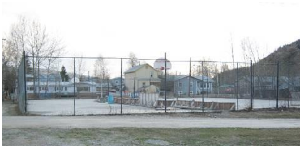
Tennis court. Presently there's road hockey, basketball and skateboarding going on in this tennis court.

This clears the way to move forward on plans to relocate the displaced childrens' park on which the Yukon Hospital Corporation will be building the new Dawson Hospital.