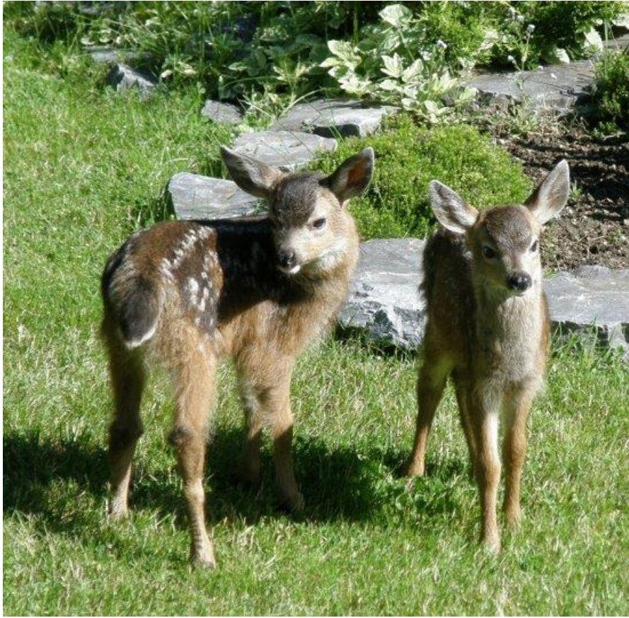
(On Texada Island)