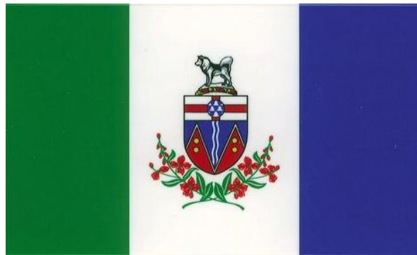
The Yukon flag adopted, 1967.

The green panel adjacent to the mast stands for the forests, the white centre panel for the snow and the blue outer panel for water. The centre white panel has the Yukon crest above a symbolic representation of fireweed, the Yukon's flower.