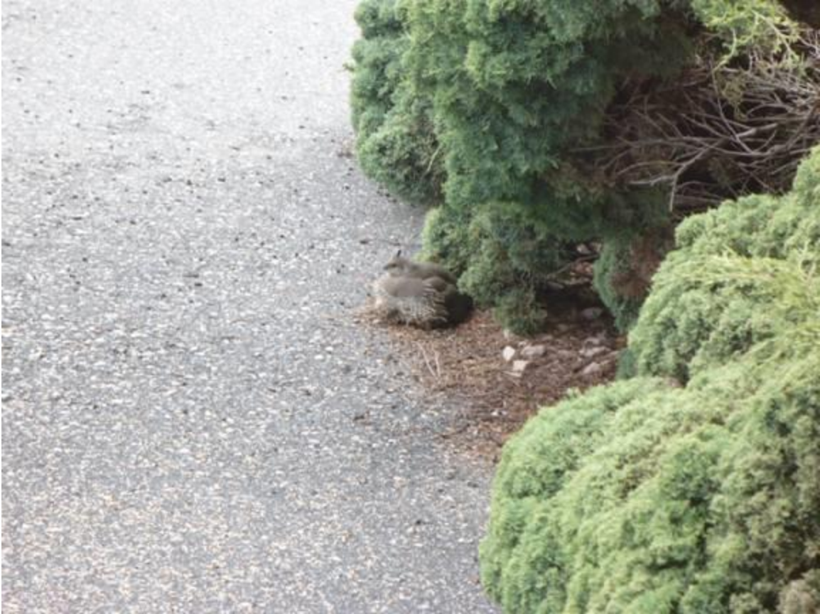
One word from father of a sign of danger and all 13 hide under mother. (In Vernon BC)

The photos taken show the babies on the 3rd day we had seen them in our yard. On the 4th day only 10 baby quail accompanied the parents on the 5th day only 5, on the 6th only 1 and on the 7th day we did not see any sign of any babies. Who knows what was taking them, but possibly the Magpies.