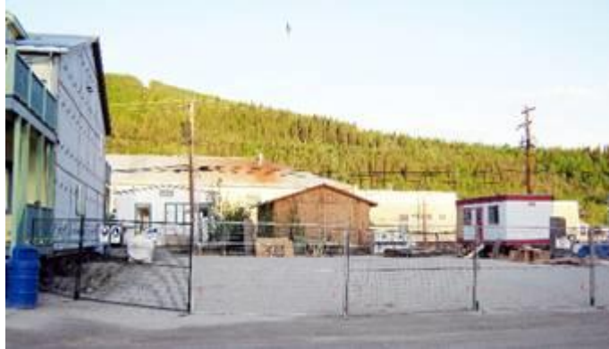
Yukon College site.

Photo courtesy Dan Davidson uffish@northwestel.net (In Dawson)