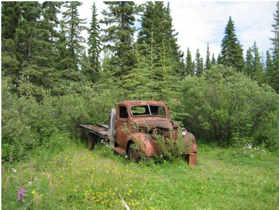
The truck at Lower Laberge hauled wood during the 1950s for the last of the river steamships

Sherron Jones sherronjones*shaw.ca (In Yuma AZ)