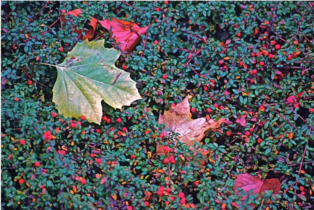
Berries & Leaves

To use an e-mail address from the MocTel, replace the * with @.