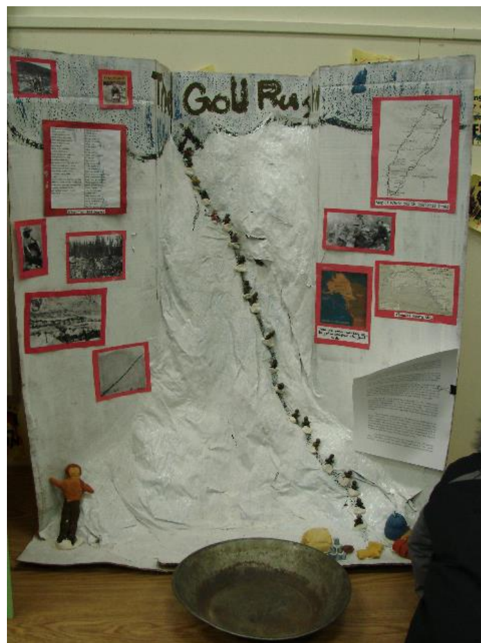
The Golden Stairs of the Gold Rush made for a graphic display.