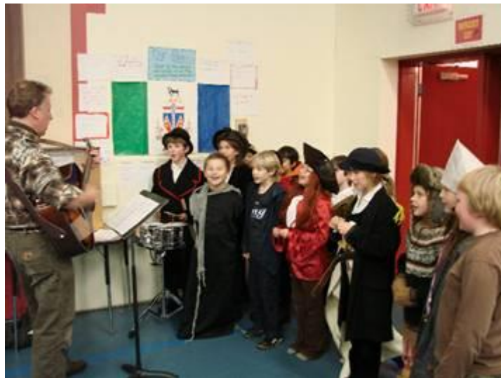
Grade 4 Sings Stan Rogers' "Northwest Passage".