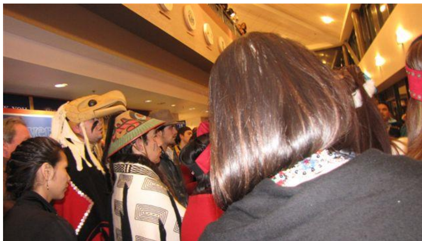
Some of the Dancers