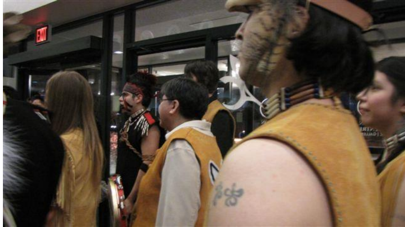
Some of the Dancers