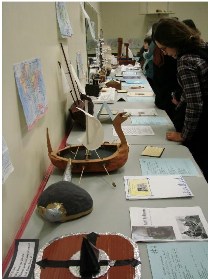
The Grade 4 class produced many projects on explorers.