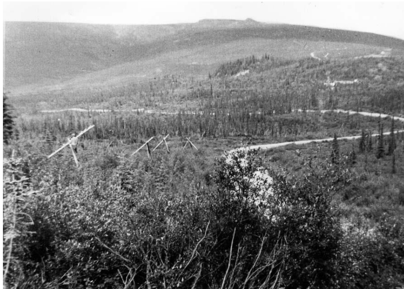
Tripods and the telephone line near Keno Hill (In)

After stopping to eat our lunch, we went back to the truck and drove a few miles towards Mayo to a place where the line crossed the road. Starting on the Mayo side and walking southward, we began another patrol of the line. I found much the same conditions - line on the ground, sections of wire missing, and a very zigzagged path apparently necessitated by the original builders of the line wanting to use trees to support the wire. Often there were small trees in a more direct line, but to get the wire onto tall trees, the line would deviate from a straight-line path. Where there was no tree available, a tripod was used made from three poles about 18 feet long tied together near one end, and with an insulator fastened near the top. After a full afternoon of patrolling and making notes we hiked back to the truck and returned to Elsa.