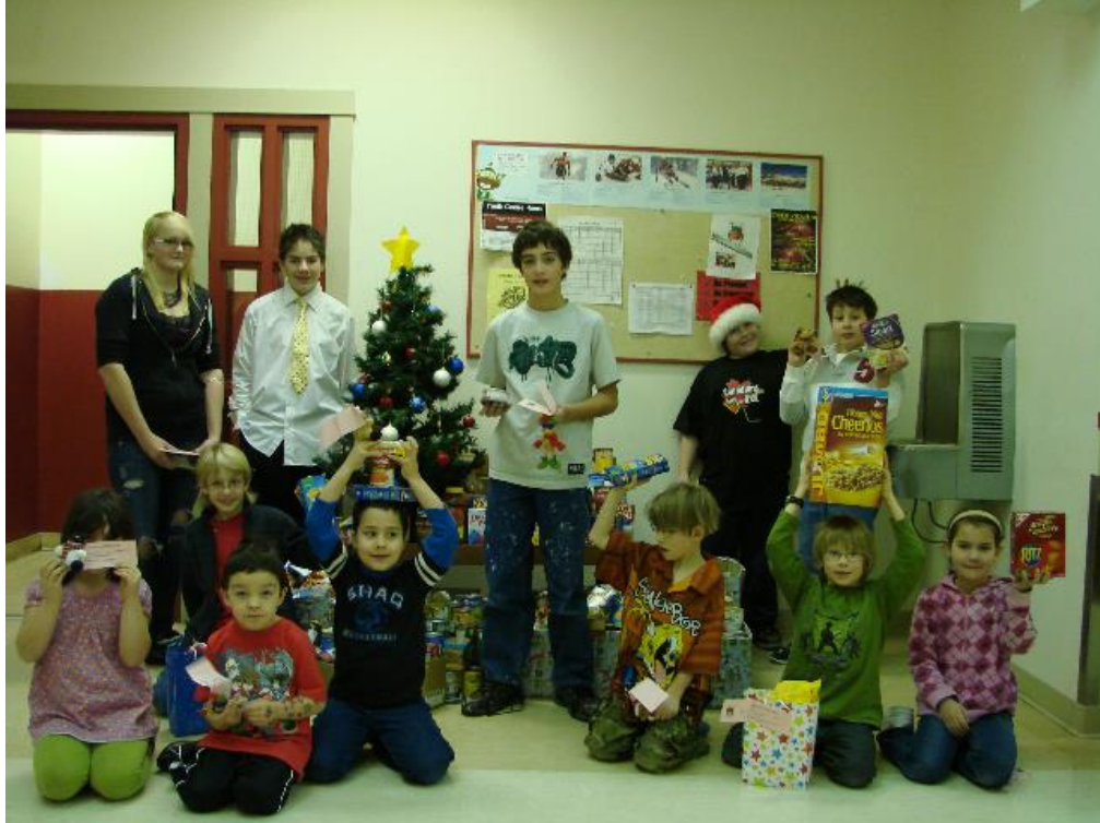
Robert Service School students with food for the Women's Shelter