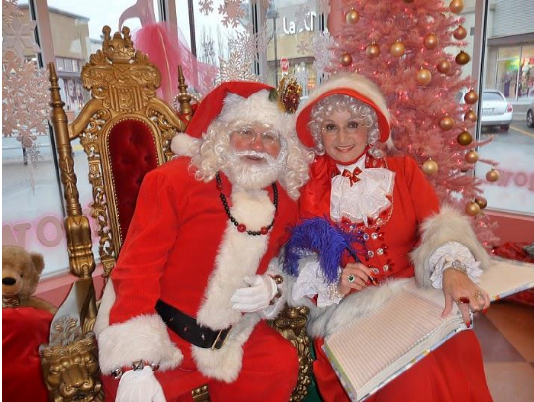
Santa & Mrs Claus

(In White Rock BC)