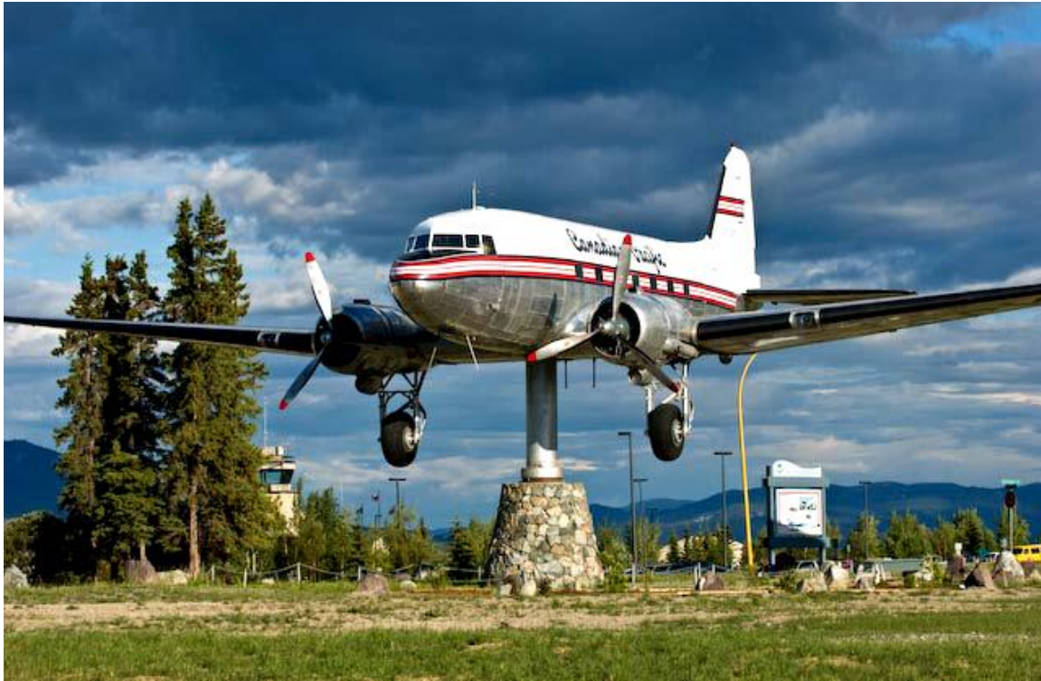
DC-3 at Erik Nielsen Whitehorse International Airport

To use an e-mail address from the MocTel, replace the * with @.