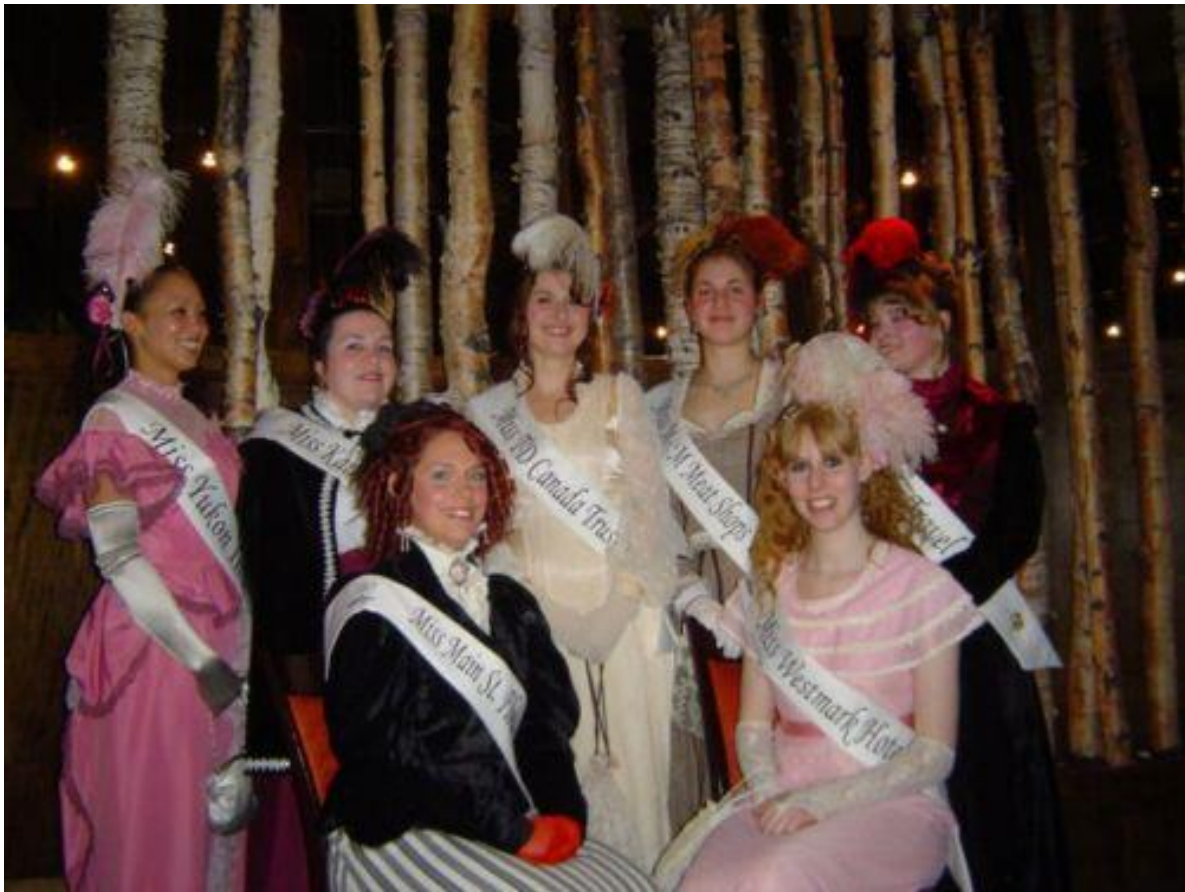
Sourdough Rendezvous Queen Candidates