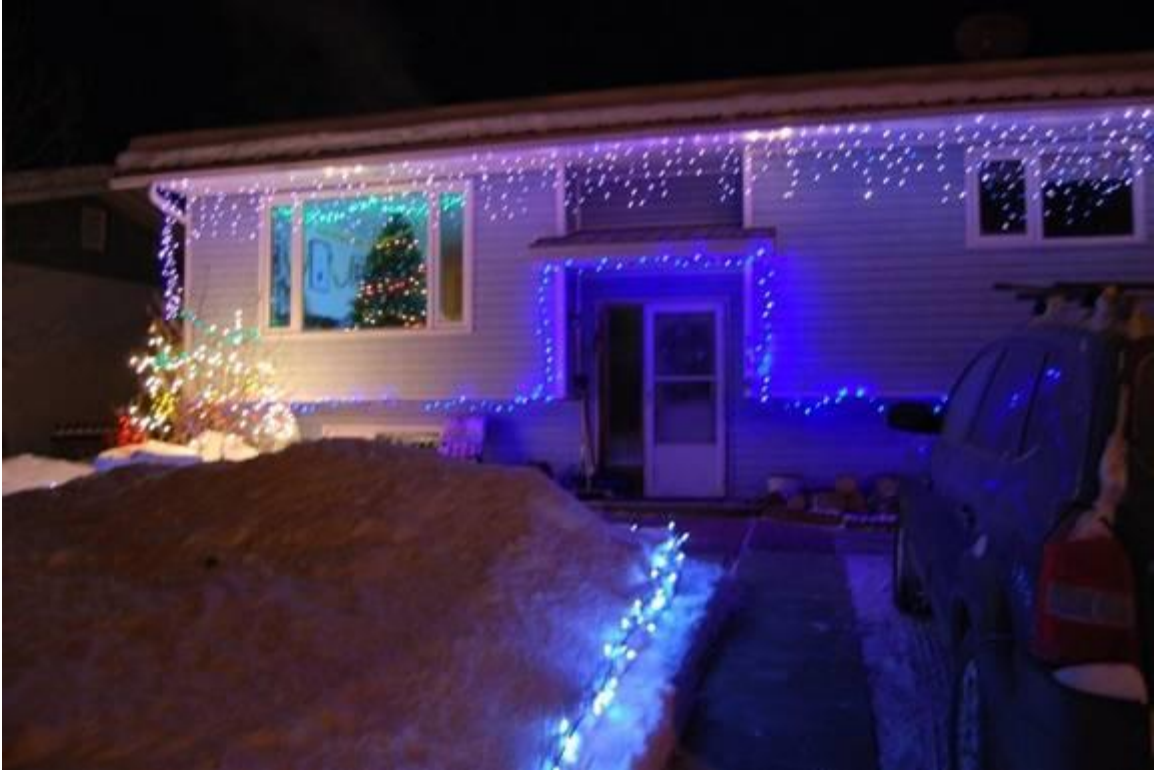
Merry Christmas from the Bastiens' – Haines Junction – December 14, 2008 Photo courtesy Jean Bastien hondahog*northwestel.net (In Haines Junction)

So....now it's about -32C and not expected to warm up for a few days, but supposed to warm up by the 22nd, just in time for Christmas. But that's OK. I've got all the firewood cut and stacked and easy access to get it into the house. I guess we're about as ready for Christmas as we'll ever be, for once. hahaha