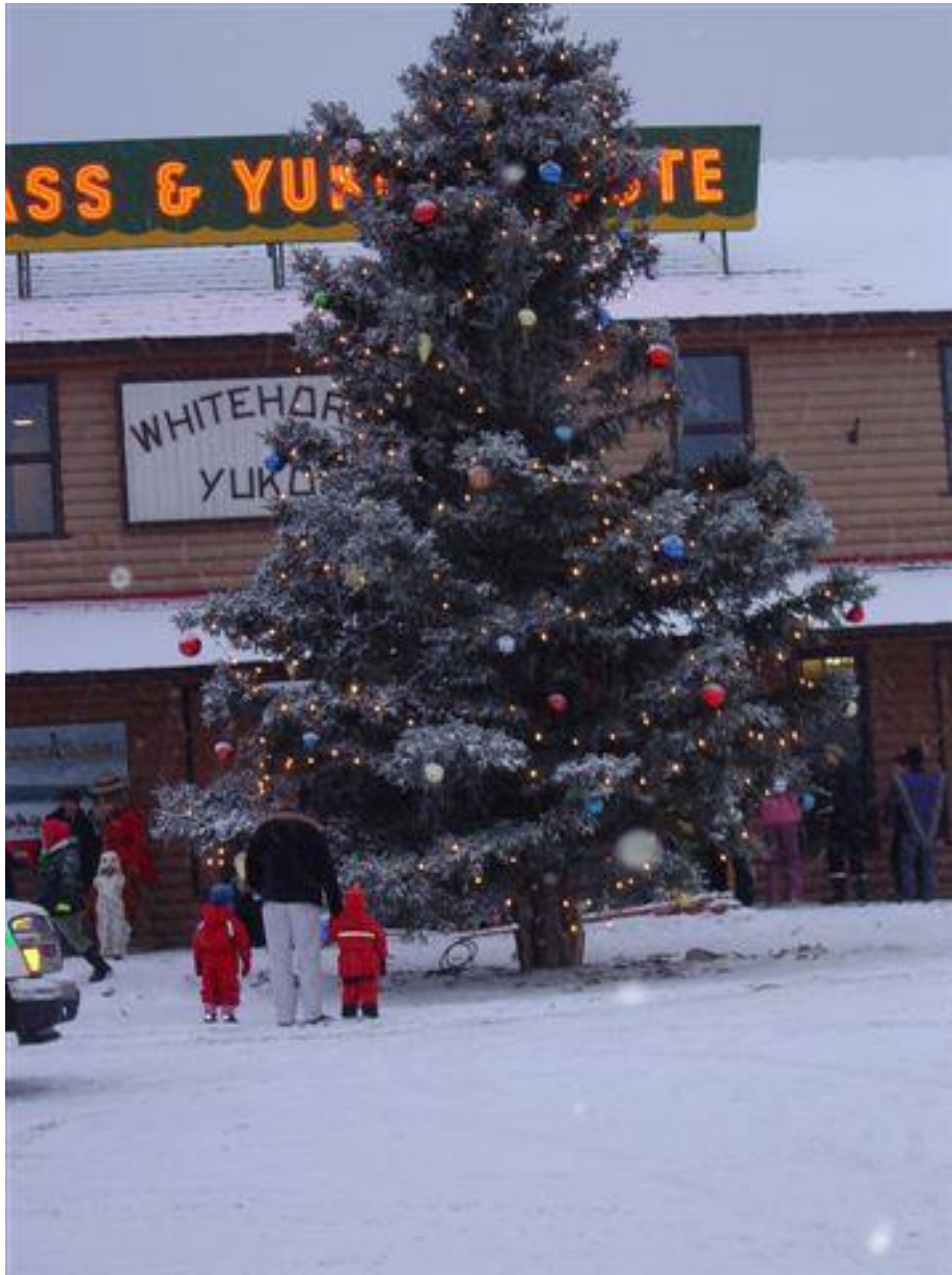
Christmas Tree at the end of Main Street in Whitehorse Photo courtesy Donna Clayson bdclayson*northwestel.net (In Whitehorse)

Donna Clayson bdclayson*northwestel.net (In Whitehorse)