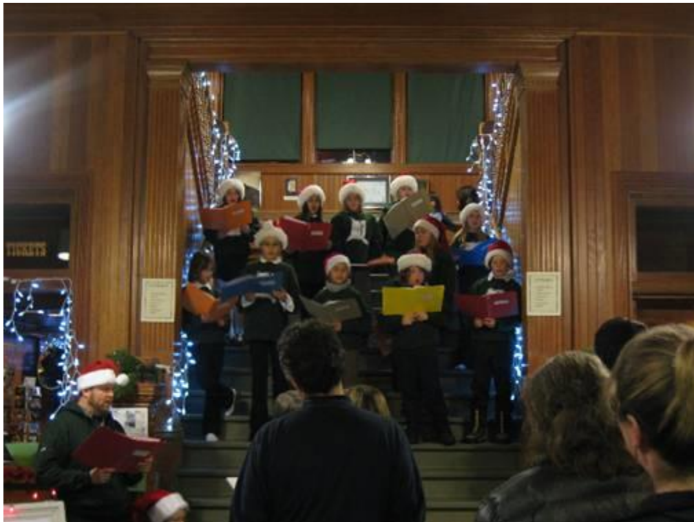
The staircase makes a handy choir loft.

The kids were in fine form this year and their audience was just as enthusiastic. Following the singing, most folks got on with their visiting, but the choir made its way across the street to the MacDonald Lodge where they sang for the seniors.