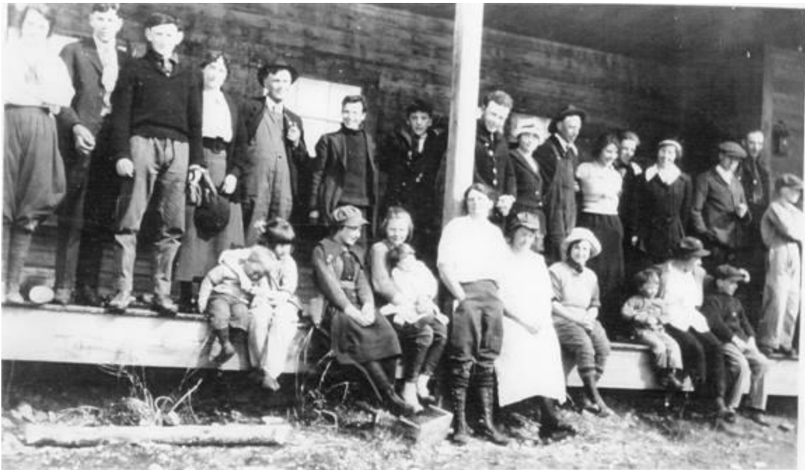
(In Whitehorse)