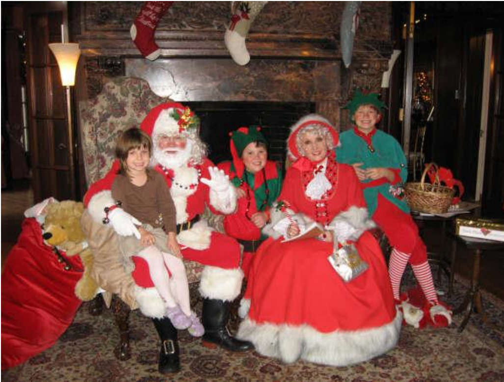
Merry Christmas from Santa, Mrs. Claus and the elves. (In Burnaby)