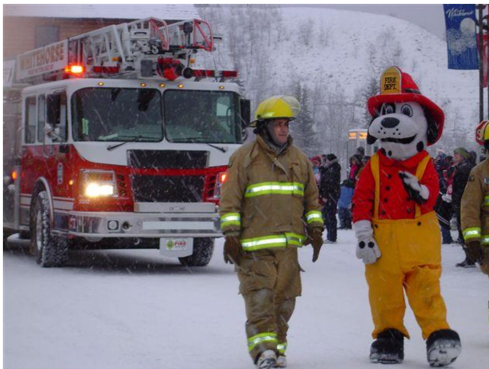
Fire Dept Mascot.