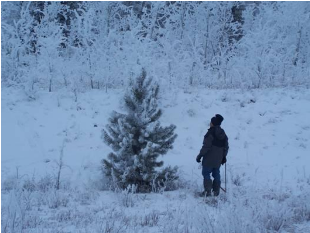
Christmas Tree Shopping, Yukon Style

(In Whitehorse)