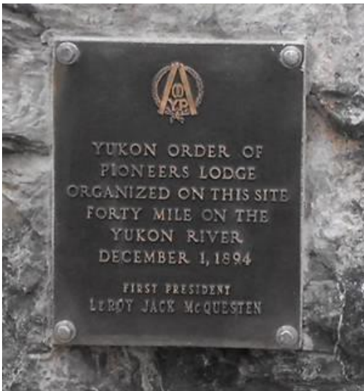
The 1973 plaque celebrating the founding of the Yukon Order of Pioneers Photo supplied by the YOOP and submitted by Dan Davidson uffish*northwestel.net (In Dawson)