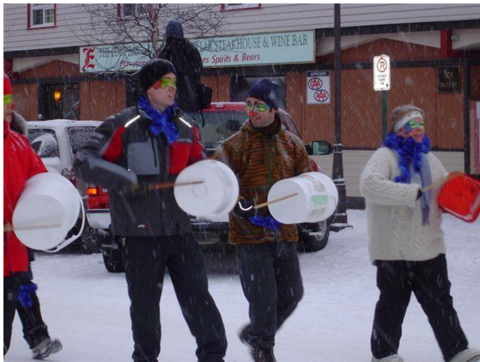
(In Whitehorse)

This was so cute. Drummers using plastic pails. One was a kitty litter pail. Neat. (In Whitehorse)