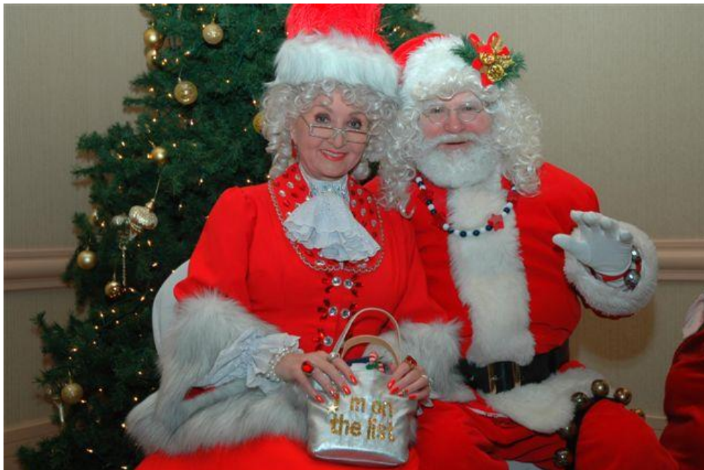
Santa & Mrs. Claus wishing you a Very Merry Christmas