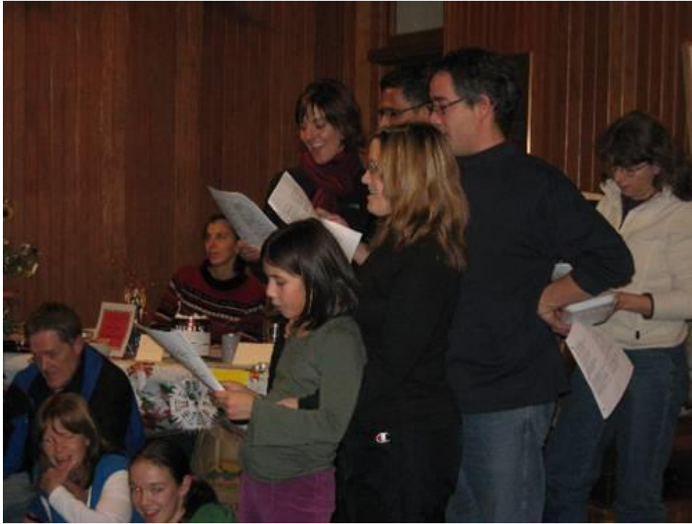
Getting into the Advent Spirit. (In Dawson)