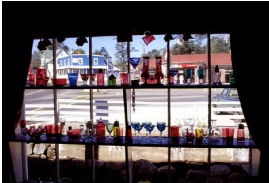
Window Shopping from the inside out. (In Whitehorse)