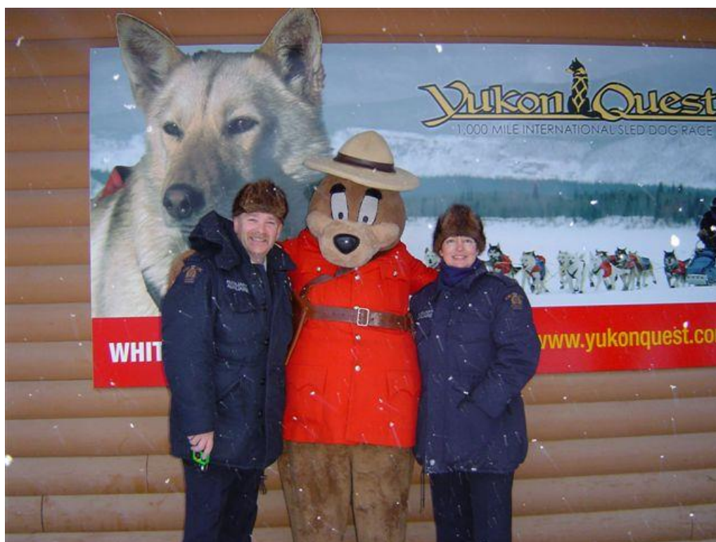
RCMP Mascot & Members.