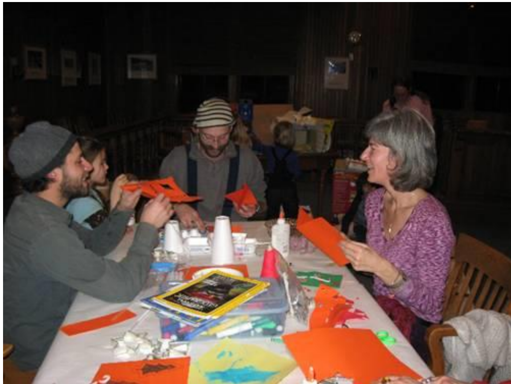
Christmas decorations under construction.