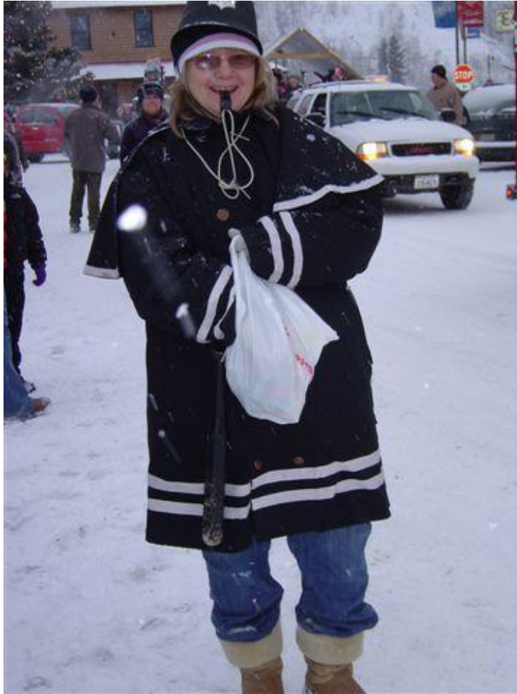
Keystone Cop, Handing out Candy.