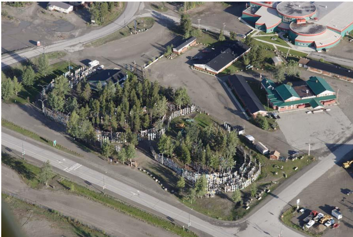
Signpost Forest – Watson Lake (In Watson Lake)