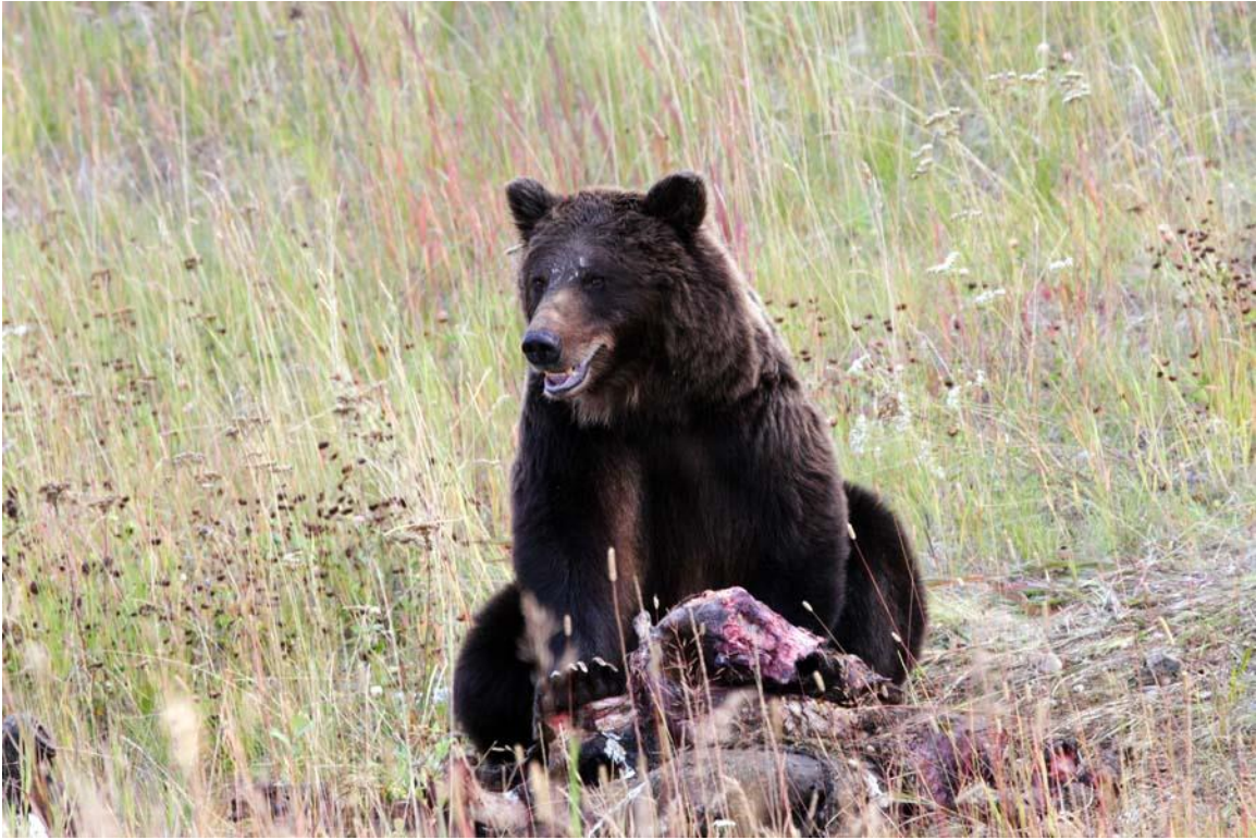
Grizzly dining on a young Bison north of Contact Creek (In Watson Lake)