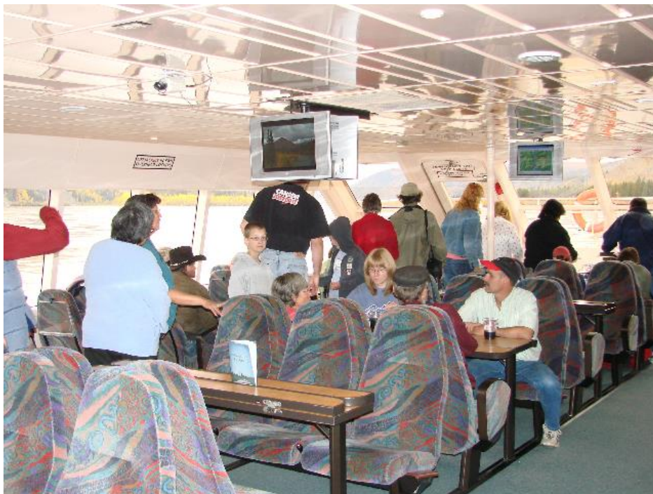
The comfortable interior of the cruise boat provides a good view of the land and the river. (In Dawson)

The Yukon Queen II will spend its winter in Eagle and return in the spring.