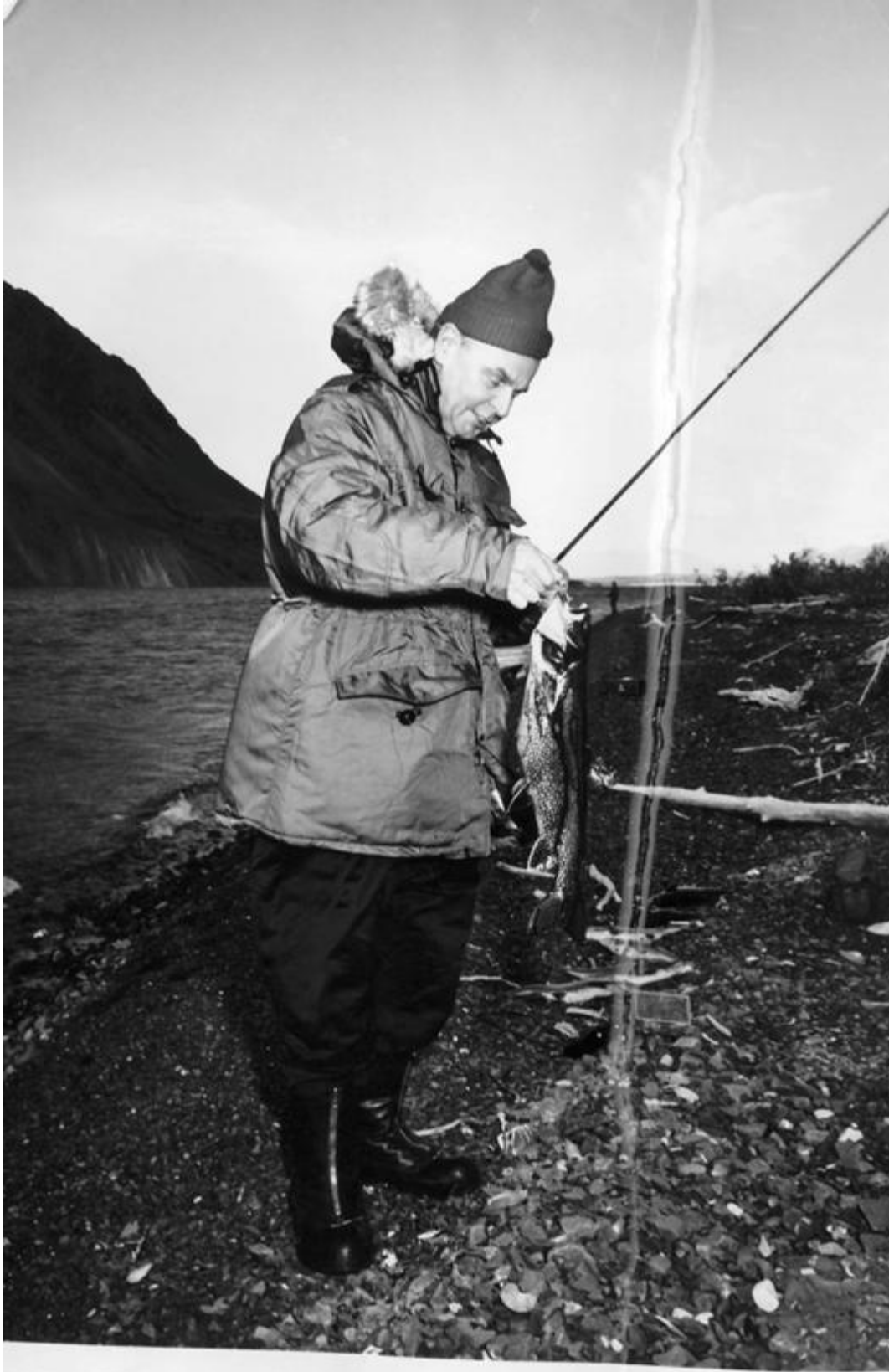
A successful fishing trip for Prime Minister John Diefenbaker (In Whitehorse)