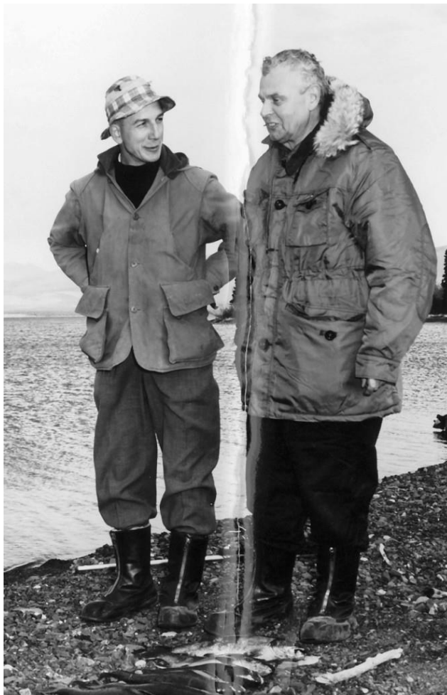
Erik Nielsen & Prime Minister John Diefenbaker – 1958 (In Whitehorse)