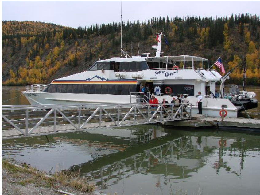
Passengers leave the boat for the last time this season.