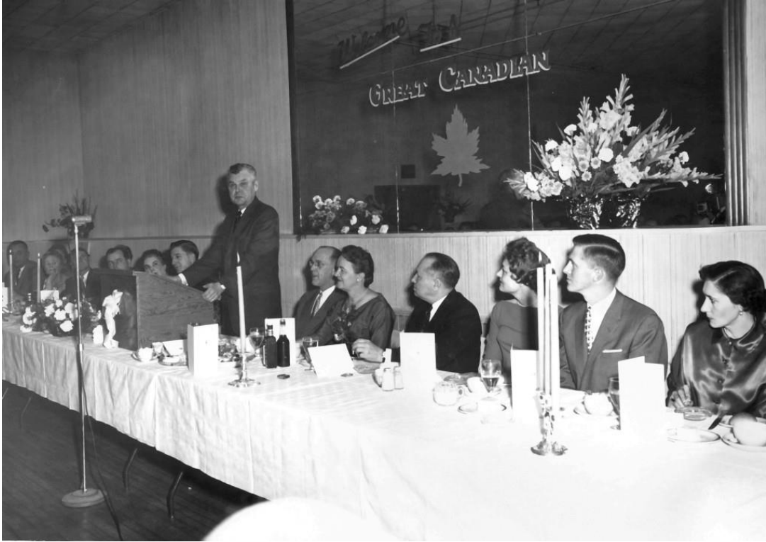
A banquet in the Whitehorse Inn Ballroom (In Whitehorse)