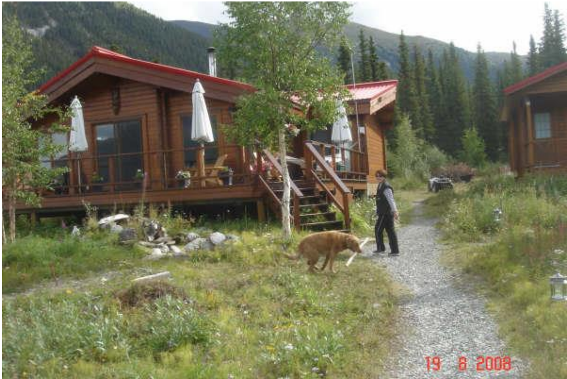
(At Tin Cup Lake, Yukon)