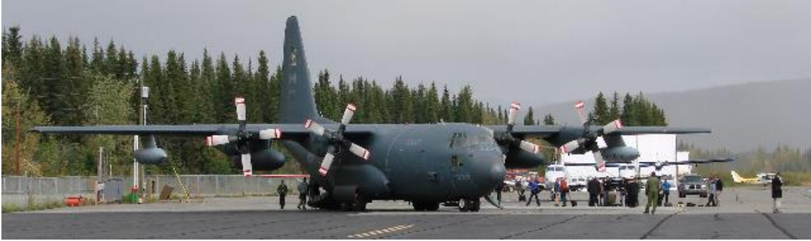
As the tour ends the Hercules aircraft is loaded with its passengers and their equipment.