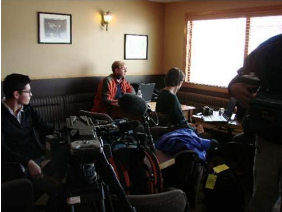
The press waited out the luncheon in the Sluice Box Lounge, working on their stories.