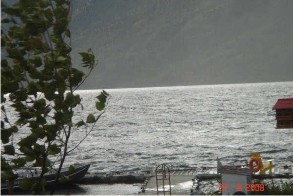
(At Tin Cup Lake, Yukon)