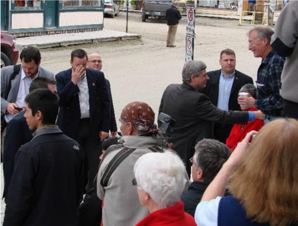
Harper's last encounter with locals and tourists was at the Old Post Office, across from the Palace Grand Theatre.