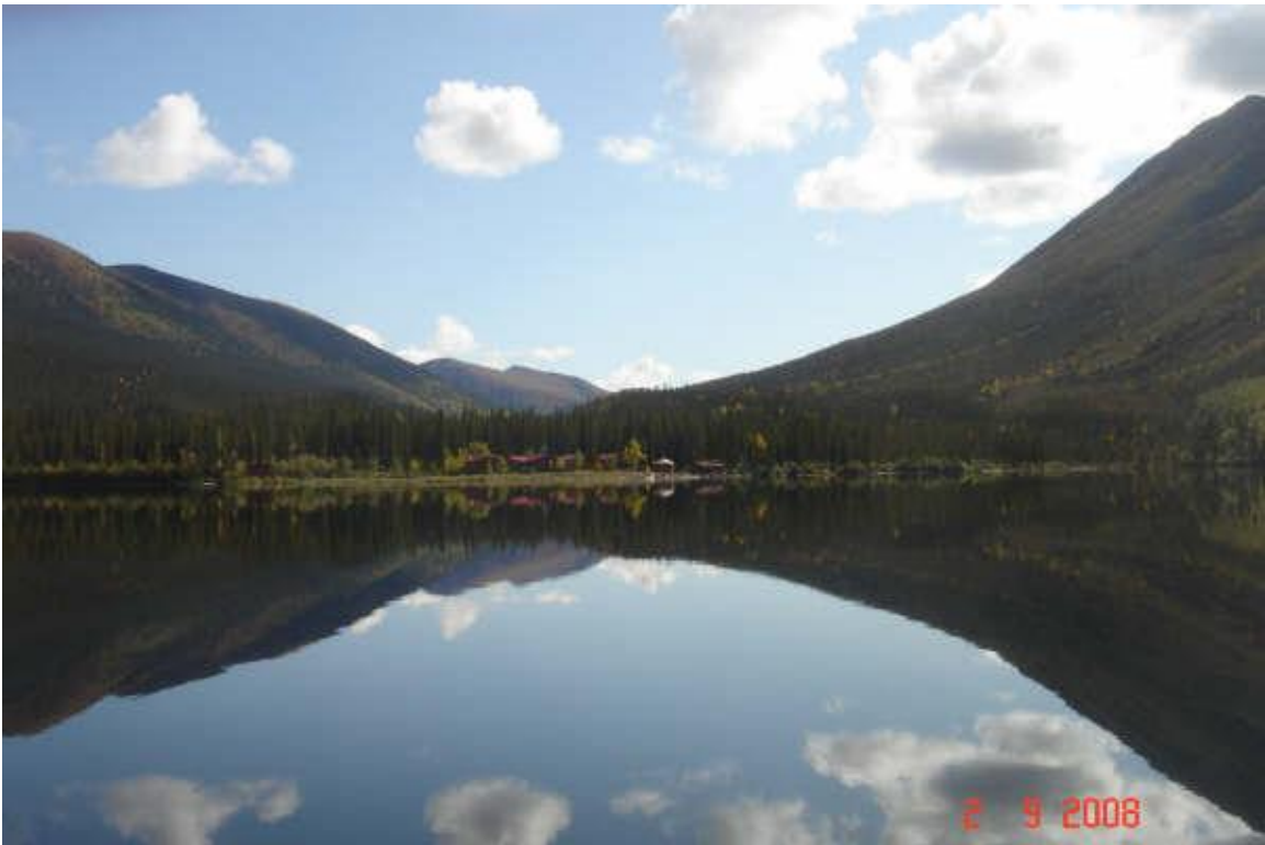
Tin Cup Lake