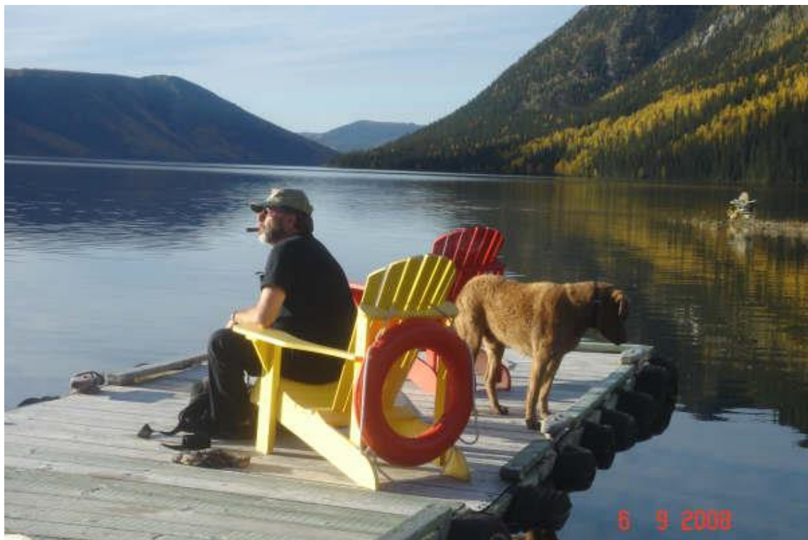
Look who sees fish in the lake. (At Tin Cup Lake, Yukon)