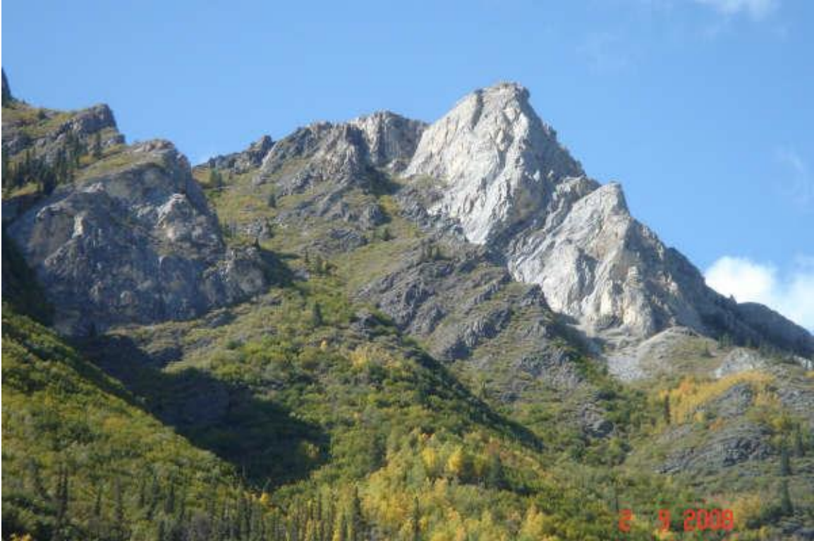
(At Tin Cup Lake, Yukon)