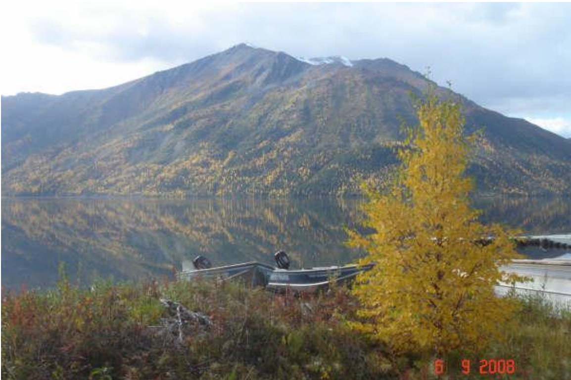
Opportunity and Serenity

(At Tin Cup Lake, Yukon)