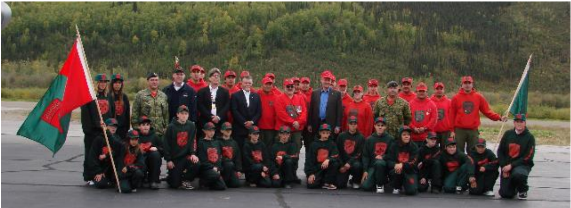
At the Airport, the PM and other dignitaries posed with the Rangers and Junior Rangers. (In Dawson)