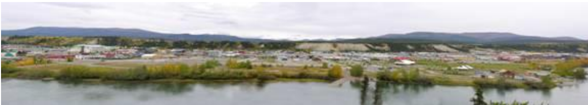
Whitehorse Panorama – Sept 9, 2008

In the September 9th photo you can see Shipyards Park is bounded by Ogilvie Street, Second Ave and the River. Along Second Ave from the intersection with Ogilvie you see the store signed "NOW" (formerly the "Saan" Store) then it's "Tim Hortons", "Pizza Hut", "A&W". Superstore's gas bar then KFC. The Service station that was on the curve of second Ave has now gone. The restaurant across Second Ave is "Boston Pizza". As of earlier this year do now have an "Earls" - its out by Walmart.