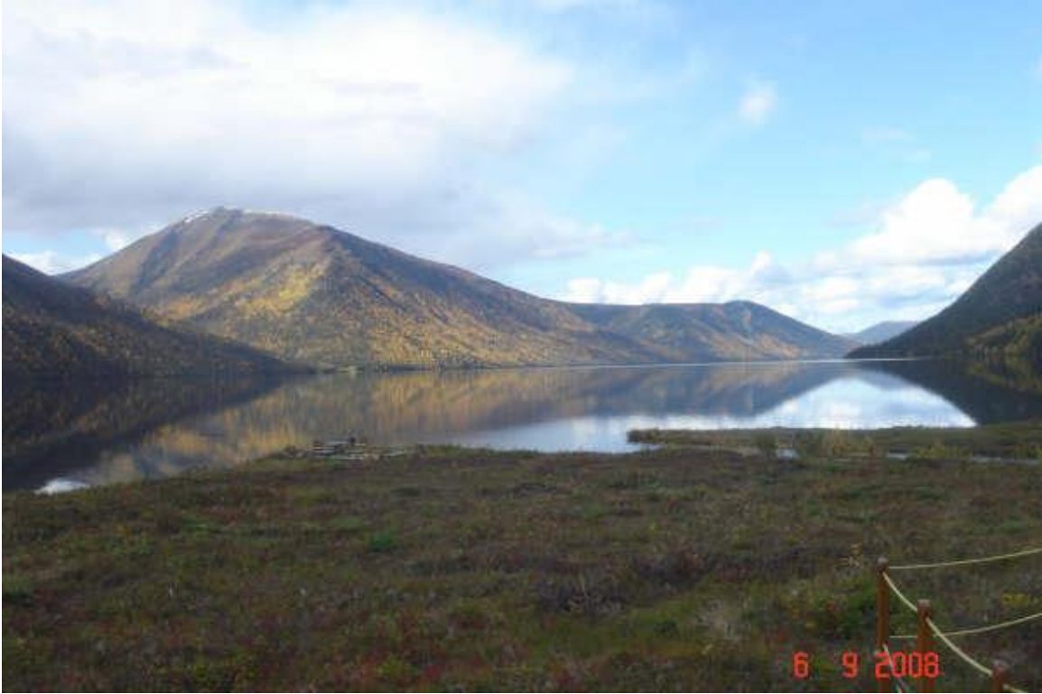
Tin Cup Lake

(At Tin Cup Lake, Yukon)