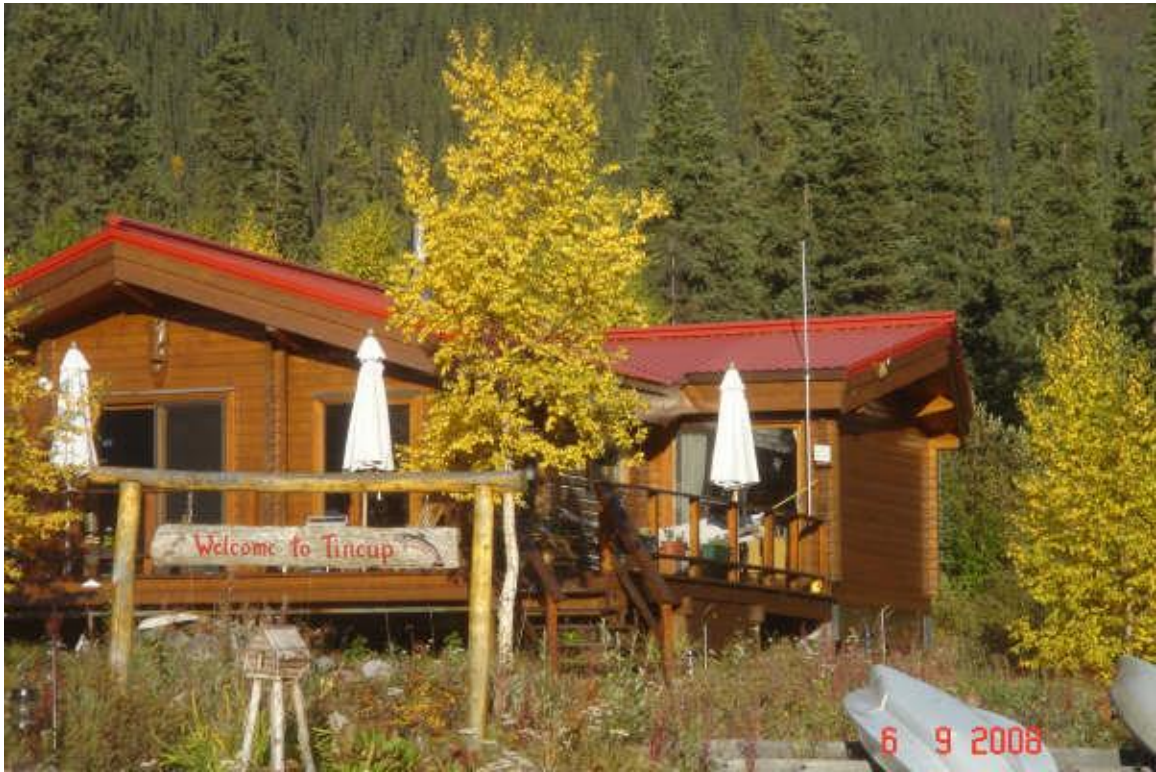
(At Tin Cup Lake, Yukon)