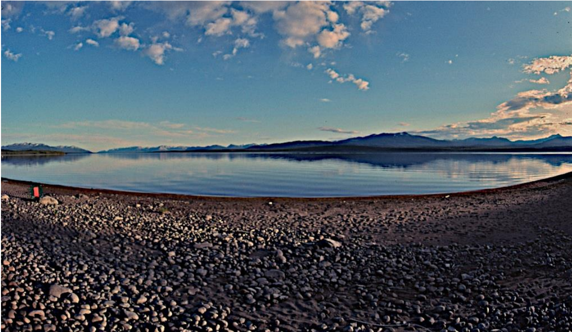
Marsh Lake – Wide Angle Lens