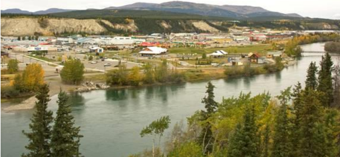
Taken this morning [September 9, 2008] - showing the complete park and where the Frank Slim building sits on the park. Photo courtesy Tim Kinvig kinvig*northwestel.net (In Whitehorse)