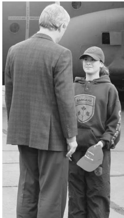
The Junior Rangers presented the PM with a Ranger cap.