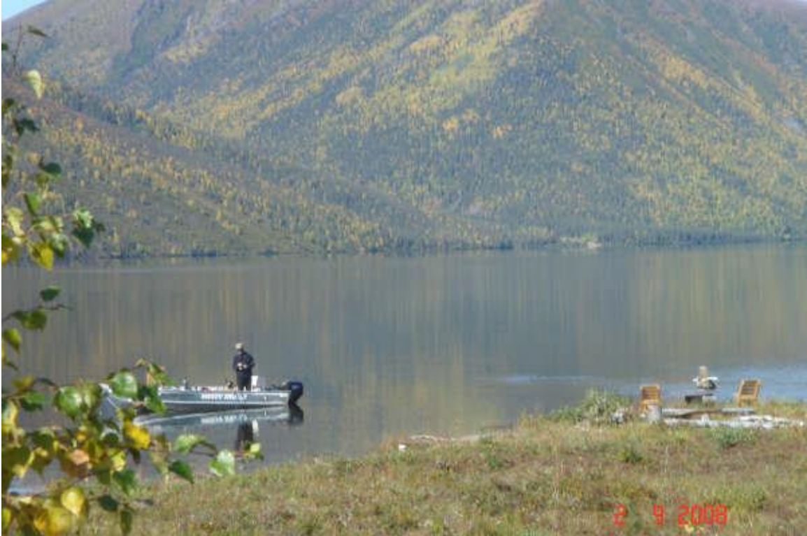
(At Tin Cup Lake, Yukon)