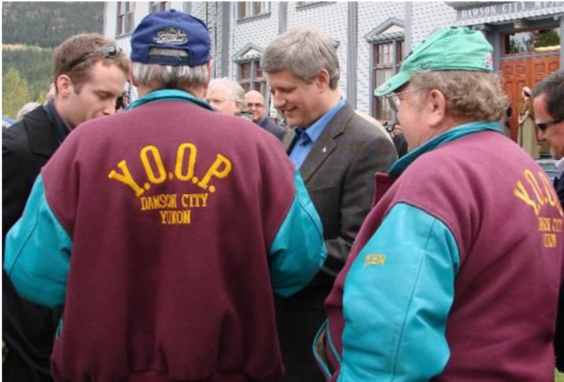
The PM was persuaded to accept a raffle ticket from the Yukon Order of Pioneers. (In Dawson)