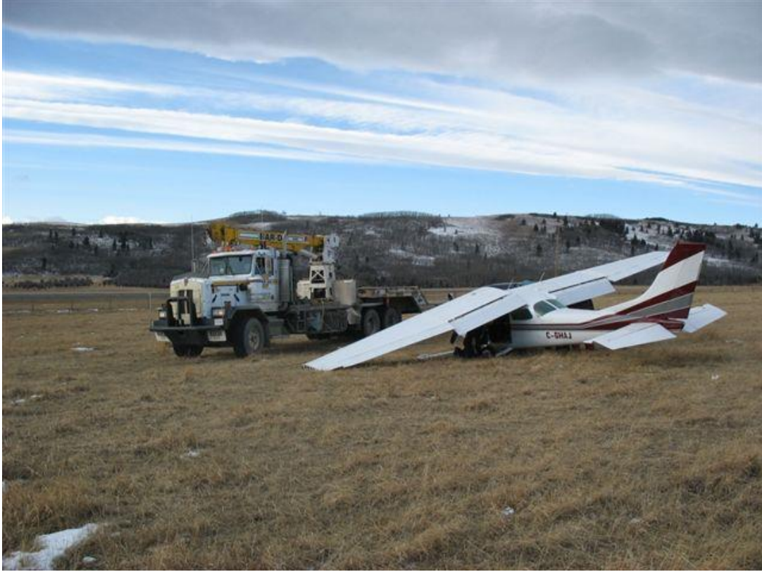
(In Calgary)