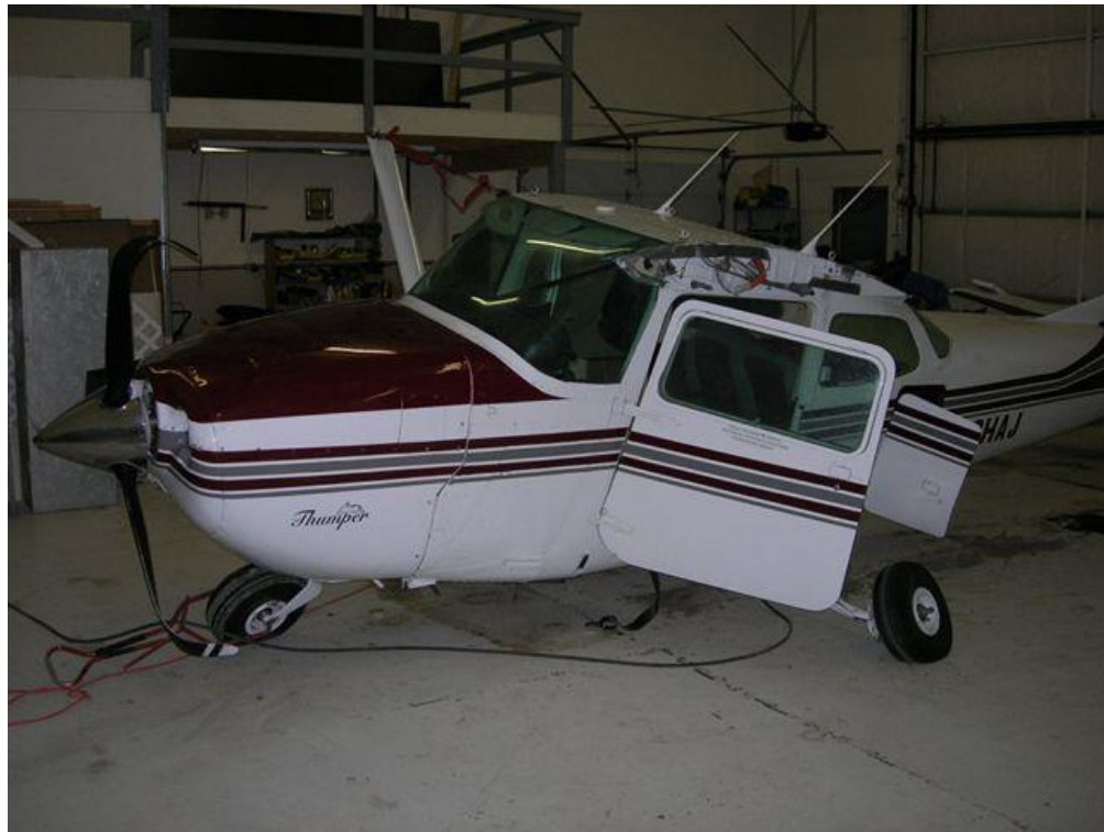
(In Calgary)