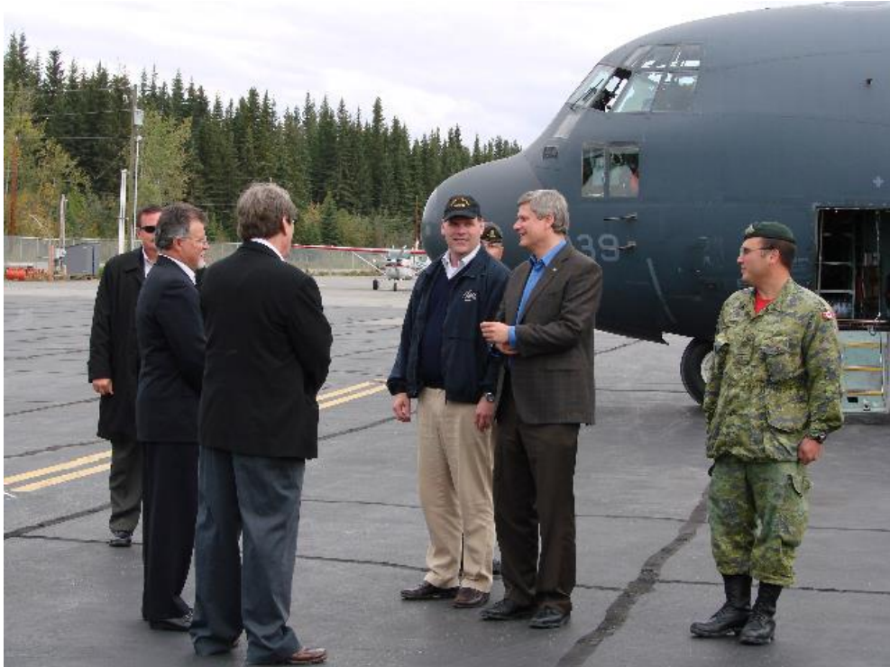
Premier Fentie, Mayor Steins, Environment Minister Baird and Prime Minister Harper meet at the Dawson Airport.