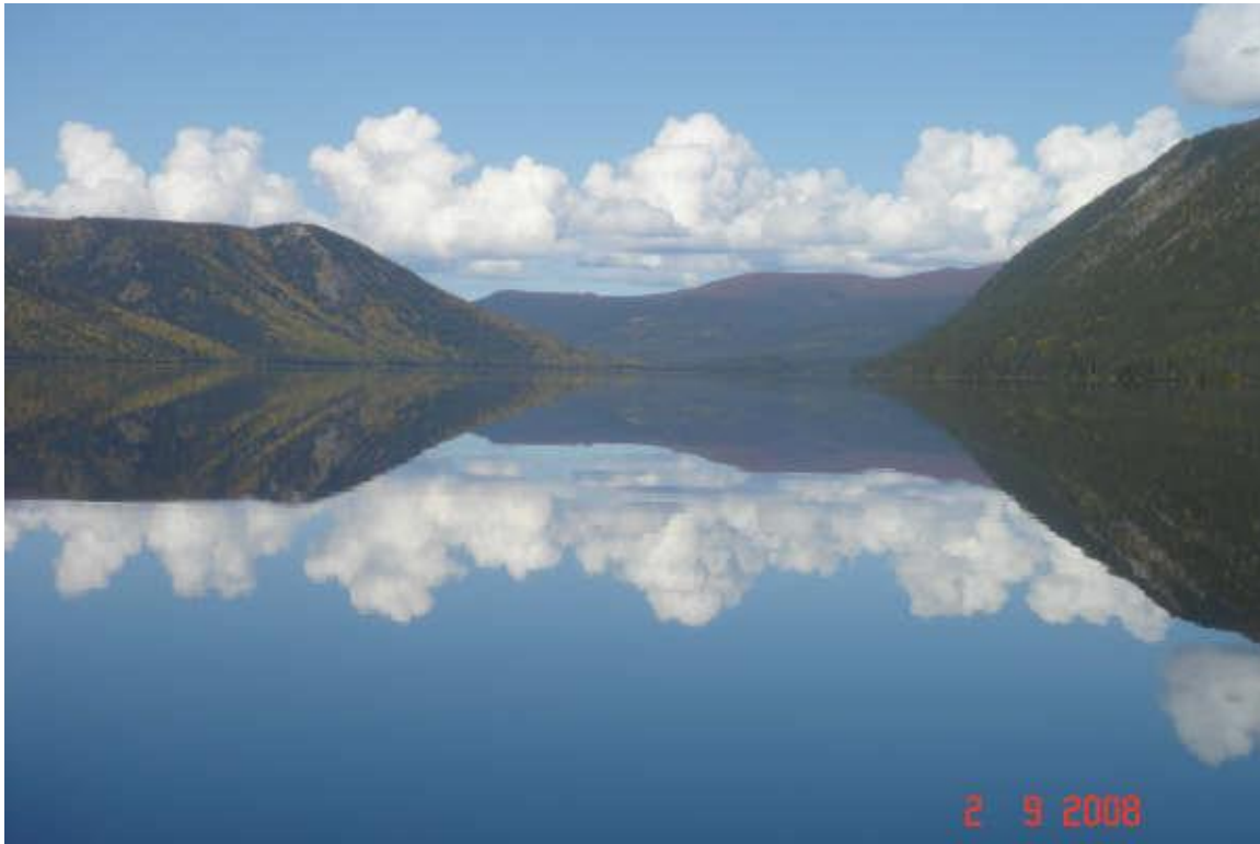
Tin Cup Lake

To use an e-mail address from the MocTel, replace the * with @.