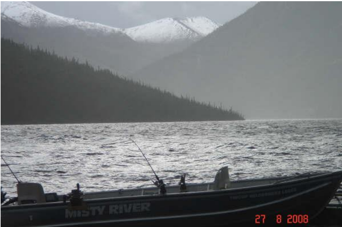
(At Tin Cup Lake, Yukon)