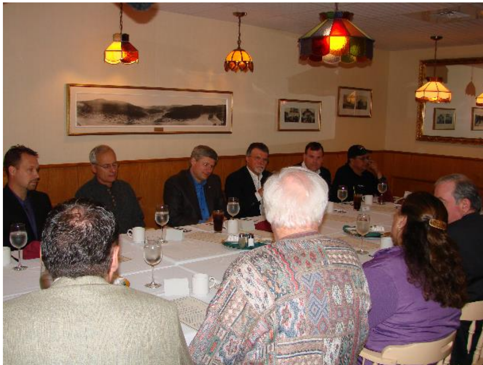
The lunch with community leaders took place in the Bonanza Room of the Eldorado Hotel.