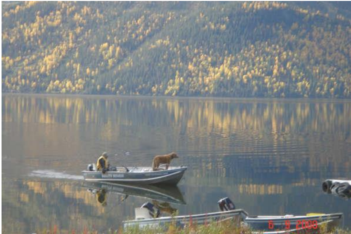
Such patience. Resident pooch Chester. (At Tin Cup Lake, Yukon)