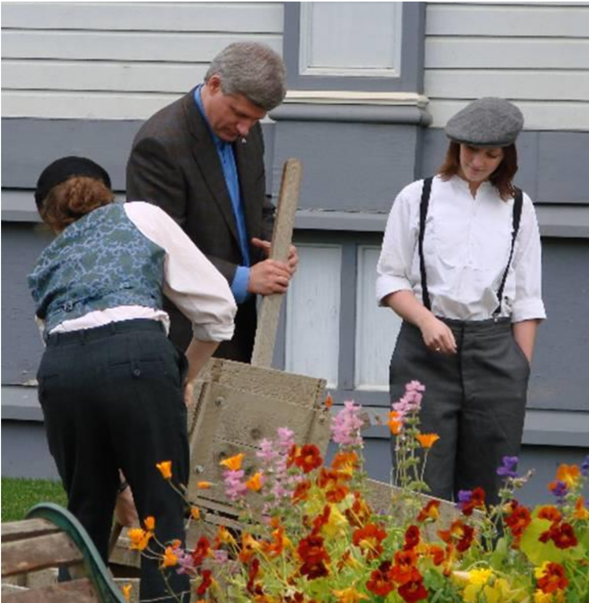
The PM gets a rocker box lesson at the Museum.