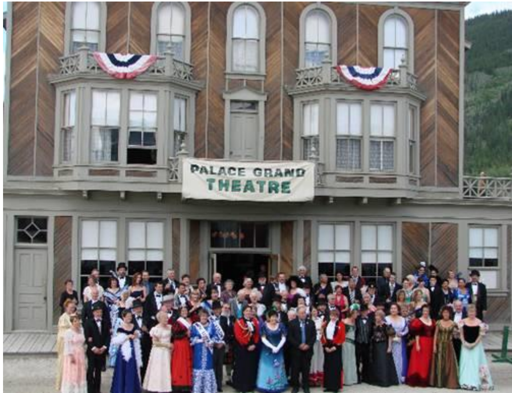
The photo op.

Yukon into the Dominion of Canada. It then appointed a Commissioner and council of six to govern the new territory.