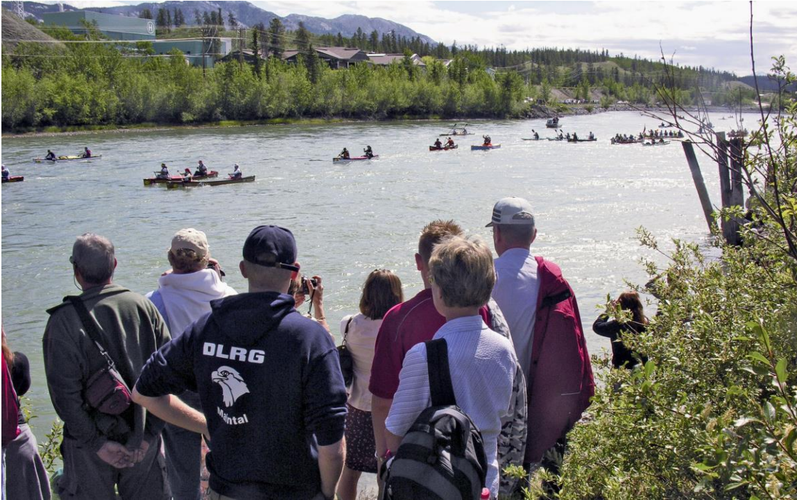
Race underway on Yukon River at Whitehorse – June 25, 2008 Photo courtesy Tim Kinvig kinvig*northwestel.net (In Whitehorse)