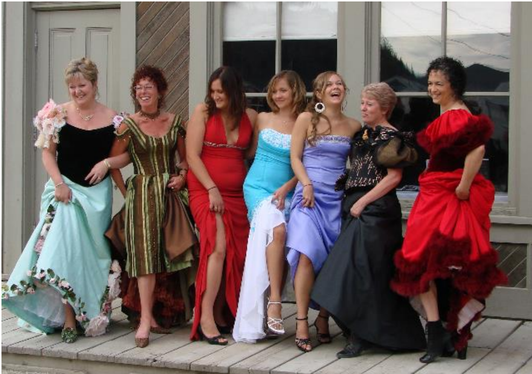
These Belles of the Ball show a little leg for the audience across the street.