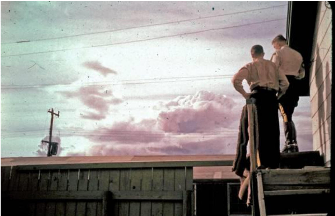
Anyone recognize these rear views? (1958-59) Photo courtesy Ira Saunders sandisaunders*rogers.com (In Ottawa)