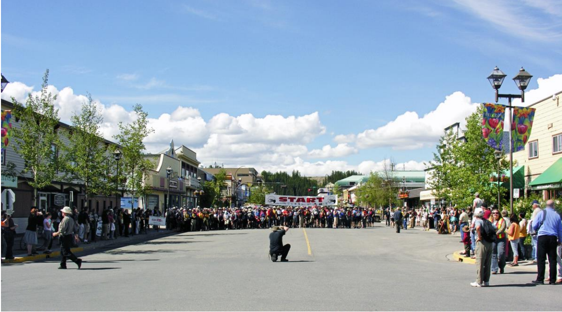
Race start on Main Street Whitehorse – June 25, 2008 (In Whitehorse)