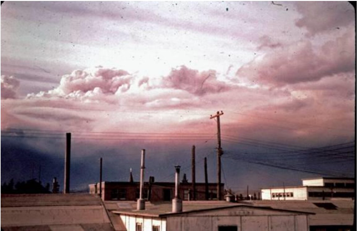
(In Ottawa)