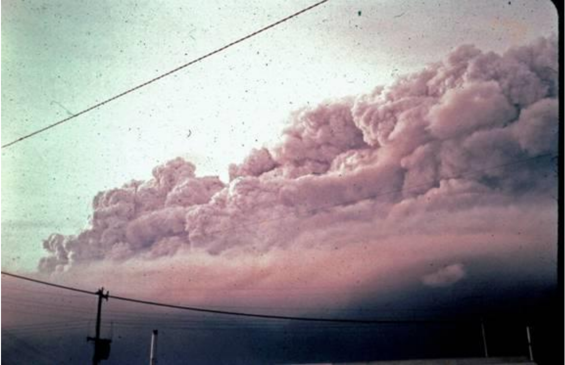
(In Ottawa)