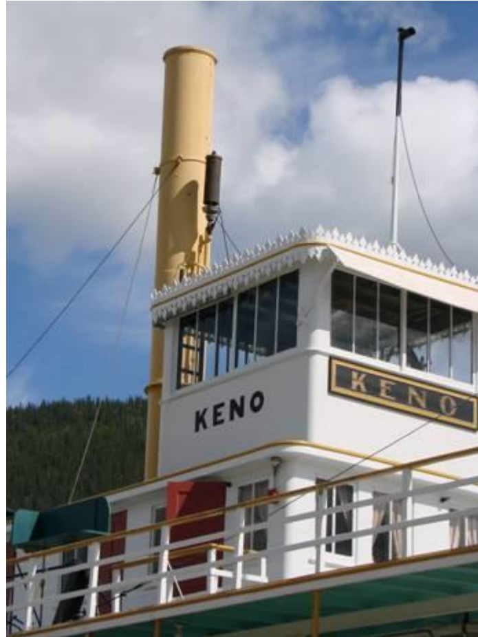
The whistle on the SS Keno helps Dawson keep time twice a day.

The whistle on the SS Keno is now blowing twice daily, once at noon and again at 5 o'clock.