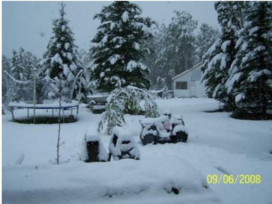
We got snow in the Junction, the picture taken at 7:30 am this morning. (In Haines Junction)