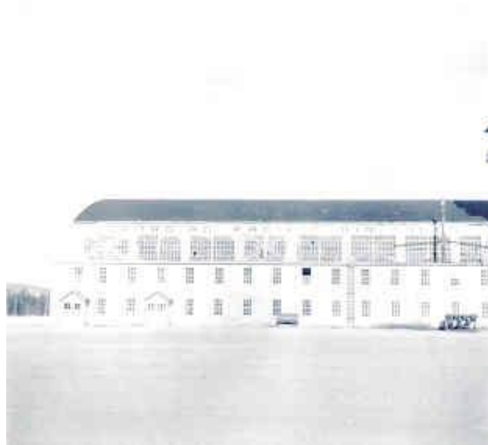
Canadian Pacific Airlines leased this then DOT hangar - photo taken 1951-52

Some years later, the tower on the hangar with the Canadian Pacific Airlines sign was revamped by the RCAF and then became the operational Whitehorse Airport tower. By the way, the above mentioned hangar was built during the war by and for the RCAF. The three hangars on the other side of the airfield (call the military side) were built for the American Army Air Force. (Don't know who the constructors were).