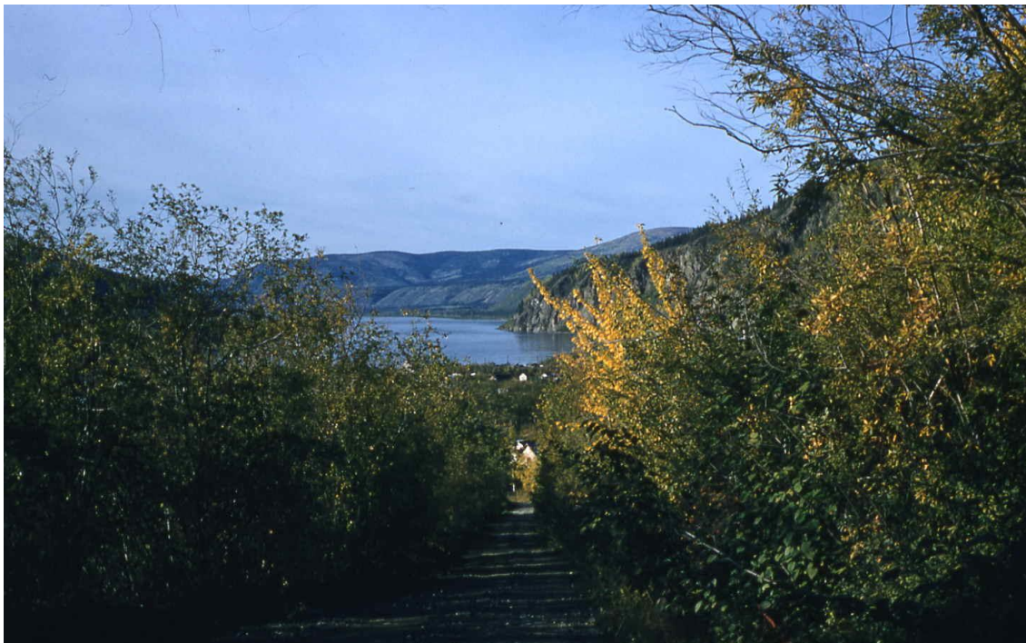
A first sign of approaching fall was the turning of the leaves on the AC Trail. [‘AC’ stands Alaska Commercial Company]