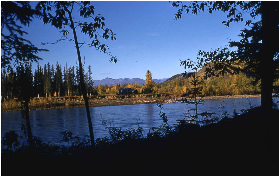
This is the SanSouci farm across the Klondike River as seen from in front of the Rock Creek cottages.