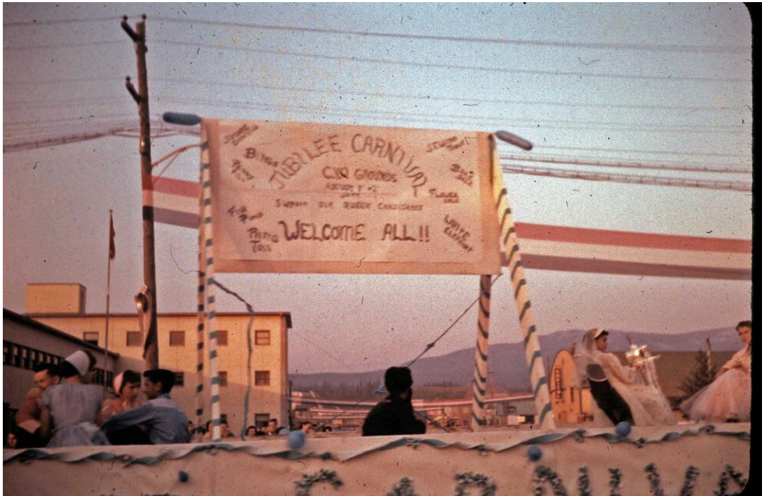
Jubilee Carnival Float – Whitehorse – 1958 Who can tell us about the Jubilee Carnival.