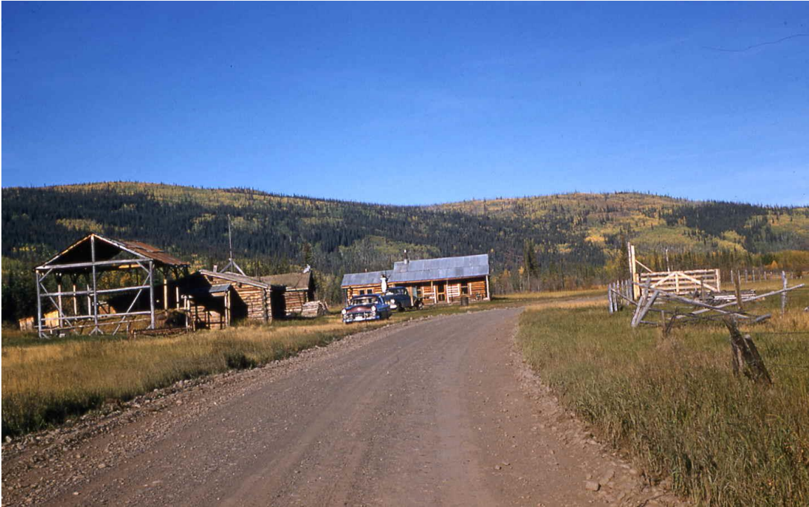
This is Henderson's Corner and possibly the Strachan farm.