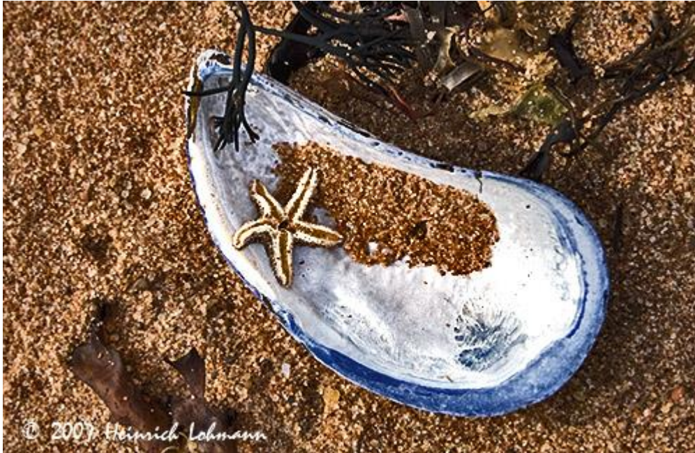
Shell and Star Fish