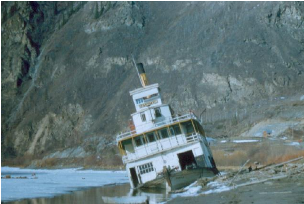
Sternwheeler Nasutlin - Dawson