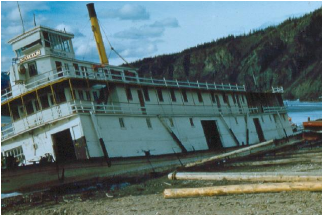
Sternwheeler Nasutlin - Dawson