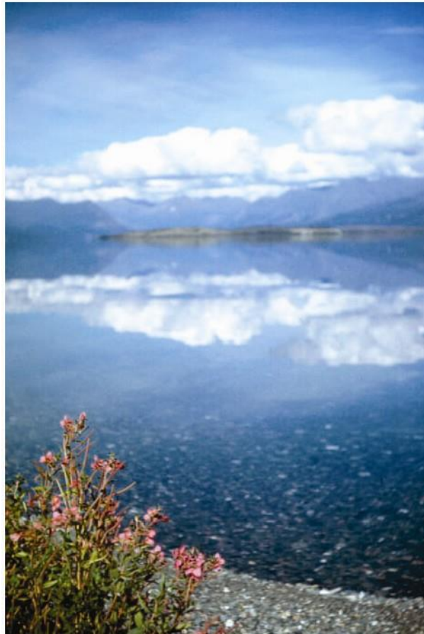
Across Kluane to Big Arm from beach at Mile 1085