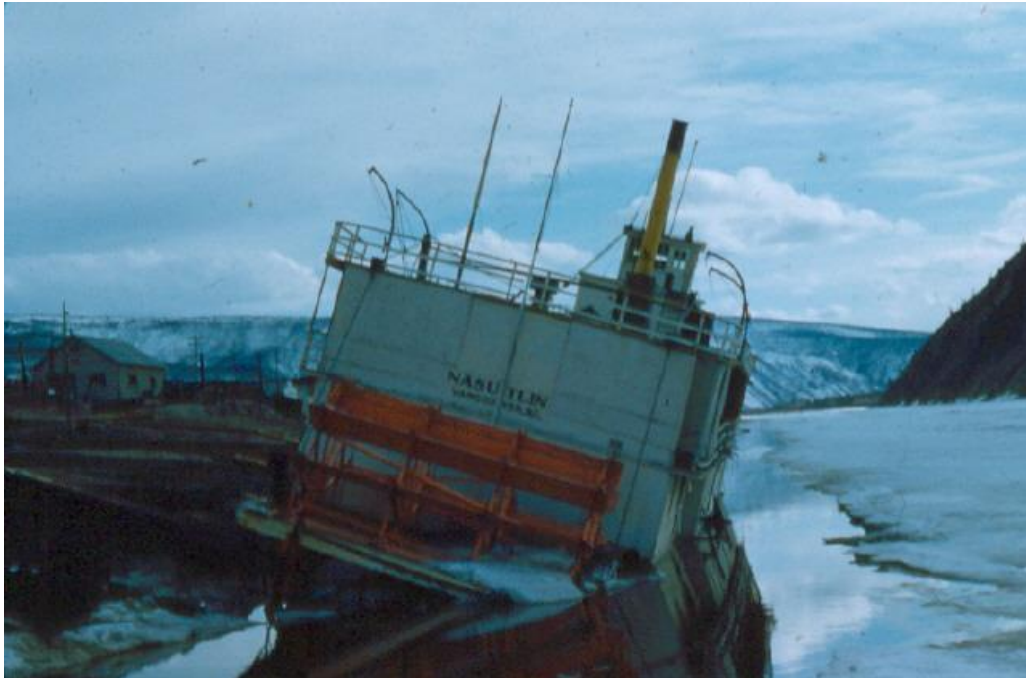
Sternwheeler Nasutlin - Dawson