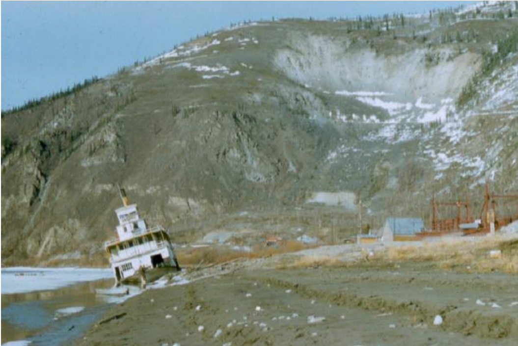
Sternwheeler Nasutlin - Dawson