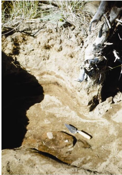
Knife and chip in situ in hearth, Mile 1085.5