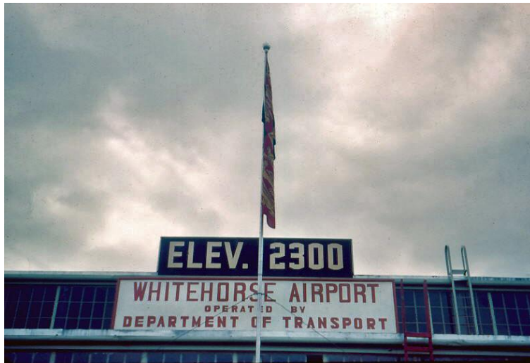
Early 1950's photo.

Slide lightened and cleaned by Heinrich Lohmann