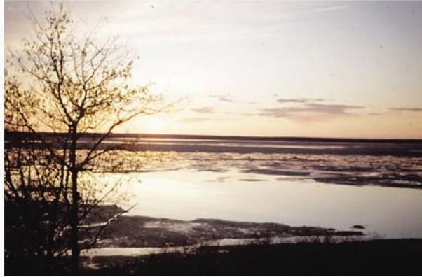
Sunset on Sturgeon Lake, Alaska