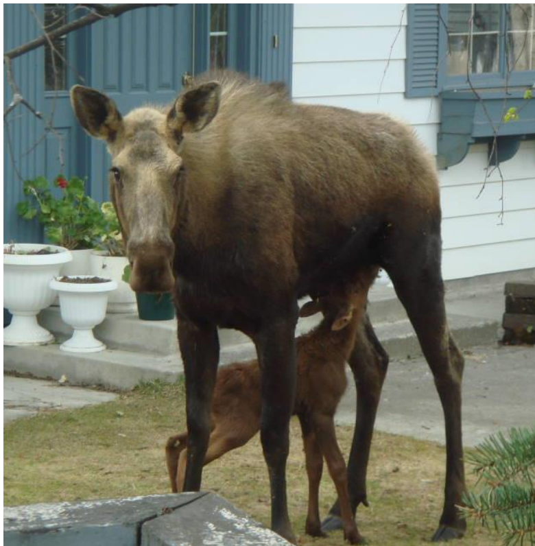
A 12 hour old baby moose feed near a home in Anchorage Alaska