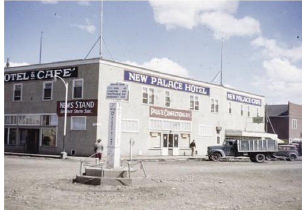
Centre of Dawson Creek, BC