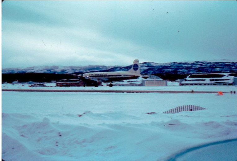
Whitehorse Airport – early 1950's