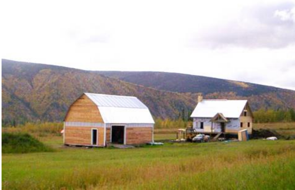
The Wilson's house and barn, showing the barn as it was before the twister demolished it.