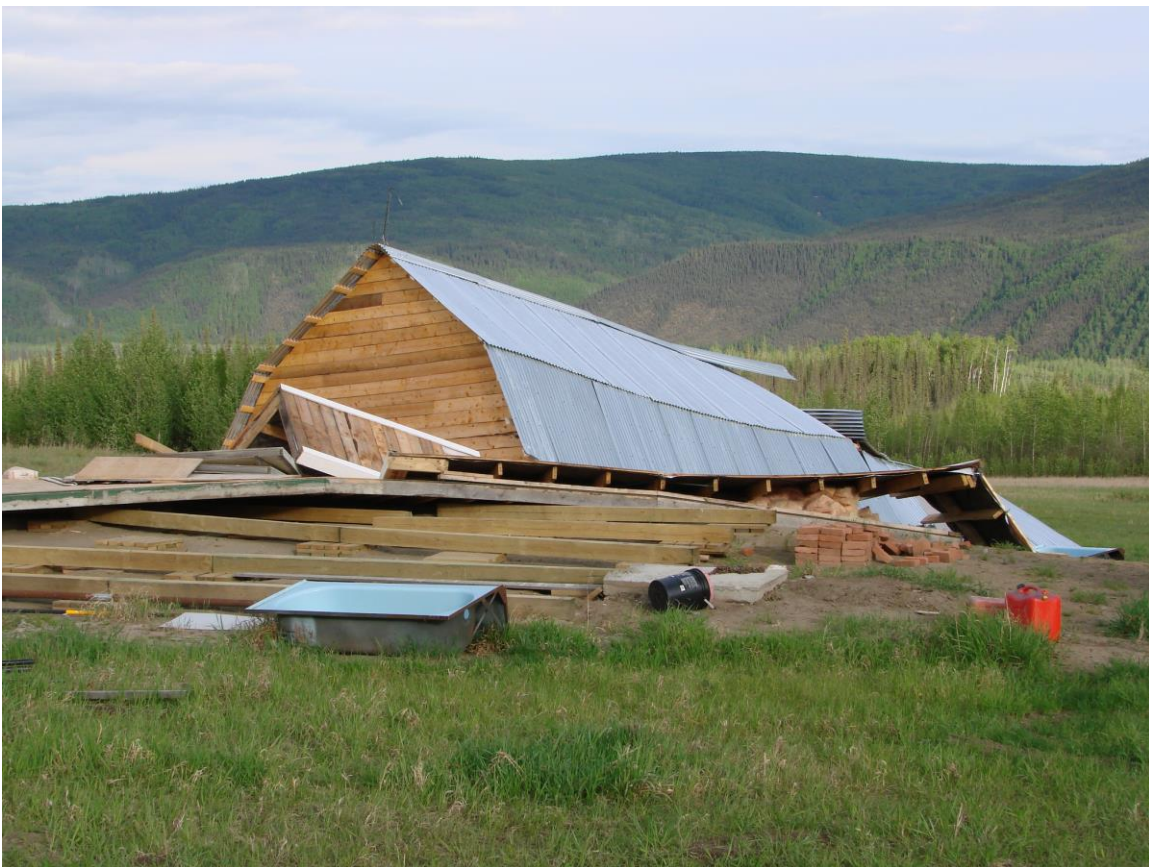
The barn as it is now, leveled by the whirlwind.