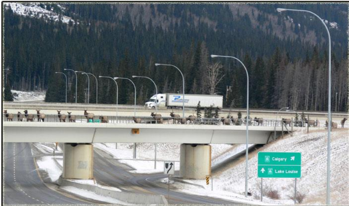
Elk crossing the highway at Banff!

For all of you that may not know it, this is the actual turnoff from Banff to the # 1 highway to Calgary.