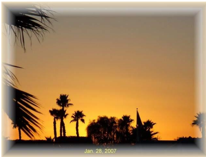
Sunset Jan 28, 2007 Yuma Arizona