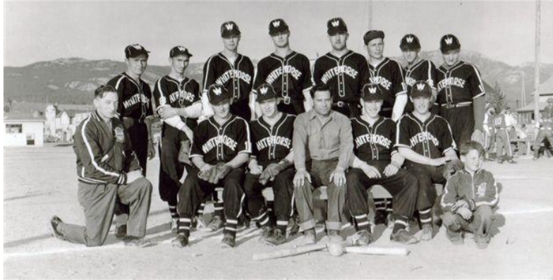
Team Photo #1 – Men's Whitehorse Team