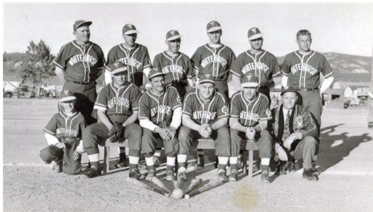
Team Photo #2 – Men's Whitehorse Team