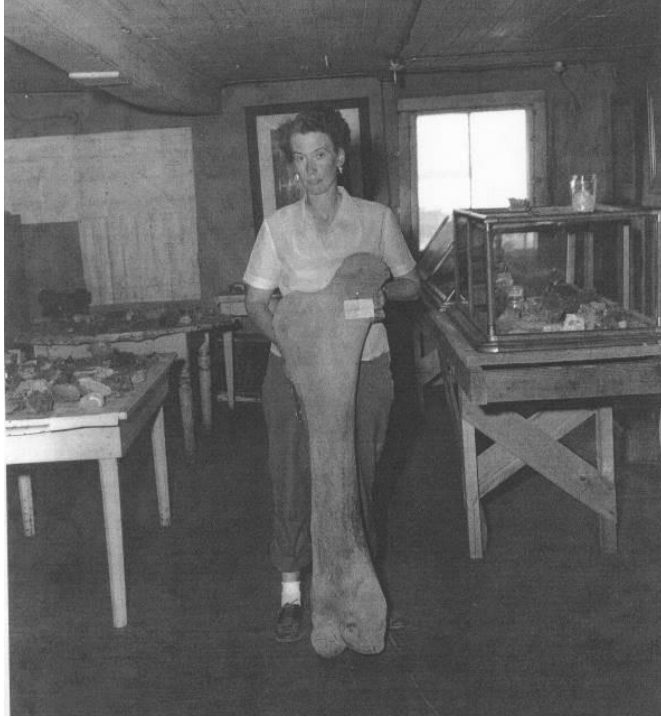
Can you identify this lady ?

Kathy Gates kmgates@northwestel.net (In Whitehorse)