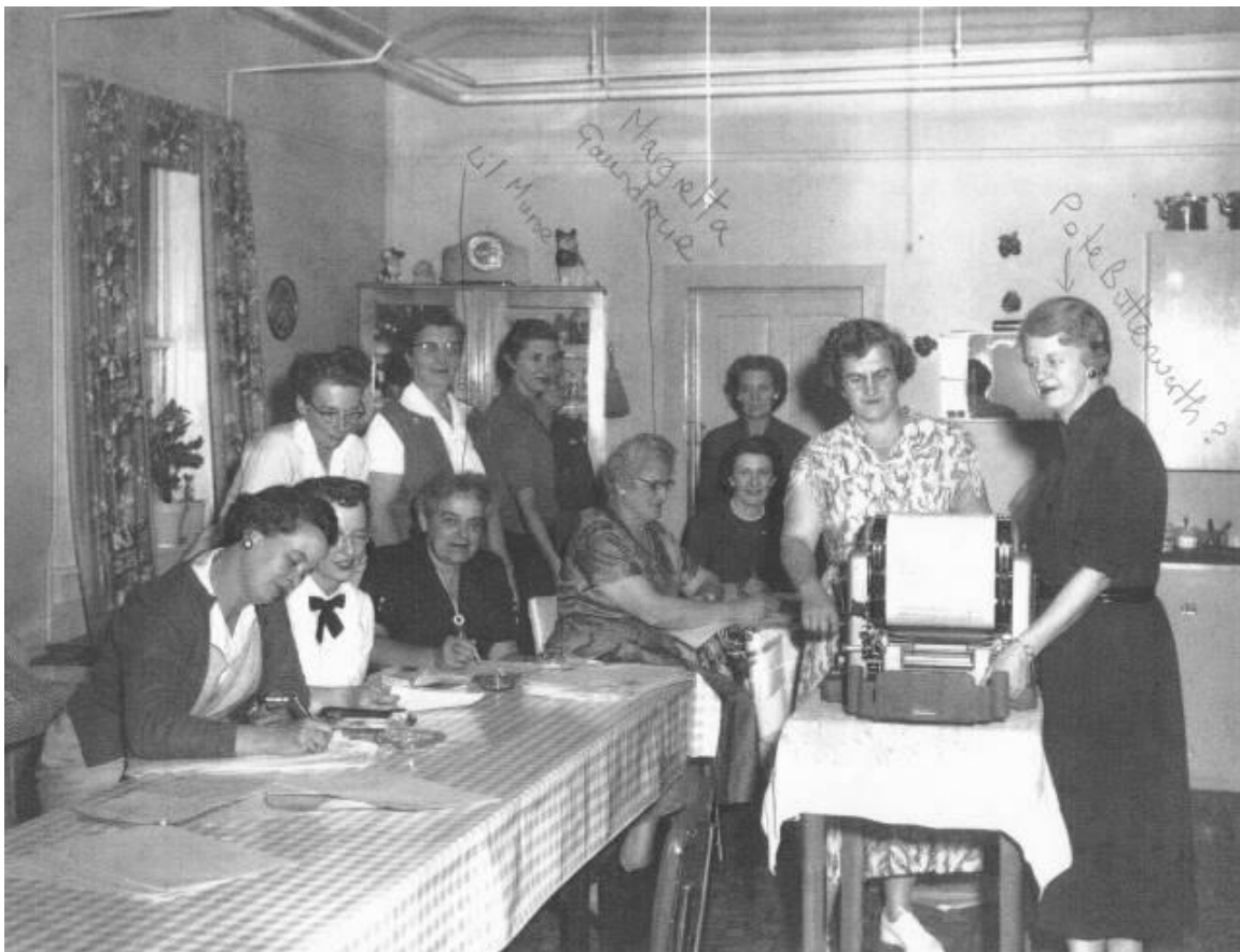
Can you identify others in this photo?

While readers are thinking of all those women in the Nutty Club photo, maybe some of you helped put the Klondike Korner to bed, so perhaps you have stories of the wonderful and wild times had with the Gestetner and stapling and addressing all those issues over the years. And if you are interested, the Yukon Archives has almost the entire collection of the Klondike Korner on microfilm for anyone to read. They also have the collection of the 'Klondike Korner' minus one or two newsletters. They are a fascinating read about life in Dawson City, particularly at the middle of the last century.