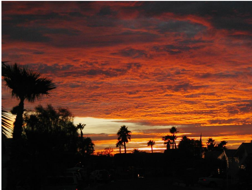
Yuma Sunset – Jan 10, 2007