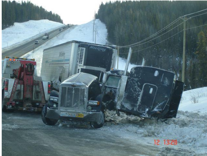
Another Truck Accident – this one at Mile 98