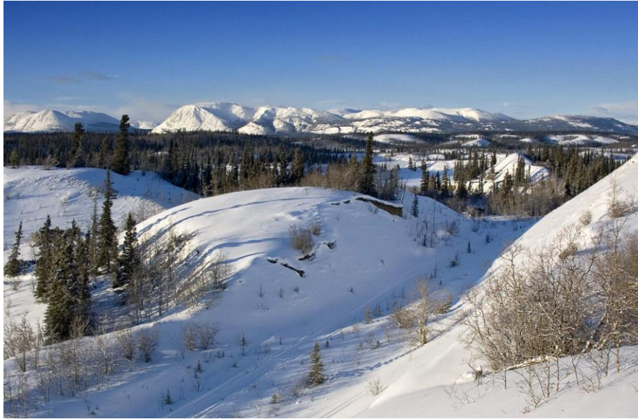
Lewes Lake area - 7 Jan, 2007