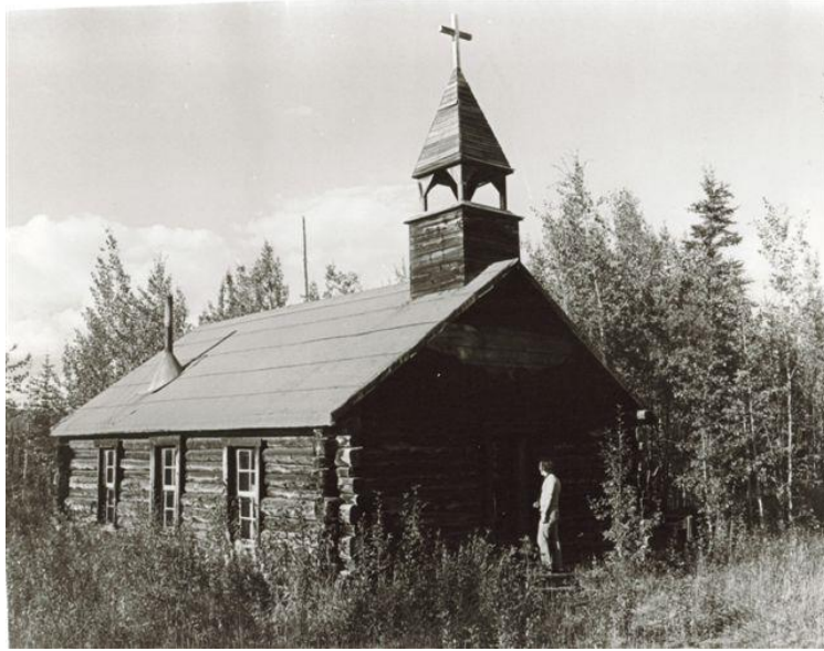
Log Church – Snag

(In Osoyoos)