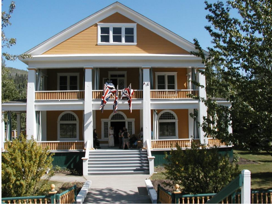
Historic site – Commissioners Residence – Dawson – June 10, 2006

To use an e-mail address from the MocTel, replace the * with @.