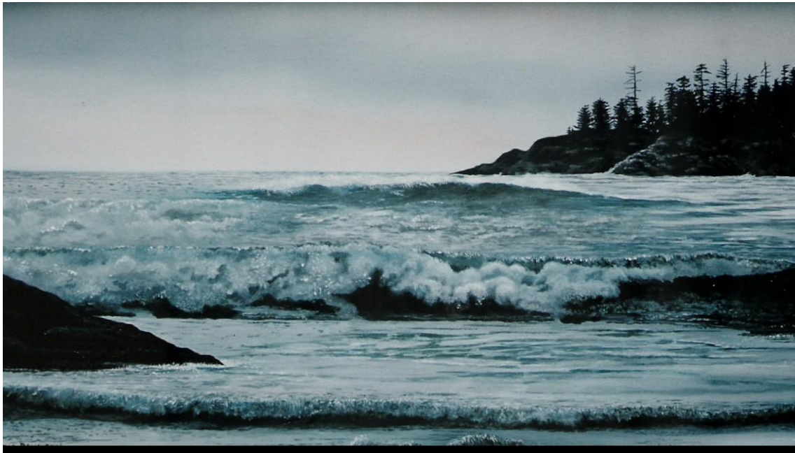
"Leonard Lighthouse Point", off Chesterman Beach, Tofino, B.C.