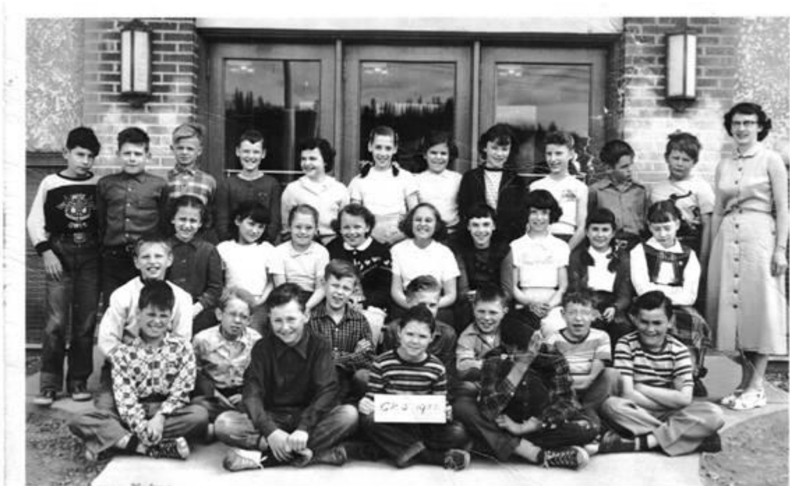
Grade 5 – 1955 – Whitehorse Elementary School