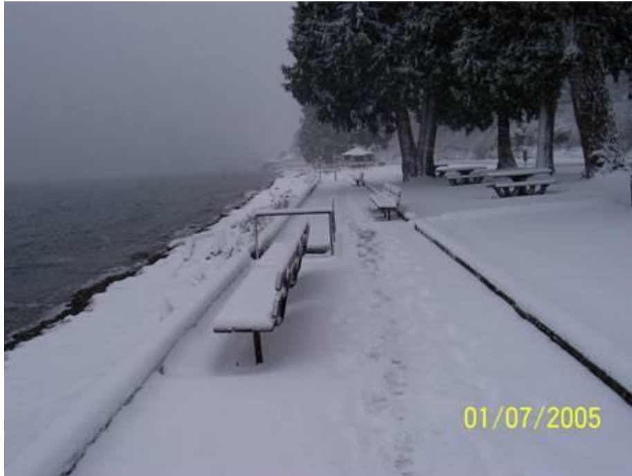
Qualicum Beach January 7, 2005

To use an e-mail address from the MocTel, replace the * with @.