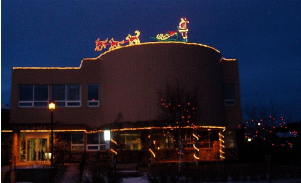
Whitehorse City Hall