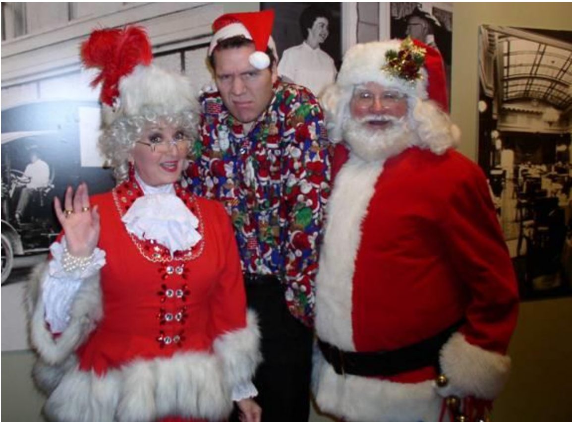
Mrs. Claus, the Grinch and Santa.