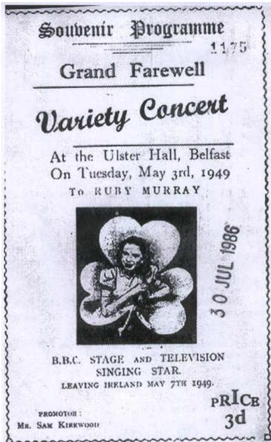
The programme of Ruby Murray's "grand farewell" concert in the Ulster Hall.