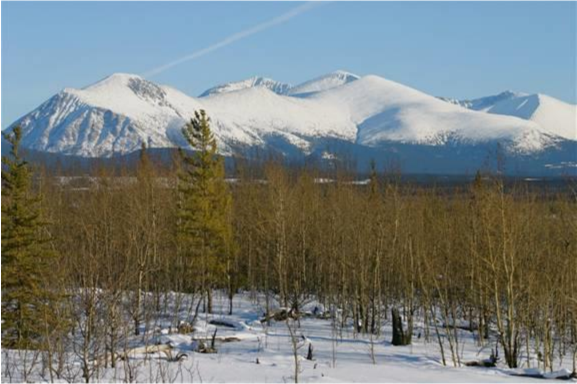
October White - Alaska Highway - Takhini burn viewpoint. (2004)

To use an e-mail address from the MocTel, replace the * with @.