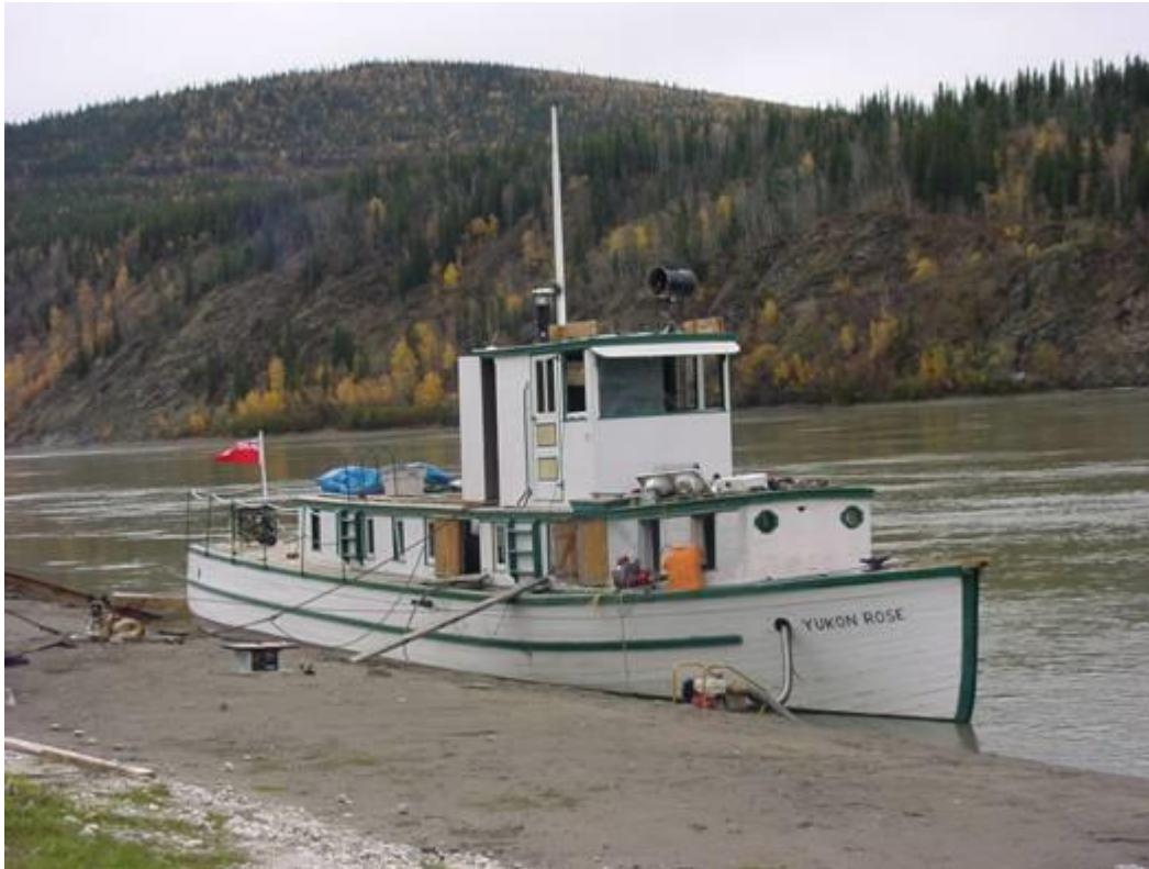
The Yukon Rose has a rebirth and her keel rides the Yukon River again