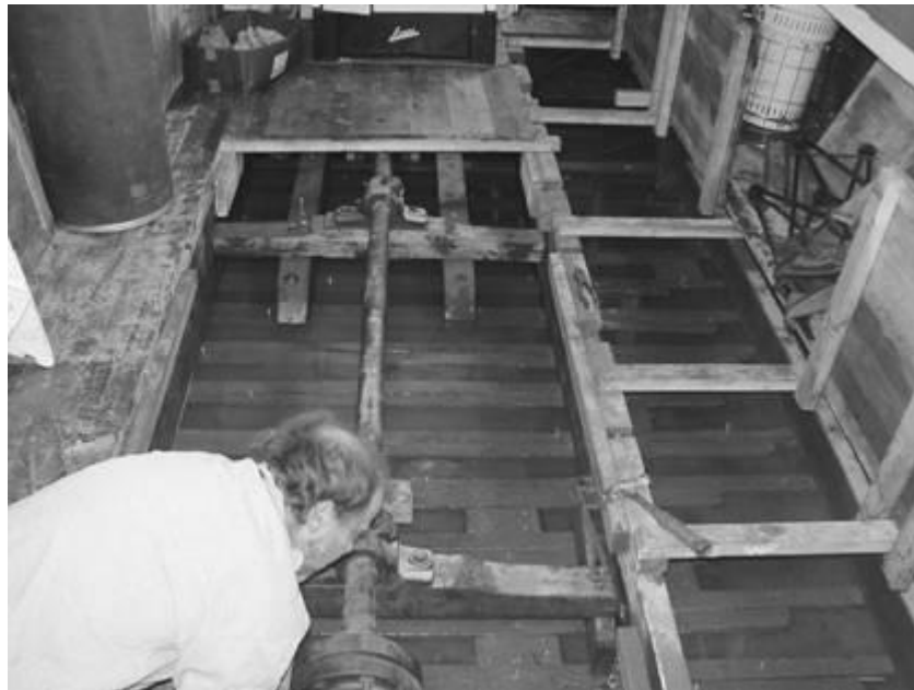
Marc Johnston and the drive shaft. Photo courtesy Dan Davidson (In Dawson City)

“When I brought oak up here to bend into ribs, I (used) a little meter which measures the water content of wood. It was in the neighbourhood of 27 per cent. By the time I’d finished actually bending (the planks) and using that stock, (it) was down to seven per cent just from sitting there. The last ribs I put in I was steaming five or six times as long as I was the first ones.”