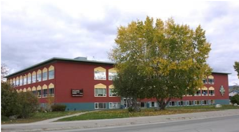
Whitehorse Elementary School

Tim Kinvig kinvig@ykn.net (In Whitehorse)