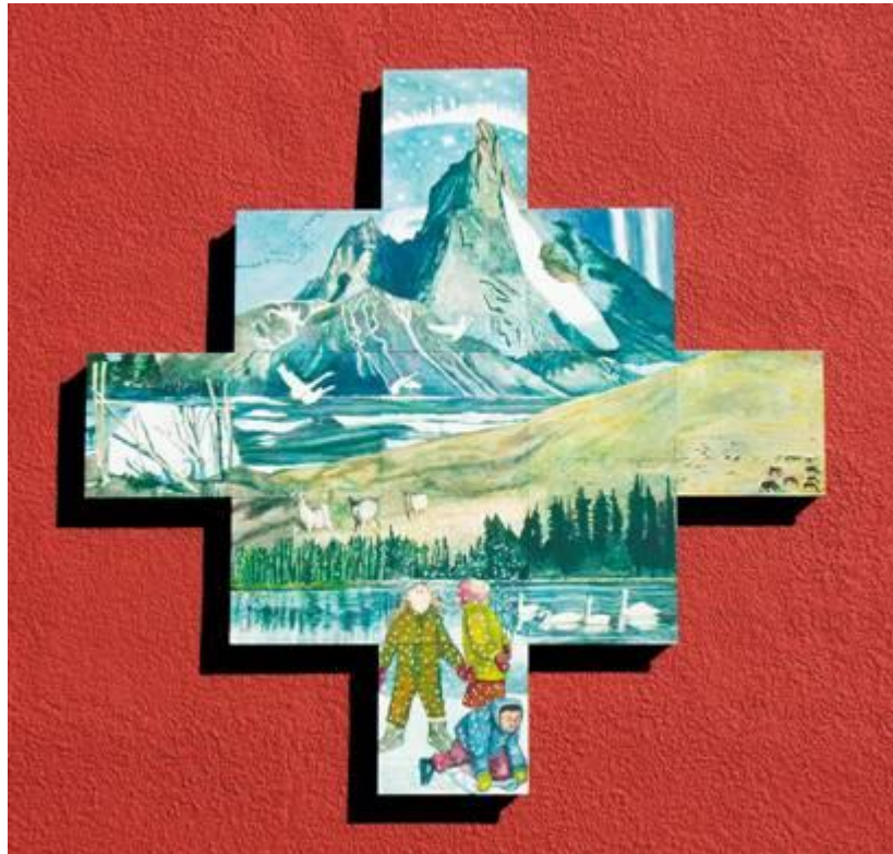
Mural on Whitehorse Elementary School (In Whitehorse)