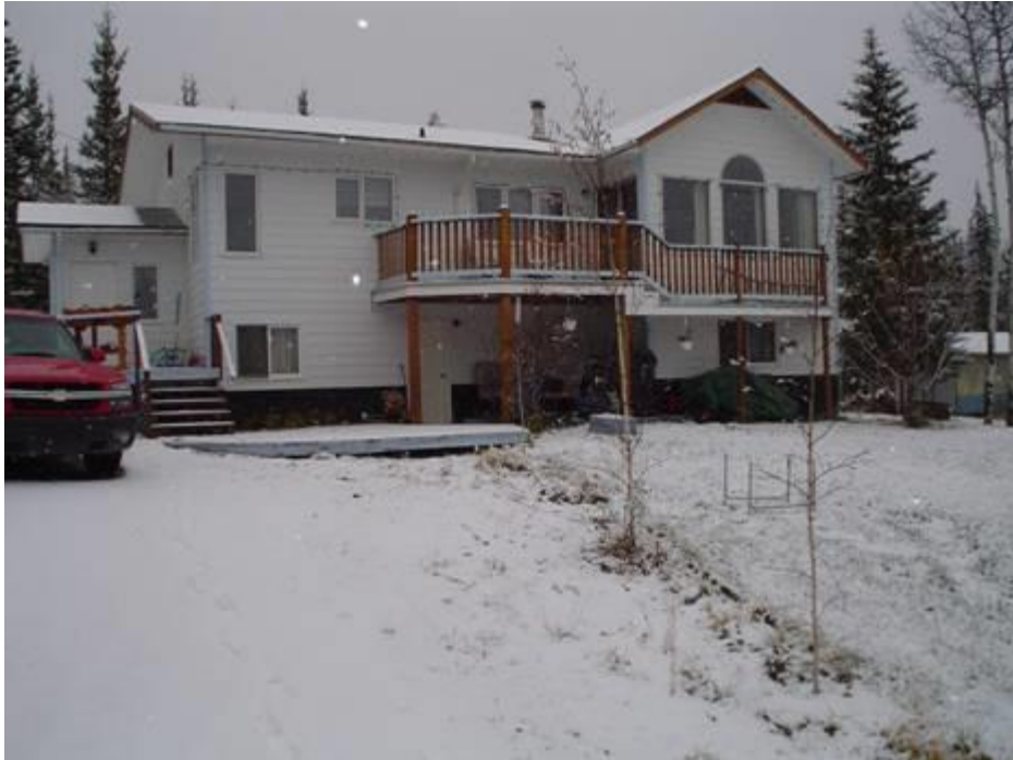
Haines Junction - October 11, 2005

(In Haines Junction )