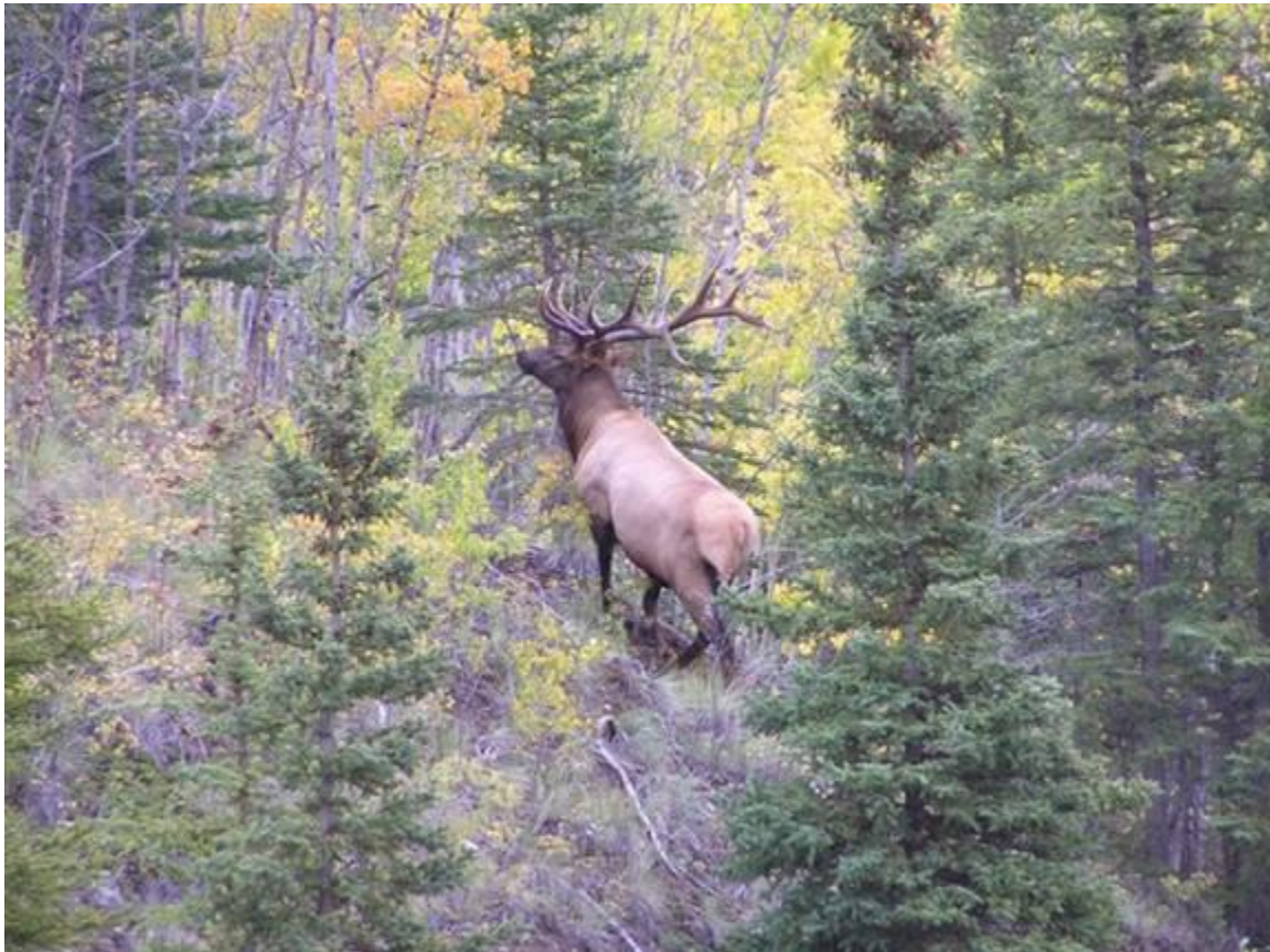
Elk - Below Five Finger Rapids – August 2005

To use an e-mail address from the MocTel, replace the * with @.