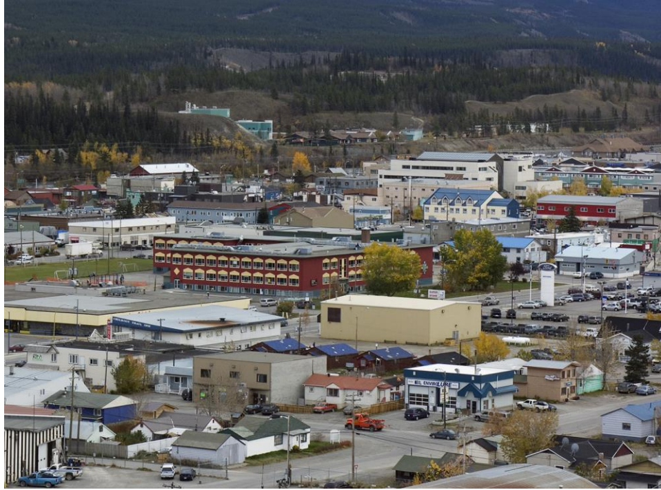
View of Whitehorse Elementary School from escarpment. (In Whitehorse)