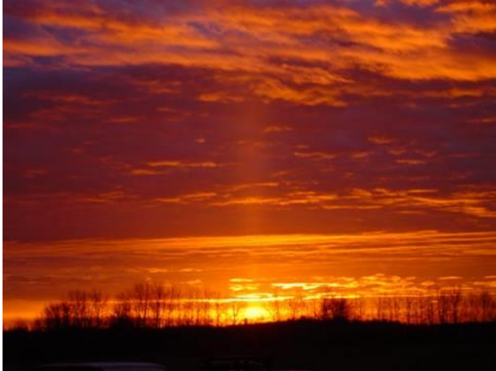
Sunrise – 7:57 – Oct 13, 2005 – Ardrossan Albera