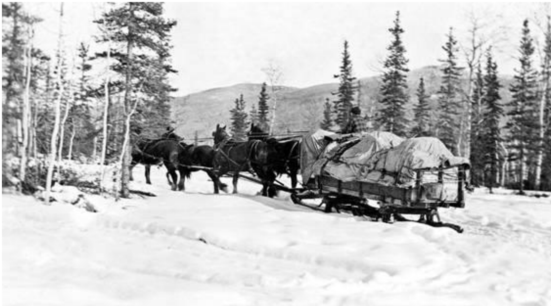
Four horses and one Sleigh on the Overland Trail circa 1926-28