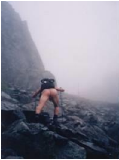
Climbing the Chilkoot