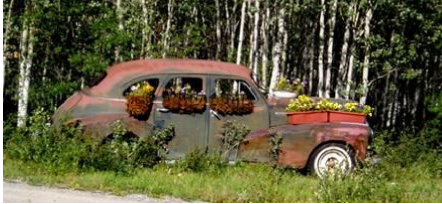
(In Whitehorse)

To use an e-mail address from the MocTel, replace the * with @.