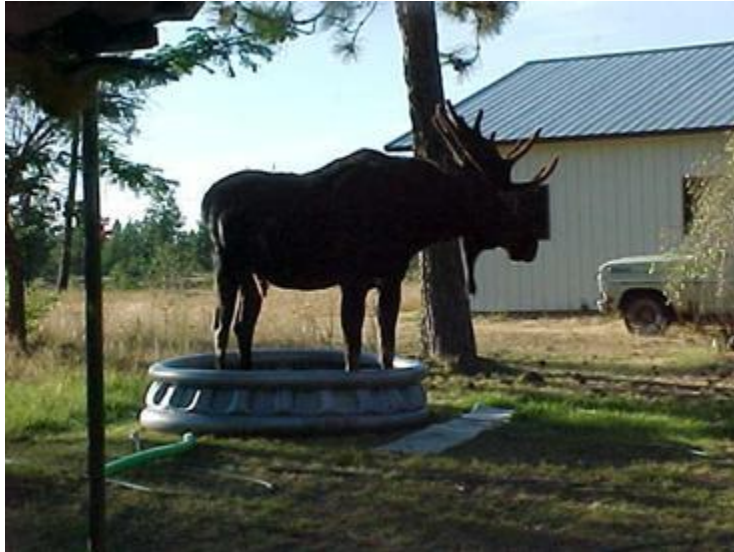
Photographer & place unknown