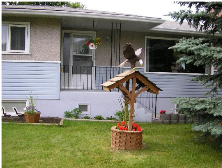
Here is one of finished product and mounted on wishing well in front yard.