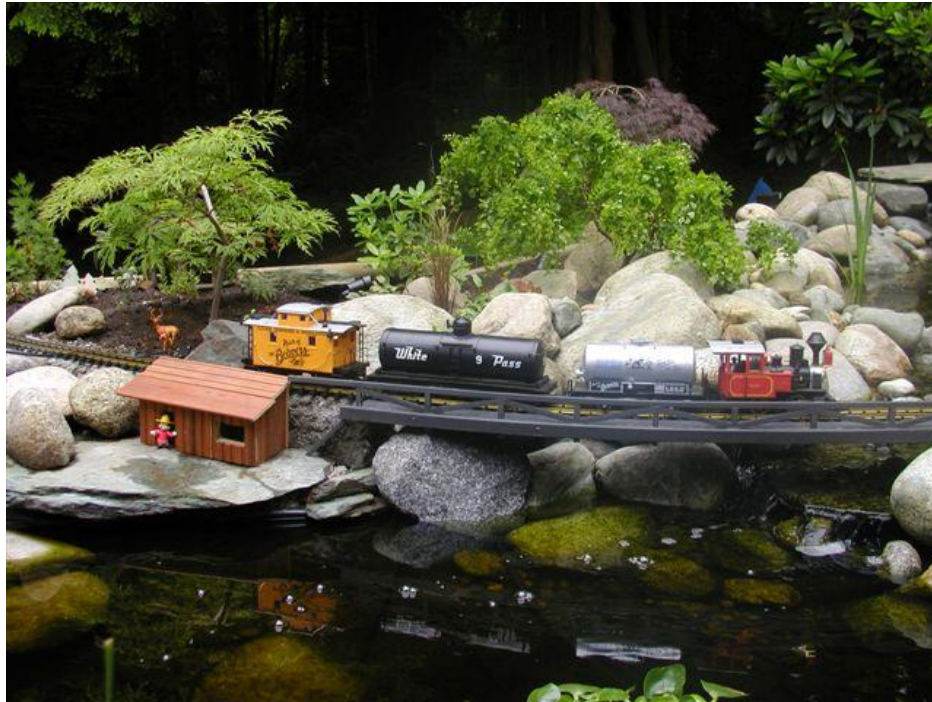
White Pass Train

We went to visit my brother and wife in Crescent Beach last weekend to see his new fish pond. He had a surprise for me, as you can see.