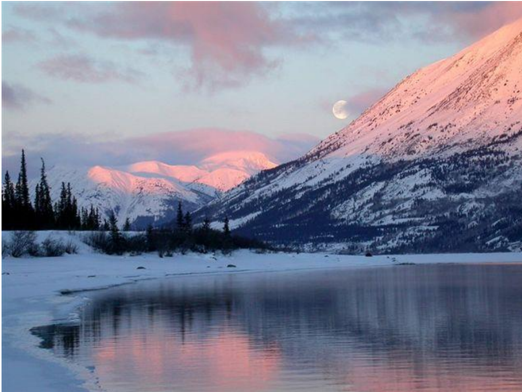
Morning - Bennett Lake

Photographer is unknown to MocTel. Photo was a forward to Gillian Campbell.