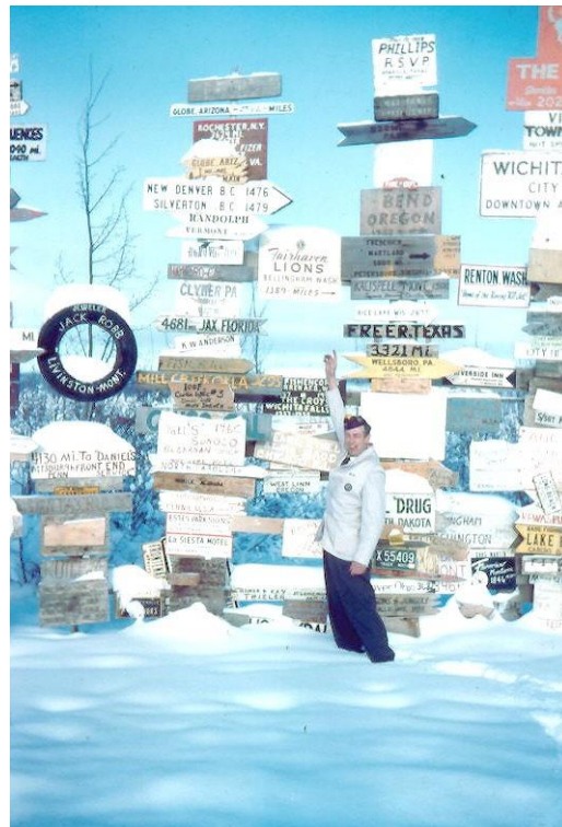
Whitehorse Lions visit to Watson Lake 1961

See how the lilies of the field grow. They do not labor or spin. Yet I tell you that not even Solomon in all his splendor was dressed like one of these. Mt. 6:28