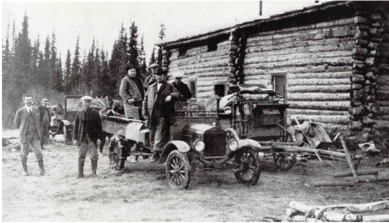
Junction Roadhouse – 1920's

lodging and a change of horses. It was a very cold ride but the passengers wore fur coats and hats and could warm up every four hours or so at a roadhouse.