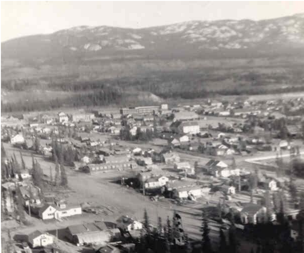
Whitehorse, taken from RCAF Airbase 1950 Center - Canadian Military Hospital