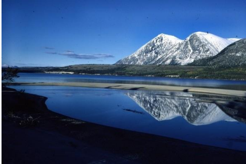
Kusawa Lake – Photo Courtesy Doug Bell

I can recall the names of several boys involved, but obviously can't mention them. Maybe one of them will come forward with the list of culprits.