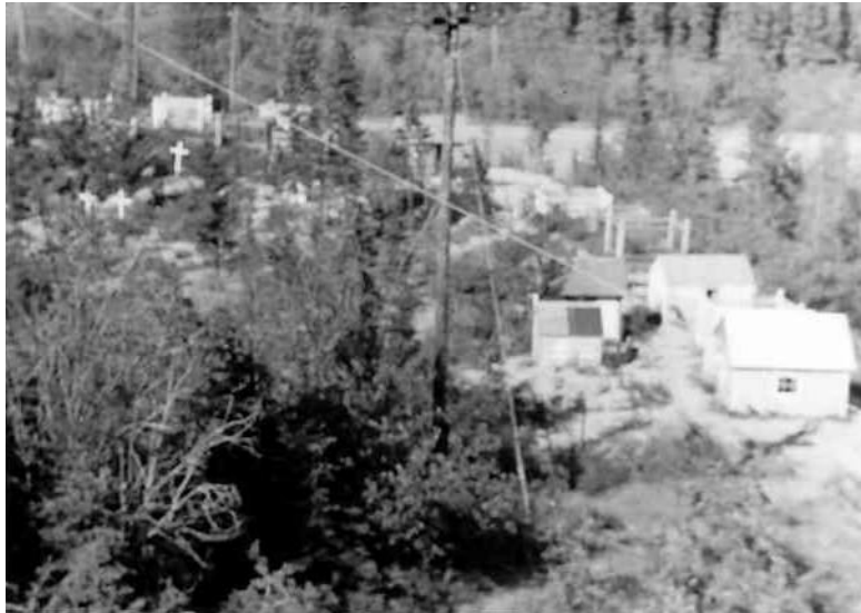
Whitehorse Indian Cemetery about 1949 Early road in background.

For an up-to-date picture of what Main Street Whitehorse looks like today click on http://www.whtv.com/webcam/streetcam.htm