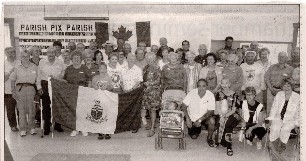
A LARGE gathering of former Yukon residents and their guests gathered to celebrate their heritage Saturday at St. Mary's Church Hall at the Vancouver Island Yukoners Picnic.