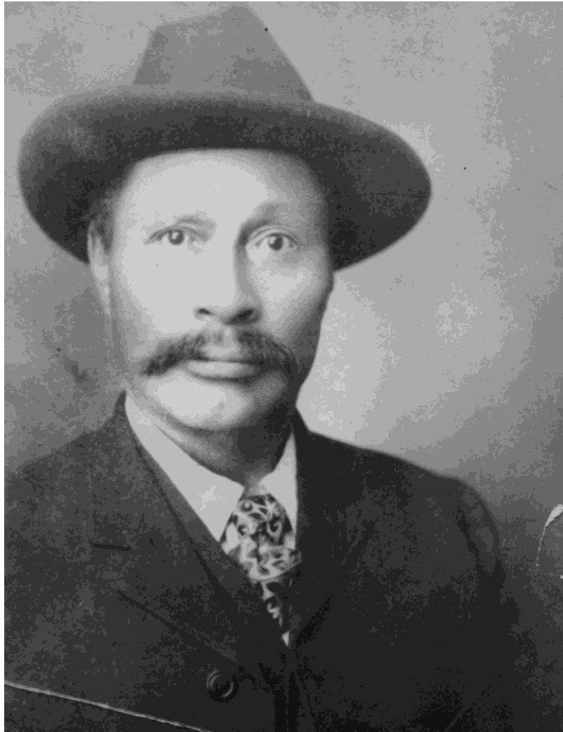
Yukon Archives, Whitehorse Star Ltd. fonds, 82/563, f85 #46

A Selective Bibliography of Archival and Library Material