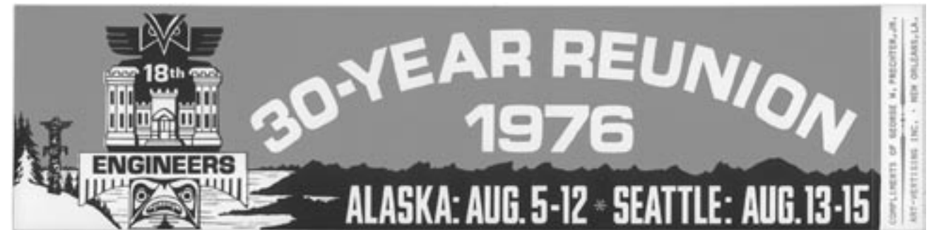
18th Engineers' 30-Year Reunion bumper sticker, 1976. Yukon Archives. U.S. Corps of Engineers, 82/250, COR 001.