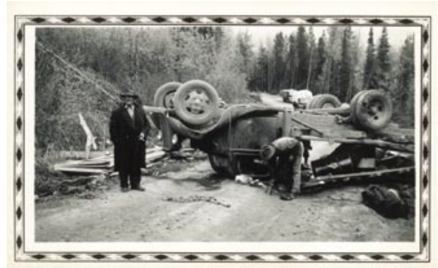
An accident on the Alaska Highway, 1943.