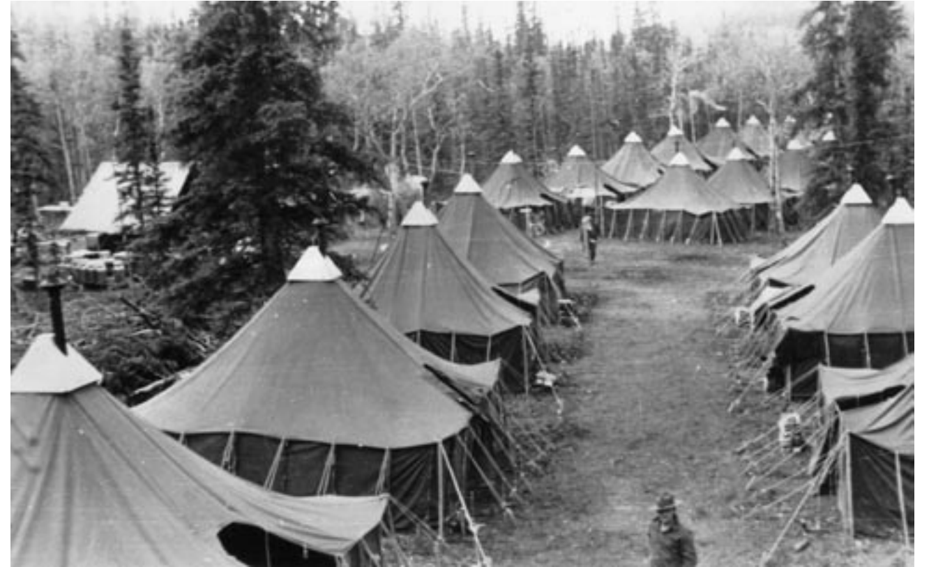
Army bell tents set up in a cleared area near Edith Creek, 1942. Yukon Archives. R.A. Cartter fonds, #1532.