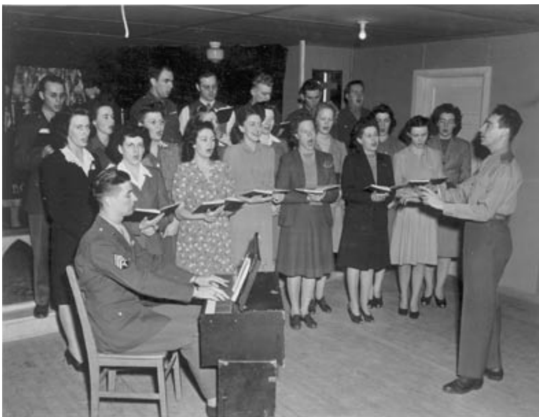
Protestant Chapel Choir.