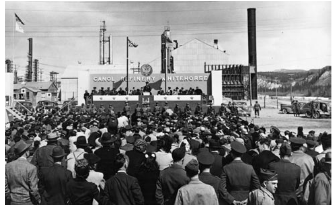
Dedication ceremonies for the Whitehorse Refinery, 1944.