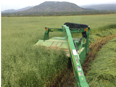
Harvesting oats planted with the no-till-drill.