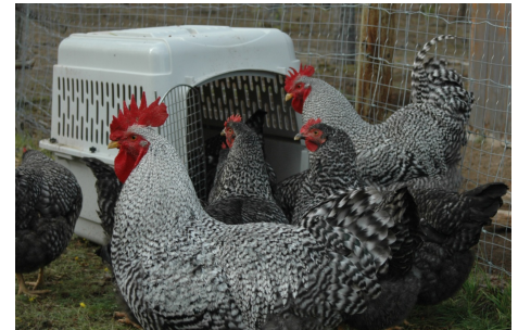
Our Curious Flock of Barred Rocks

So, you tried your hand at raising your own small flock of birds this year, and it's time to cull those meat birds, or your excess rooster population. Here in Yukon it's possible to have a small flock of less than 30 birds culled on the Mobile Poultry Processing Unit if you can find other 'small flock' farmers to join you in a community cull! If that is the case, how do you get your small flock to the processing unit if the location is not on your property? Easy, put the birds in a medium or large dog kennel/crate. It's a very safe, clean and inexpensive way to transport birds of any size. Most Yukoners care for 1 or 2 dogs; therefore a few empty kennels are probably kicking around gathering dust. Ask your neighbour, or check out a local yard sale. Like us, for example, we own 2 kennels and have only one small dog...go figure!