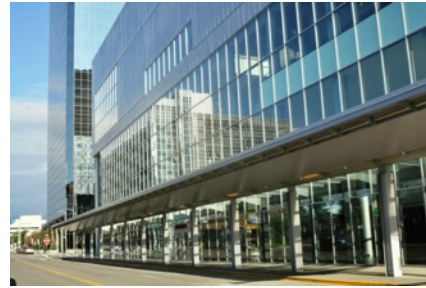
Dena'ina Convention Centre in Anchorage where the conference was held.