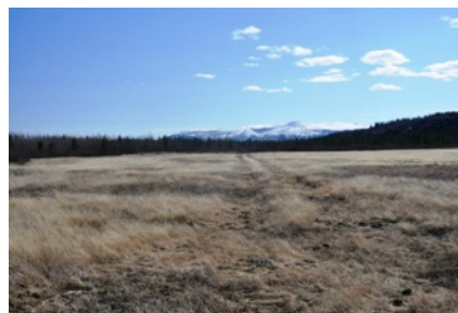
The YAA lease land, May 2013.

Gates open at 4.30pm, meeting starts at 5.00pm. All members and families invited, social event to follow the meeting!