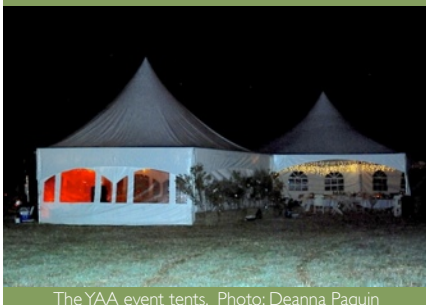
The YAA event tents.

If you want to rent the YAA farm equipment or tents in 2013, please call the office first at (867) 668 6864.