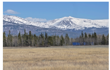
YAA leased land on the Mayo Road.

There is some firewood available on the YAA lease land. It was wind-rowed this March when the fence line was cleared. Please contact the office for more details about obtaining this wood: 668-6864 or admin@yukonag.com