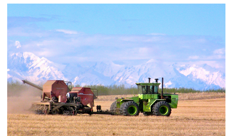
Harvesting barley in Delta Junction, AK.