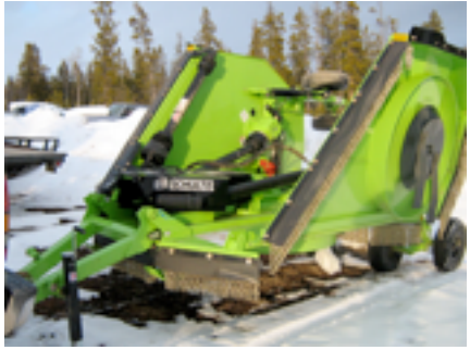
YAA Schultz 3 deck mower

If you want to rentYAA farm equipment in 2013, <u>PLEASE CALL THE OFFICE</u> (867) 668-6864!