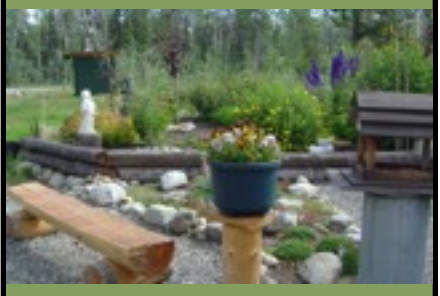
"Gardening in summer relaxes my mind and is a great way for me to get away from my office at home at times."

PLEASE JOIN US IN HELPING FURTHER AGRICULTURAL EDUCATION IN THE YUKON!