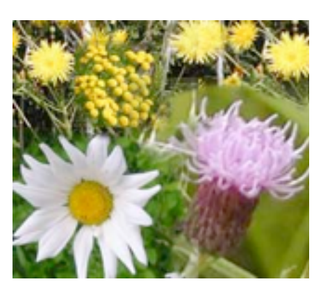
Invasive plants, photo courtesy of YISC website

The next Yukon Invasive Species Council meeting is Wed Nov 21, location TBA.