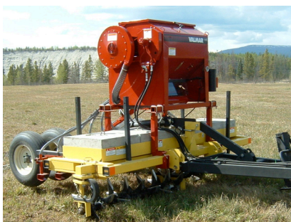
Aerway aerator -15 foot- with Valmar 1655 granular applicator/overseeder (needs approximately 100 + horse power tractor). Cost to rent: $185/day