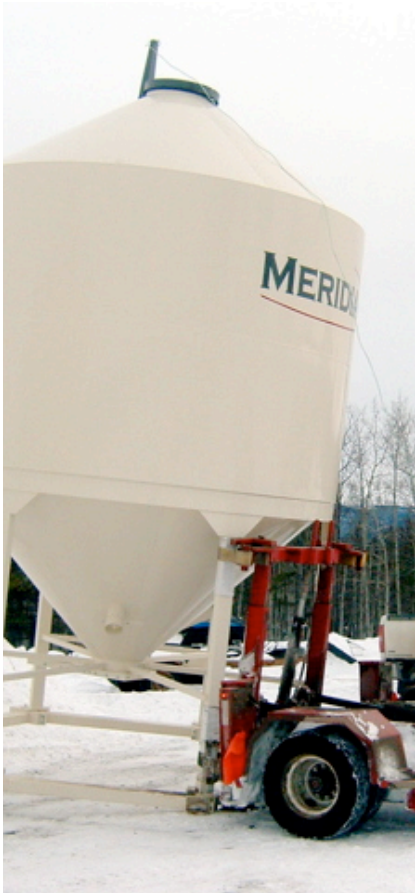
Delivering Fertilizer Bins