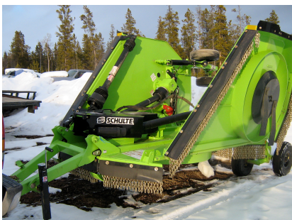
Schulte 1500 heavy duty mower - 15 foot (needs 65 horse-150 horse power tractor; can mow hay-trees). Cost to rent: $185/day

The power requirements for each will vary according to use and soil conditions, but generally more power is better. For information on renting any of the pieces of equipment below contact the YAA office.