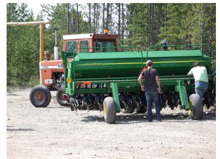
John Deere 1590 No Till Drill -15 foot- (needs approximately 100+horse power tractor). Cost to rent: $300/day