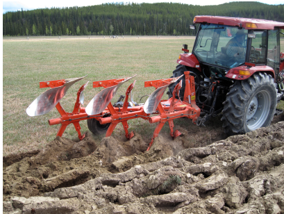
Kuhn 3 bottom reversible plough - 3 point hitch (needs approximately 85 -100 horse power tractor). Cost to rent: $130/day