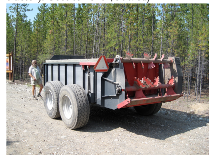
Leon 375 manure spreader (needs approximately 60 horse power tractor) Cost to rent: $160/day