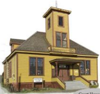
Atlin Courthouse Gallery