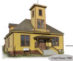
Atlin Courthouse Gallery