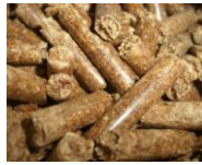
Wood Stove Pellets