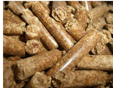
Wood Stove Pellets