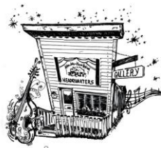
ATLIN ARTS AND MUSIC FESTIVAL HEADQUARTERS GALLERY

Open daily 12:00 am to 5:00 pm Credit- and Debit cards accepted