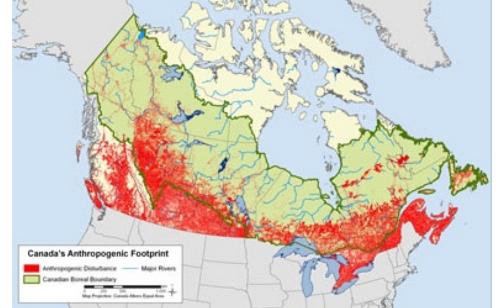
More roads = more human disturbances

But most importantly, roads improve access to otherwise remote areas. As science has shown us over and over again, access means extraction (often over-extraction) of natural resources: wildlife, trees, oil, minerals, you name it.