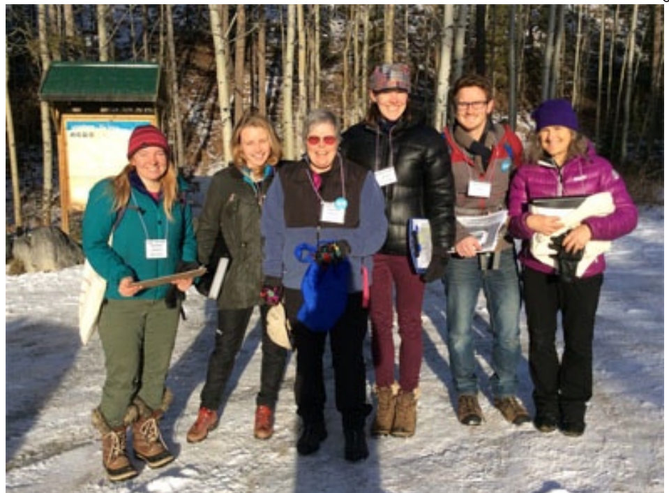
Staff and volunteers heading out on a final round of canvassing in Riverdale.