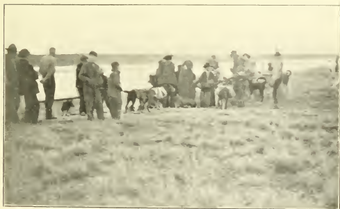
LaPierre House. Indians arriving with pack dogs at Fort Macpherson.