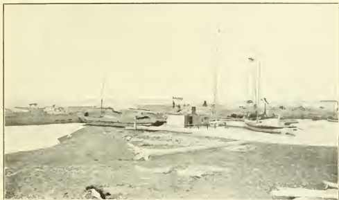
Police and Native Whaleboats in Shelter, Shingle Point, Arctic Coast.