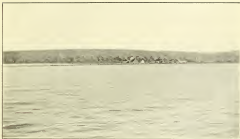
Police Post and Settlement, Herschel Island.