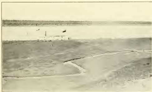
Yearly arrival Hudson Bay Co. steamer at Fort Macpherson, N. W. T.