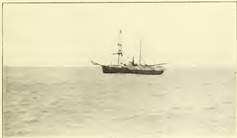
An Arctic steam whaler, the "Kariuk".