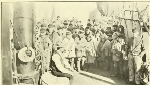
Eskimo on board whaler to trade.