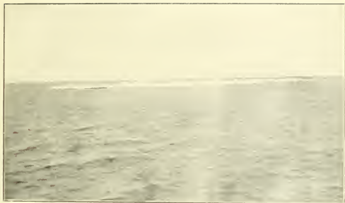
Floe Ice in the Arctic