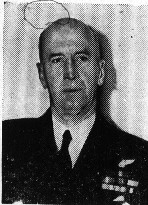
Commander-in-Chief of the United States Fleet.