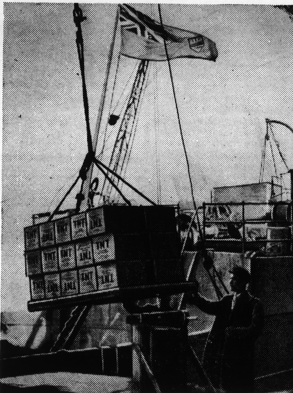
CANADIAN SUPPLIES FOR BRITAIN.